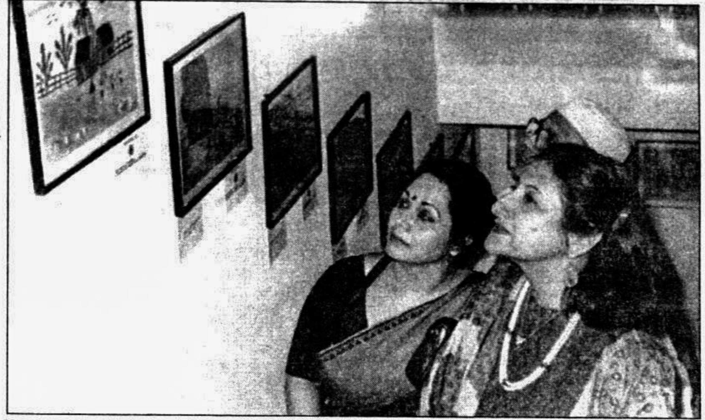
Visitors looking at children's paintings at an exhibition organised by ANZ Grindlays Bank in association with Zonta Club of Dhaka III at the bank's Gulshan Sales and Service Centre yesterday.

The wetland is also home to Bangladesh's only swamp forest that plays a critical role in the haor eco-system.