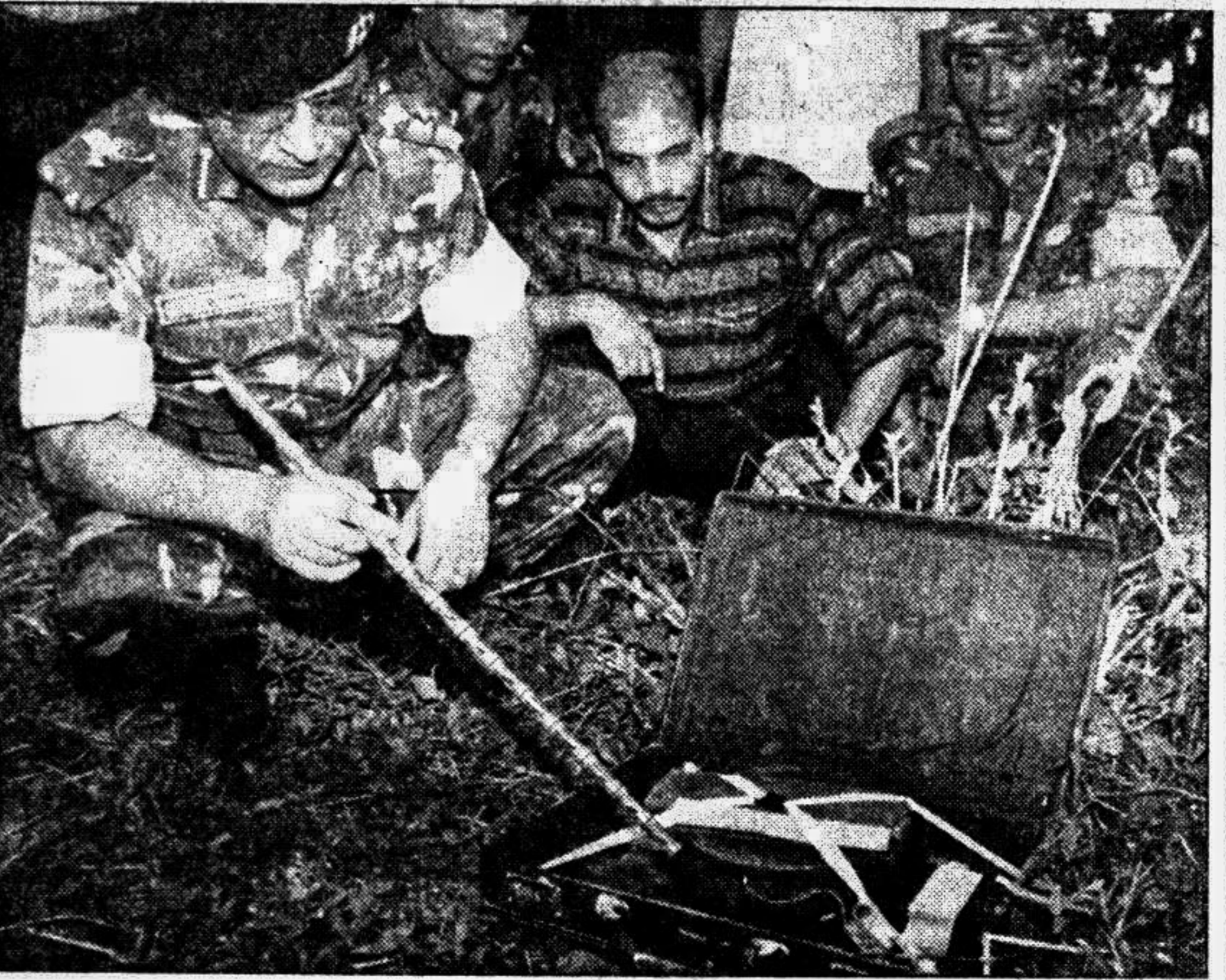
Army experts examining the explosives found at Janakantha office.

By Staff Correspondent A Tk 93.4 crore ECNEC approved waste management project of the Dhaka City Corporation has remained shelved since July due to lack of funds. Implementation of the DCC project, first of its kind, envisaging land filling of an additional 32 acres at Matuail and installation of at least two incinerators for city's clinical waste could not be started as neither the donor nor the government kept its promise, sources concerned said. After being approved by ECNEC on July 7, the only communication received by the DCC in this regard was a letter from the Netherlands Embassy of August 17. The ambassador said in the letter that only 50 per cent of the promised Tk 48.45 crore could be made available now under the Dutch Environment and Economic Self-sufficiency Programme (MILIEV). See Page 12 Col 1