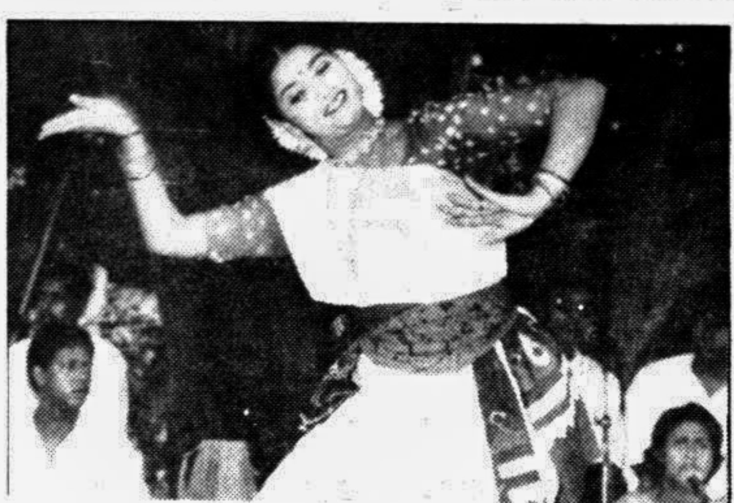
Artist of Chhayantun performing dance at a function in observance of the sharat usav at the Bakul Tala of the Institute of Fine Arts of Dhaka University yesterday.