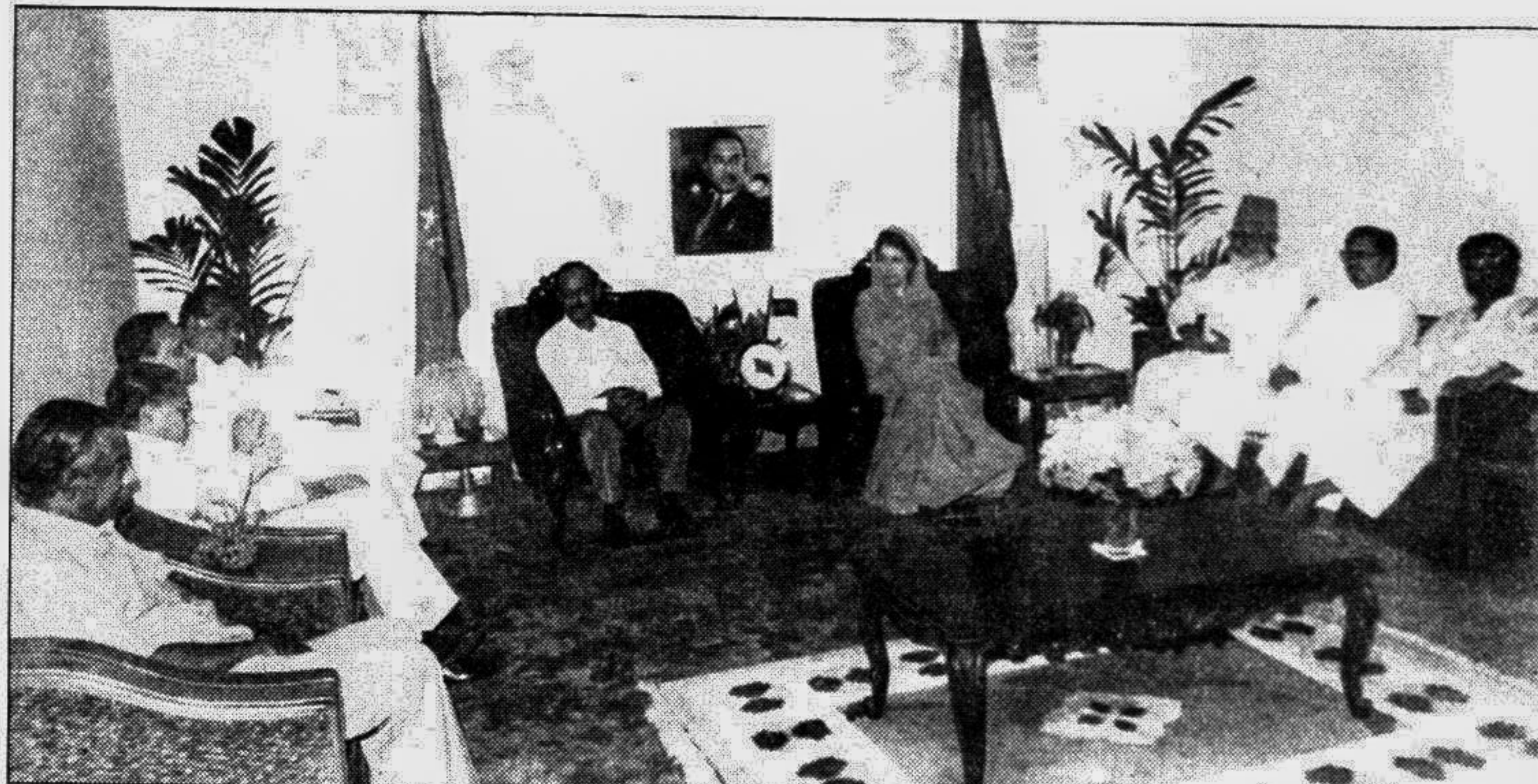
Secretaries general of BNP, Jatiya Party, Jamaat-e-Islami and Islami Oikya Jote and members of the liaison committee of the Four-Party Alliance met Leader of the Opposition in Parliament Khaleda Zia last night at her Minto Road official residence.

Sweets were found in two of the boxes and the other contained the explosives, police