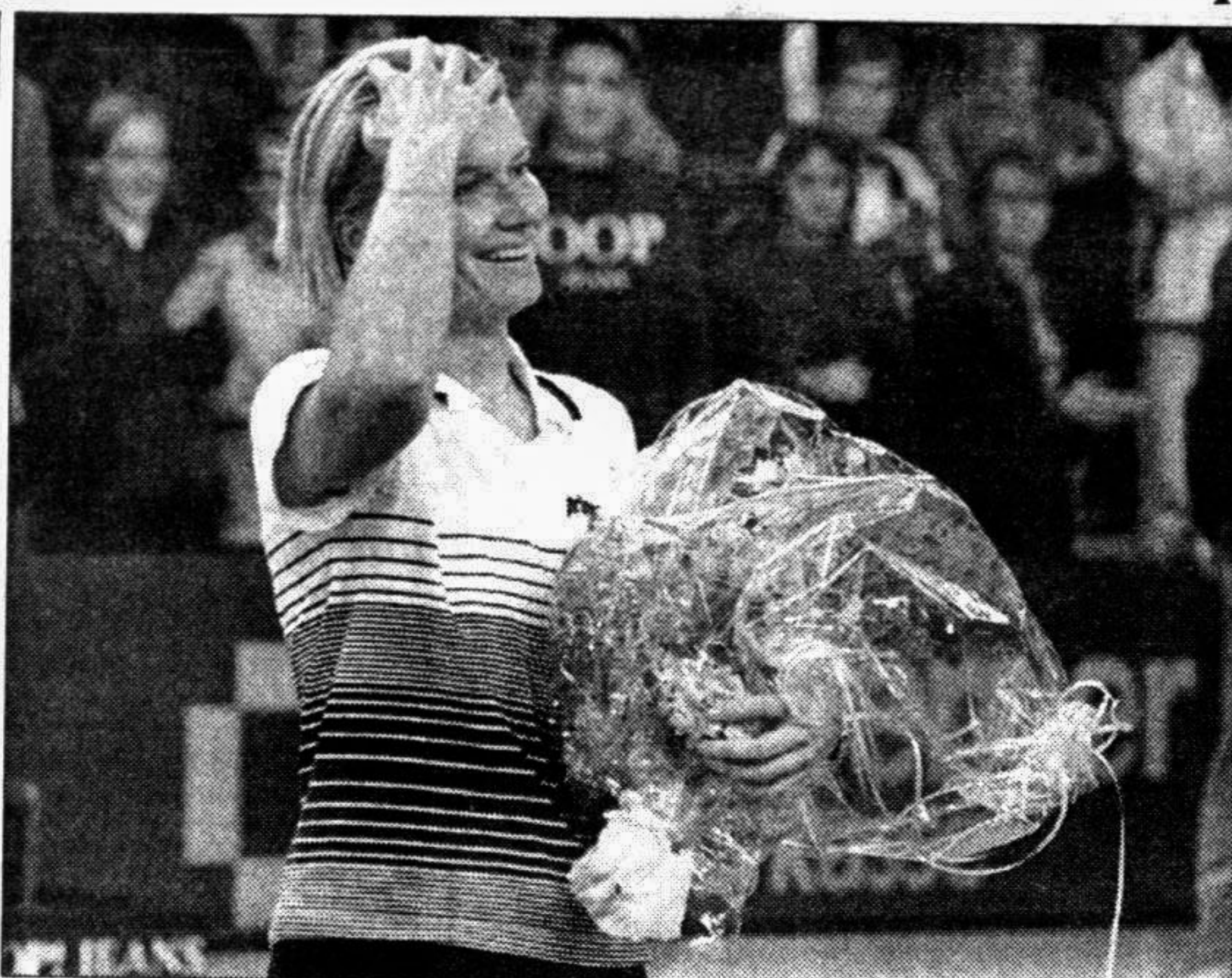
GOODBYE: Veteran Czech player Jana Novotna appears surprised during a ceremony in Filderstadt marking the ending of her tennis career.

British Davis Cup captain David Lloyd was furious his team were not seeded earlier this year when they were drawn against and ultimately beaten by the United States in the first round.