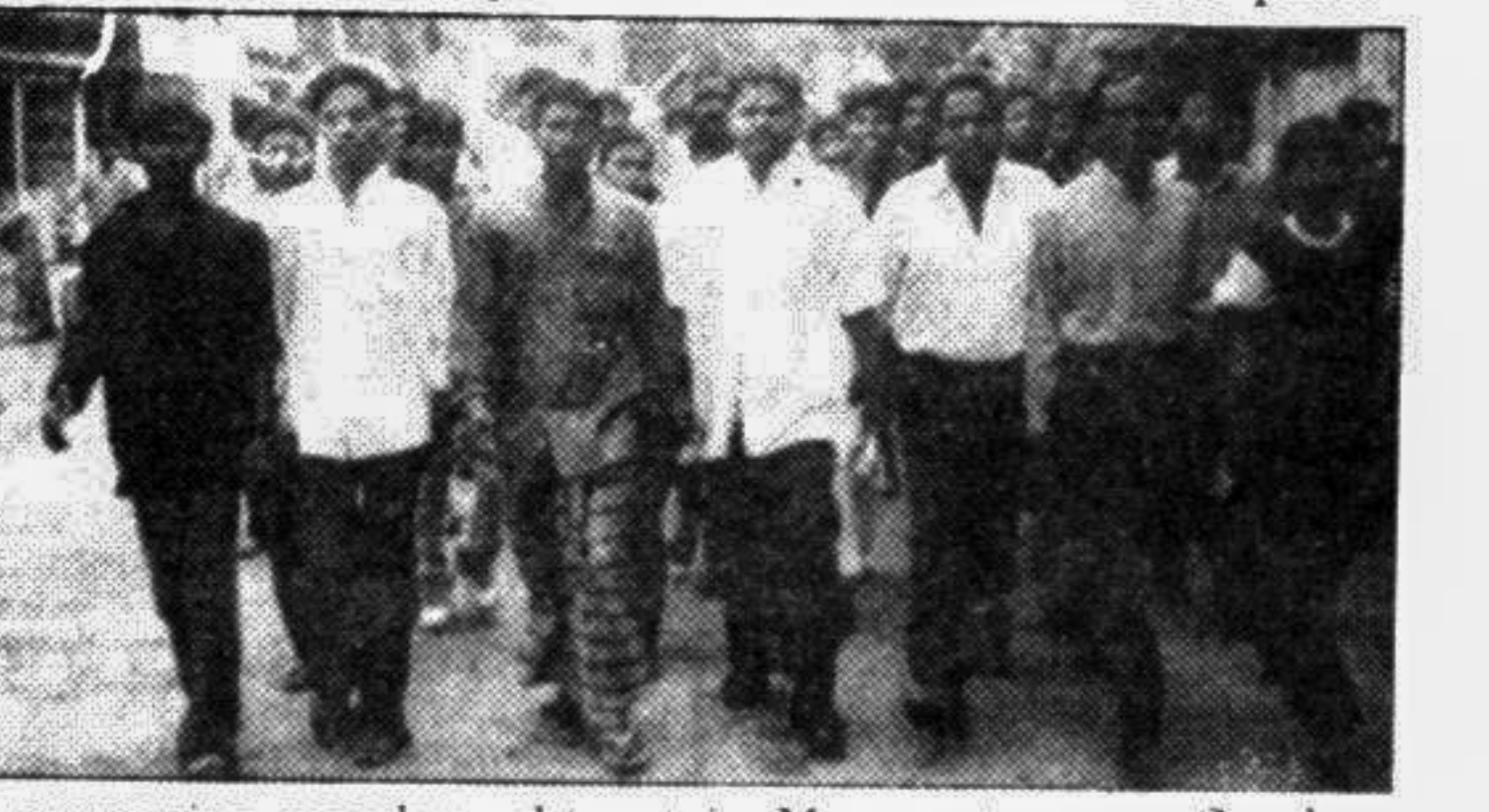
A procession was brought out in Magura town on Sunday by the villagers of Binodpur union in Mohammapur thana condemning the alleged misappropriation of rice sanctioned for VGF card holders by the local chairman.