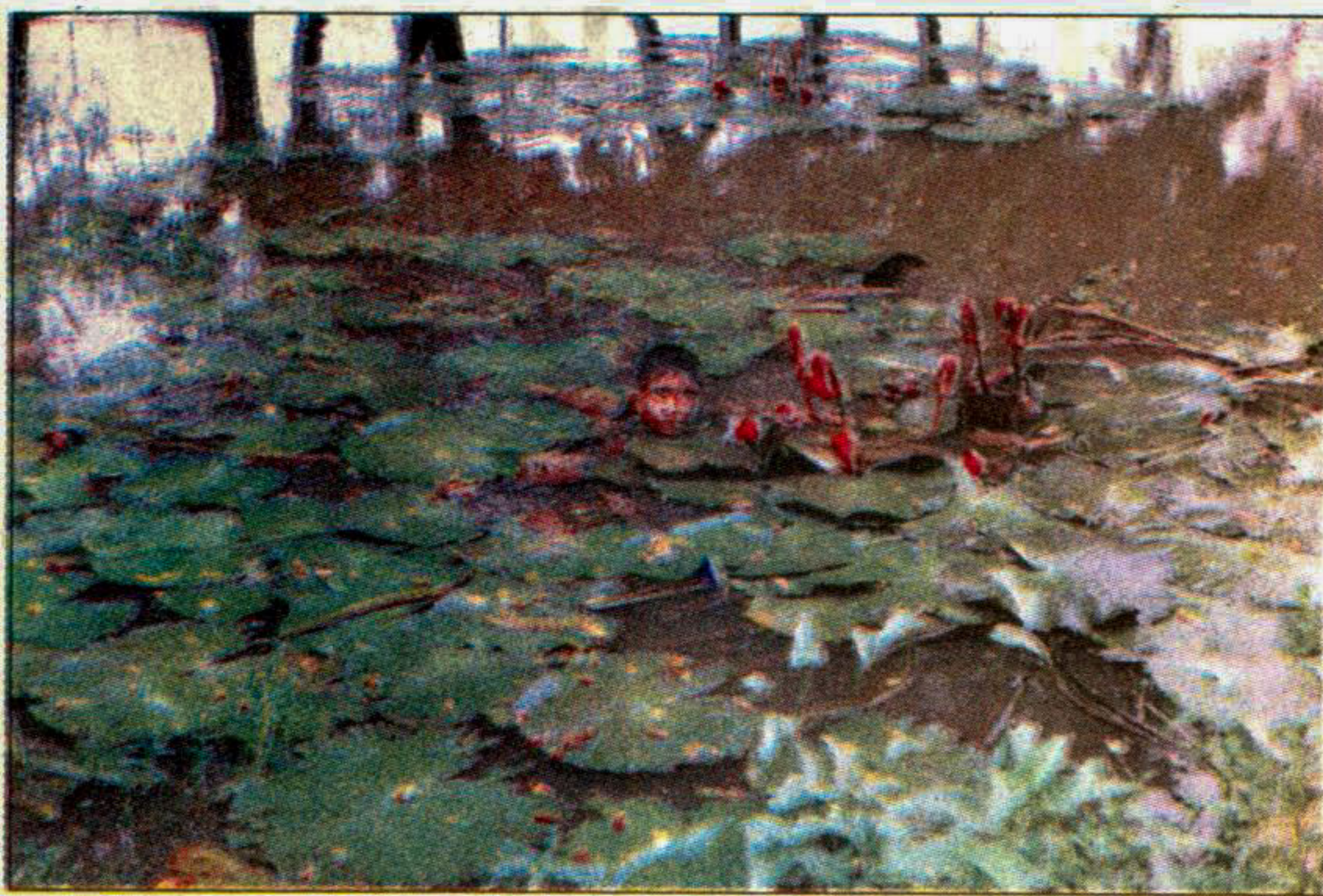
Beauty of Sharat: A boy of village Royera in Sailkupa thana of Jhenidah district collecting red Shapla from a pond near his house.

According to an official source, the house building grant will be given to those poor men who were badly affected by last year's flood in the three upazilas. Each flood victim will get Taka 500. The disbursement of grant will begin soon.