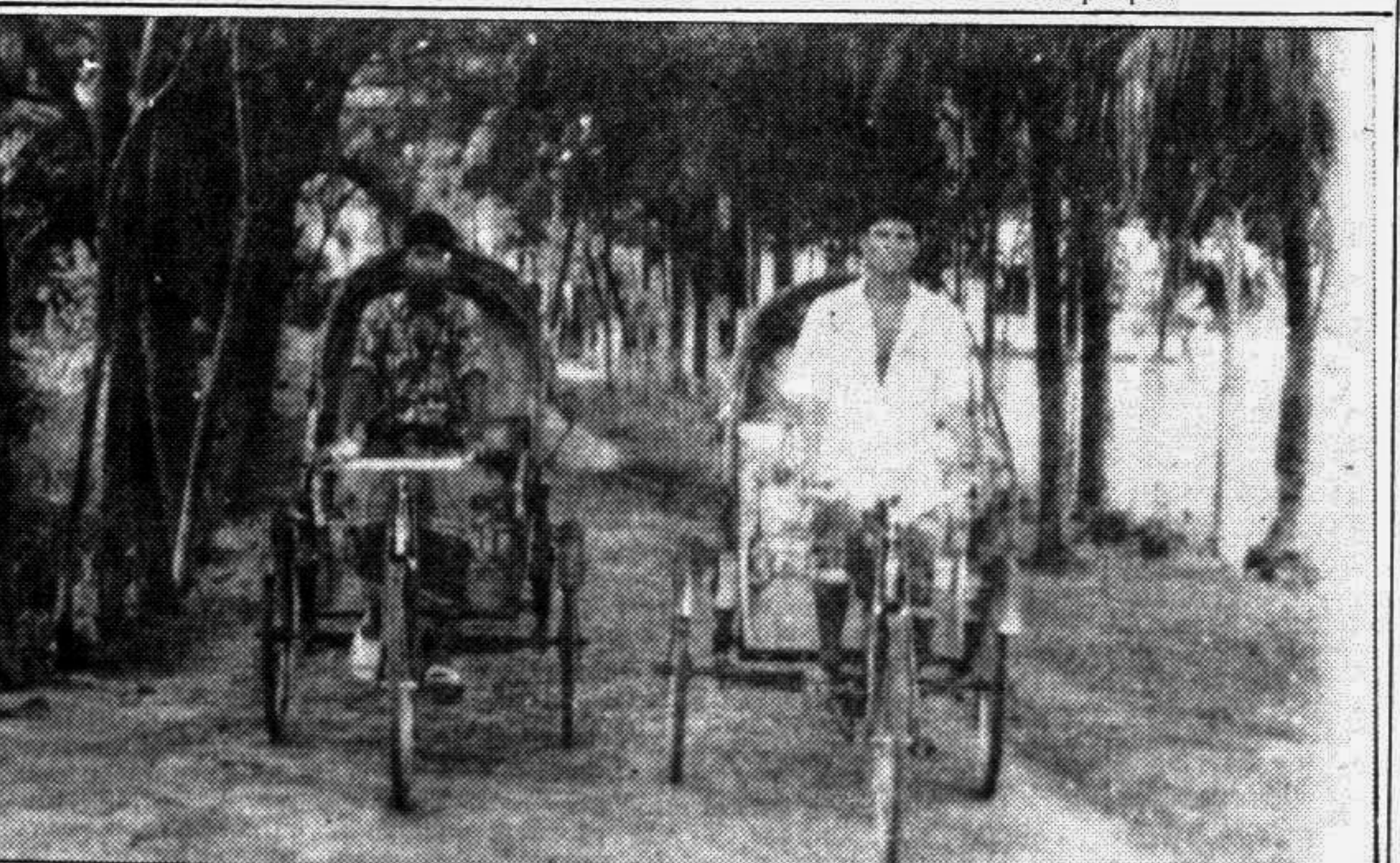
A portion of Jamalpur-Dhaka highway near Titpallah bus stand which was affected badly by last year's flood is yet to be repaired. Vehicles are plying with great risk through this point.

Patrol police said they challenged a gang of eight people in the area and arrested four of them. Four others managed to flee.