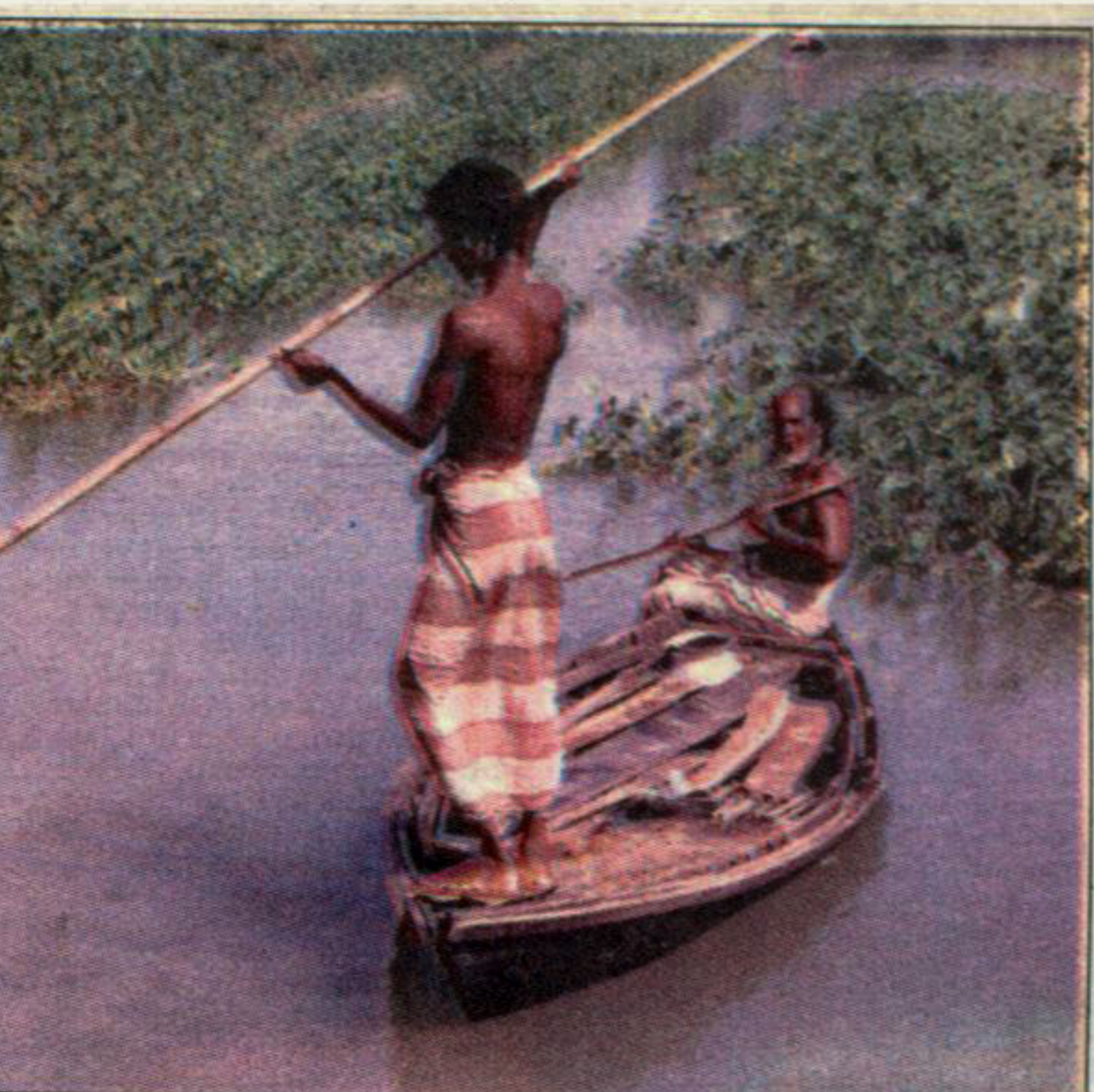
Fishing time: A rural youth on board a country boat fishing with a multi-headed spear while his father, a boatman collecting his catch in a pot. This photo was taken recently from Munshiganj district.