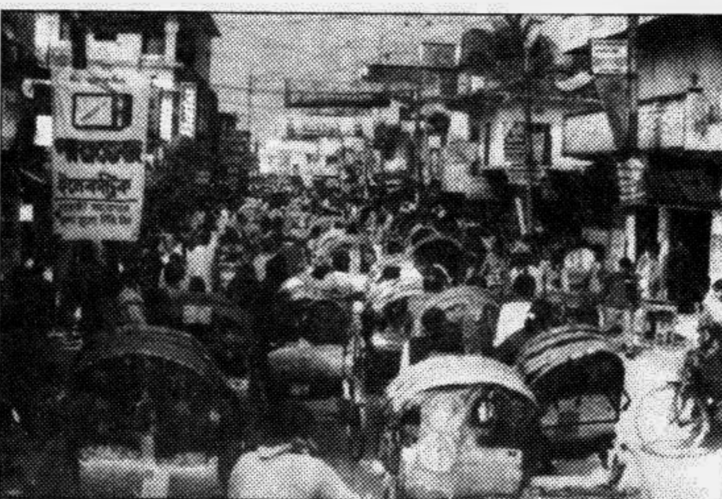
Scores of rickshaws creating jam on the main street of Jamalpur town. Such scene is a regular phenomenon here.

Vehicles often carry passengers and goods on roofs of passenger vehicles. Many mechanically defective vehicles emit black smoke. About 15 thousand rickshaws ply here. But only six thousands have licences.