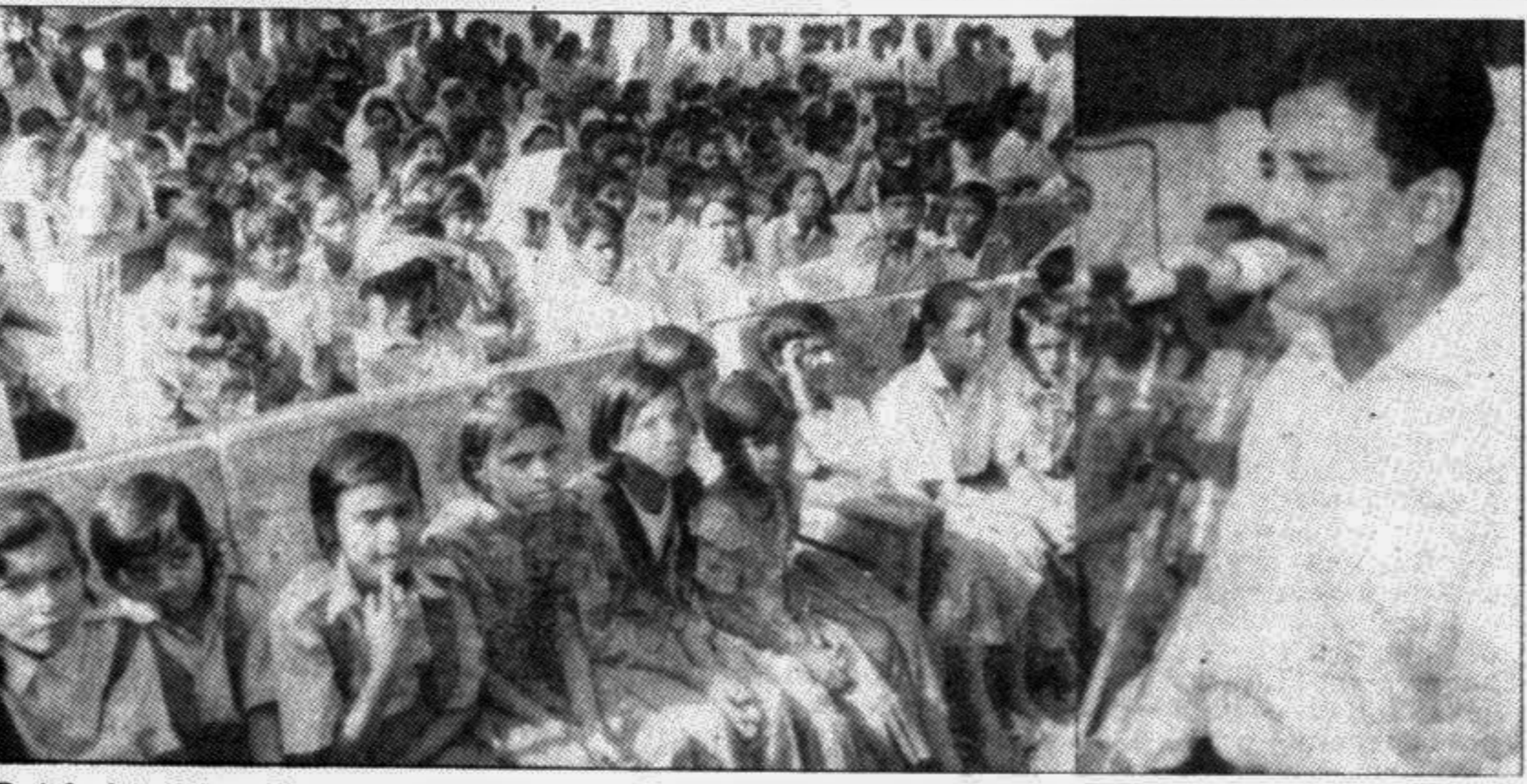
Rajshahi City Corporation Mayor Mijanur Rahman Minu addressing the inaugural function of Child Rights Week on Friday in the corporation premises. A Meena Fair was also organised on the occasion.