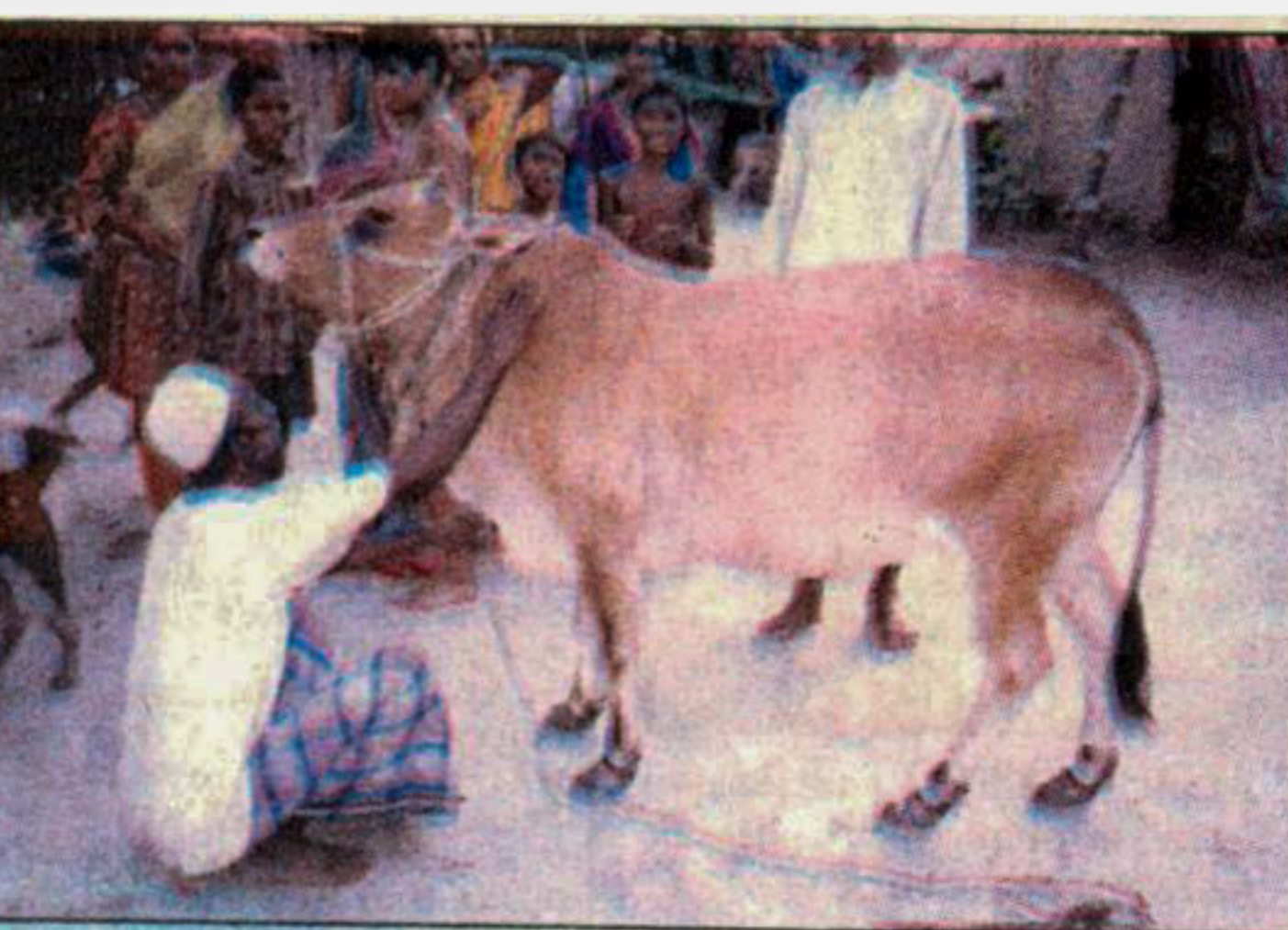
Kamdhenu: The cow in the picture gives 3 litres of milk every day without giving birth to any calf. Owner of the cow Kamrul Islam of village Majgram in Magura sadar thana patting her in front of curious visitors.

NAOGAON, Oct 5: An onion-laden truck seized on Sept 28 went missing mysteriously from Sadar thana, reports UNB.