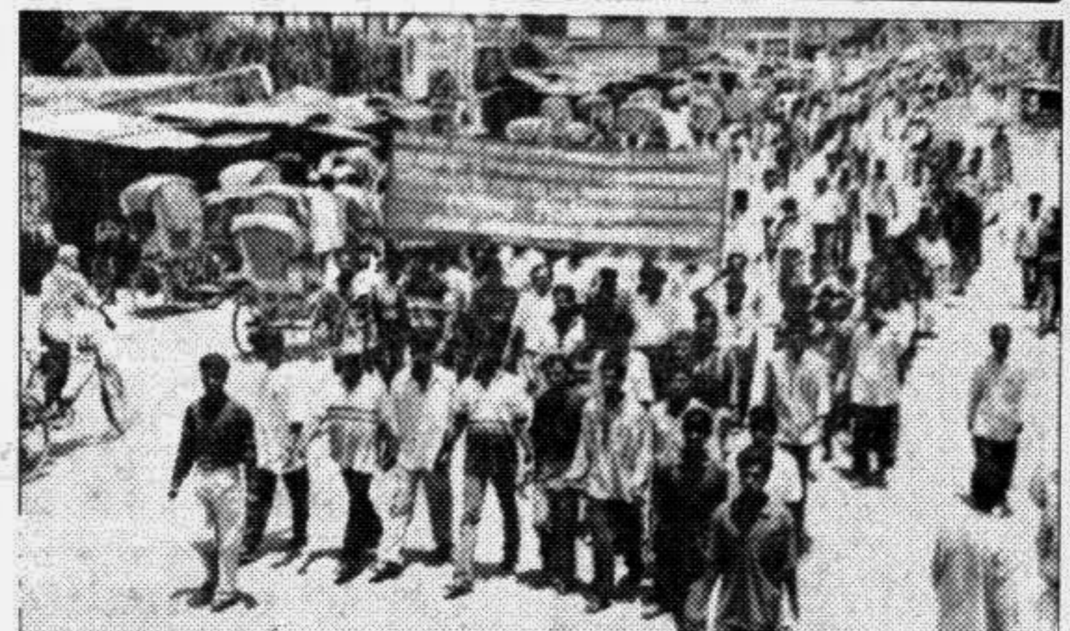
A silent procession was brought out in Pabna town by the students of Pabna Polytechnic Institute recently. The processionists were demanding immediate implementation of their 10-point demands.