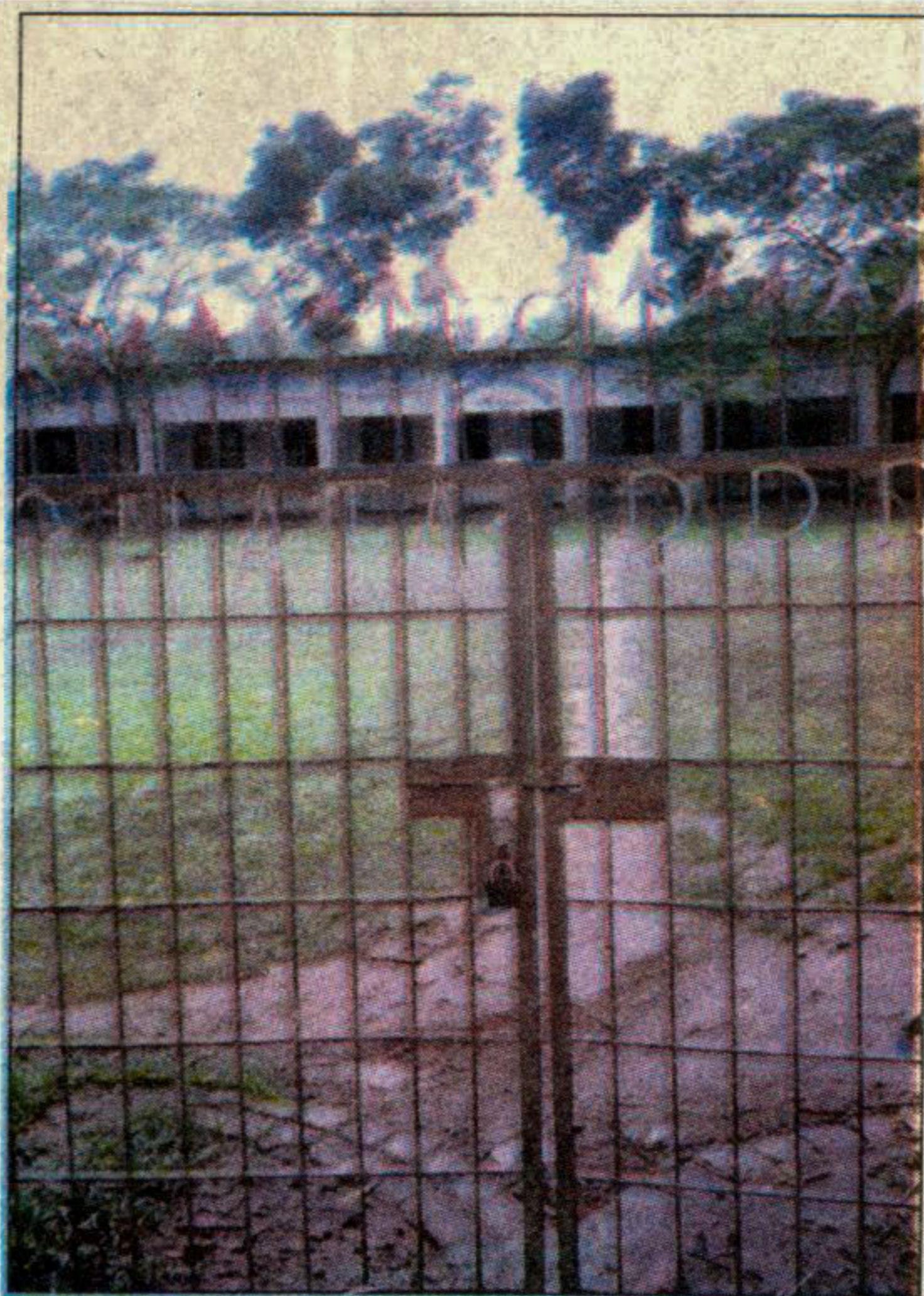
The main entrance of Rani Patil Pabon High School under lock and key.

MAGURA, Oct 5: A high school in Mohammadpur thana have remained closed for about a month following dissent over appointment of a new headmaster.