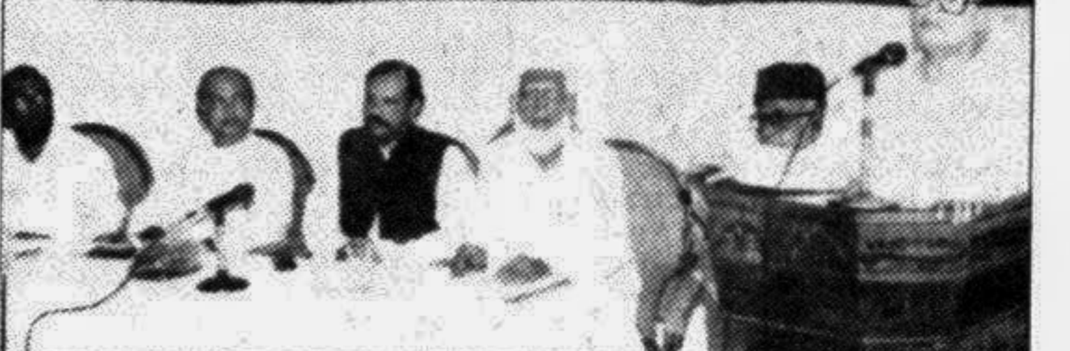
Deputy Commissioner of Sylhet Ali Imam Majumder speaking recently at a meeting held in observance of the Elderly People's Day in Sylhet.