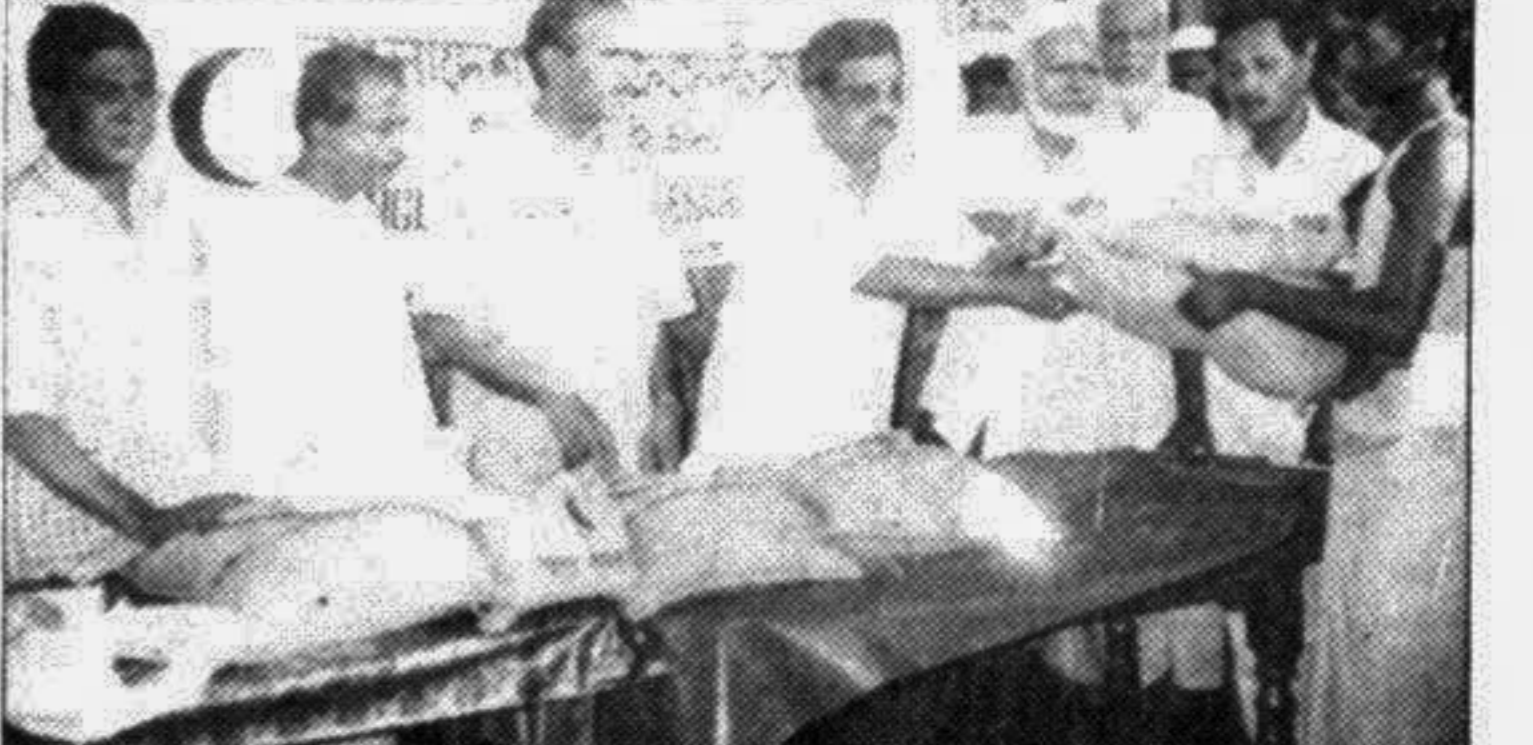
Chandpur unit of Red Crescent Society distributing relief materials among the fire affected people of village Ramdasi in the Sadar thana.