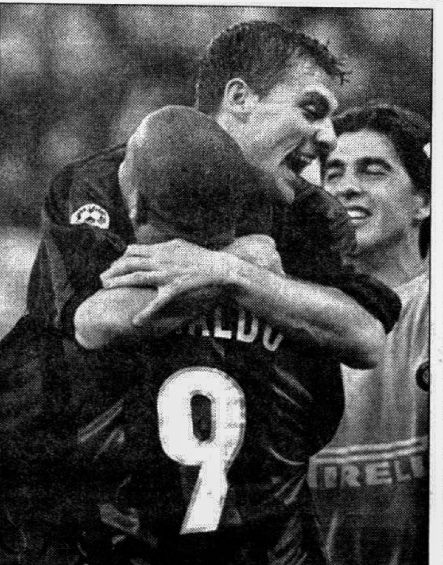
Inter Milan striker Christian Vieri congratulates partner Ronaldo (No 9) after the Brazilian grabbed the winner against Piacenza on October 2.

And the Brazilian responded by promising: "Let's say it now. Ronaldo is ready to be the real Ronaldo for the derby."