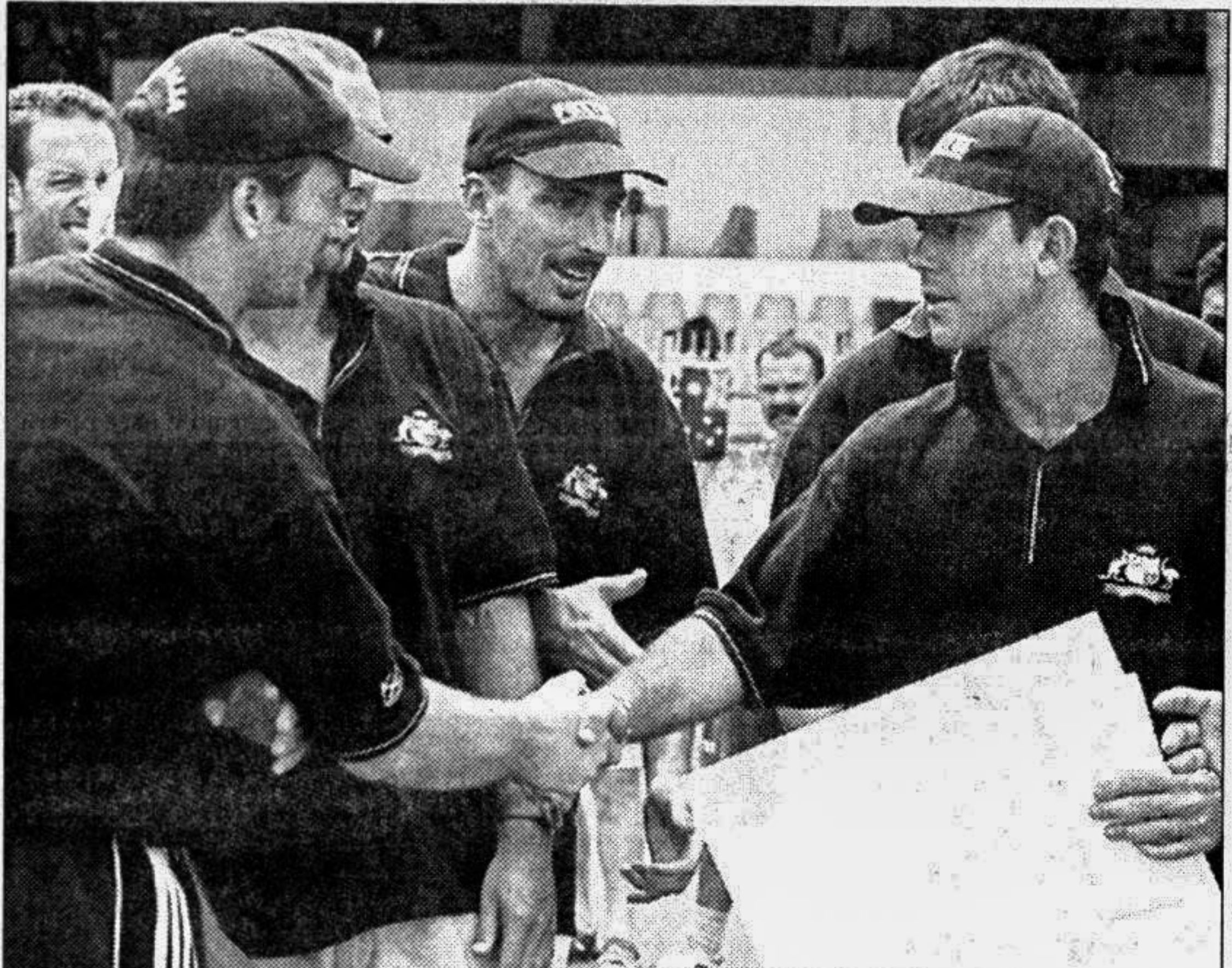
Australian captain Steve Waugh (L) shakes Ricky Ponting's hand after the latter was named both man-of-the-match and series yesterday.

Ricky Ponting won the man-of-the-match award for his un-beaten century and he also took the man-of-the-series award.