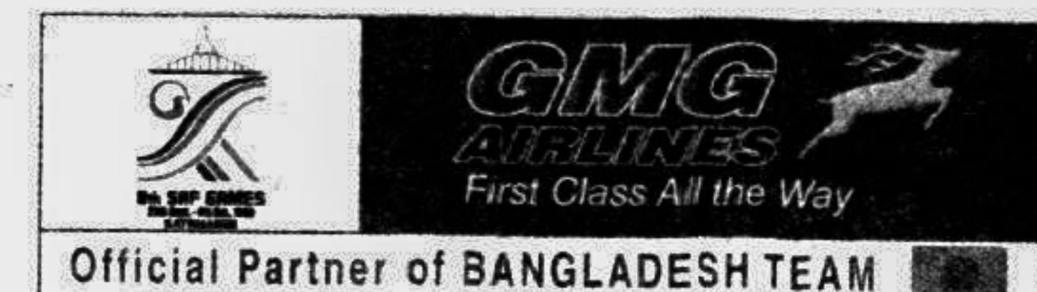
Official Partner of BANGLADESH TEAM