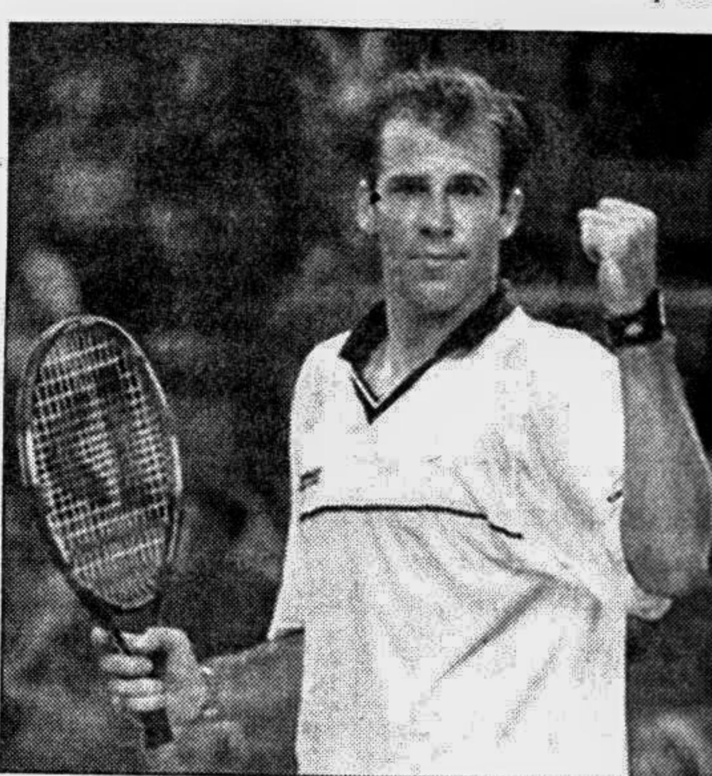
Briton Greg Rusedski pumps his fist after beating Andrei Medvedev of Ukraine in the Grand Slam Cup semifinals on October 2.