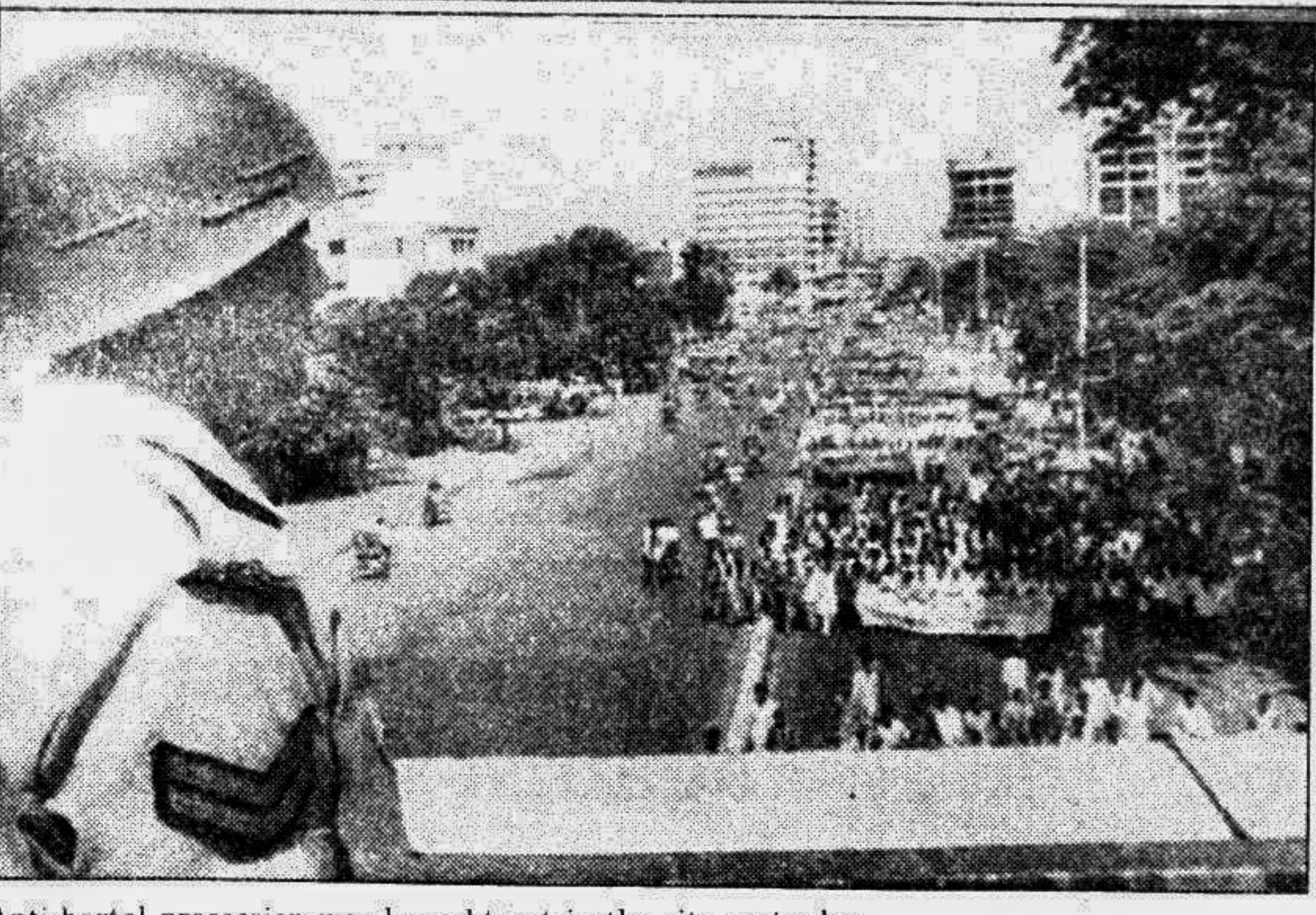
Anti-hartal procession was brought out in the city yesterday.