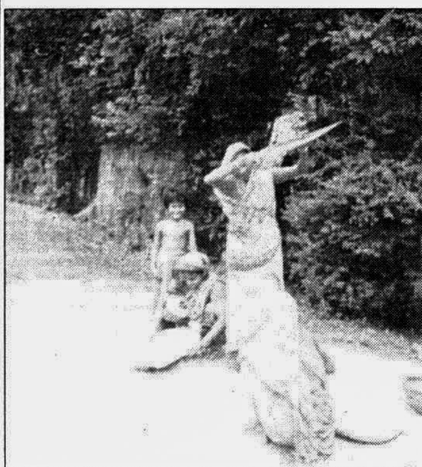
A typical scene of a rural home where housewives seen winnowing Aus paddy following their thrashing. The picture was taken recently from village Balidia in Mohammadpur thana of Magura district.