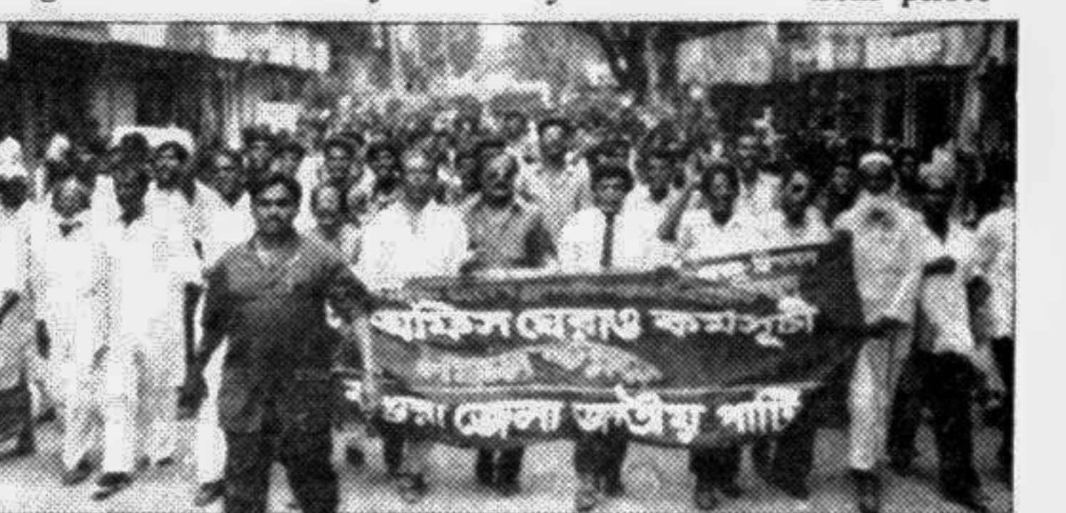
Jatiyo Party brought out a procession in Magura town recently as part of their out-government movement.