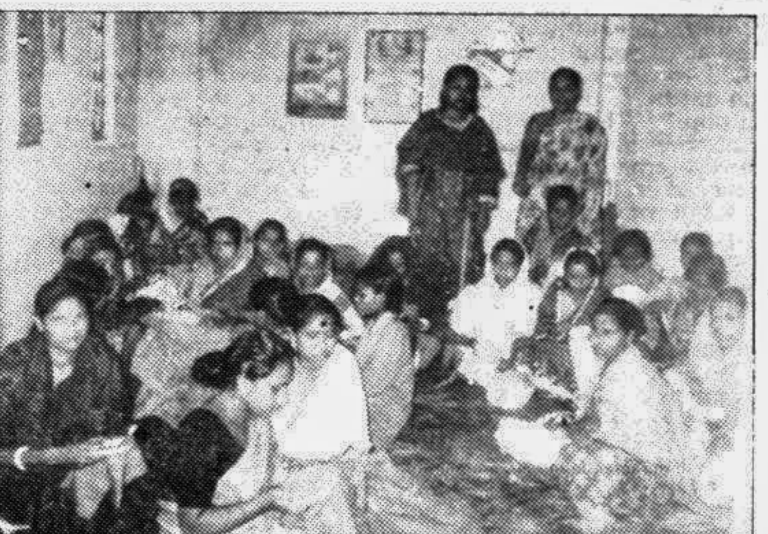
Women Affairs Department conducting a training course for the distressed women recently with a view to making them self-reliant in Netrakona town.