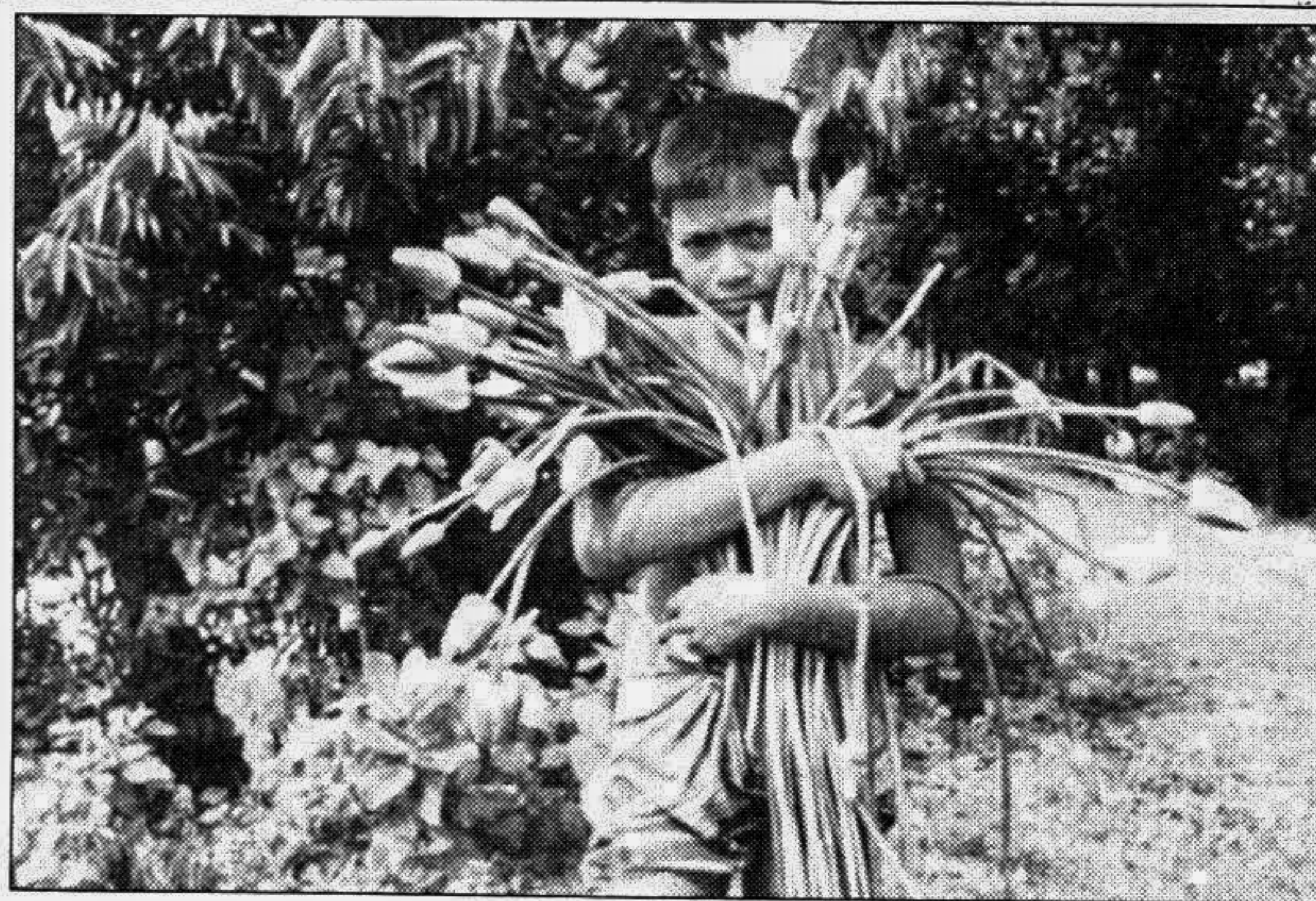
Happy days: A lively rural boy holding Shapla plants out of fun. He collected the plants from nearby ponds or other waterbodies. Poor rural people use the plants as their regular food item in the rainy season as these are now available widely everywhere. This picture was taken recently from village Gobindapur in Jhenidah.