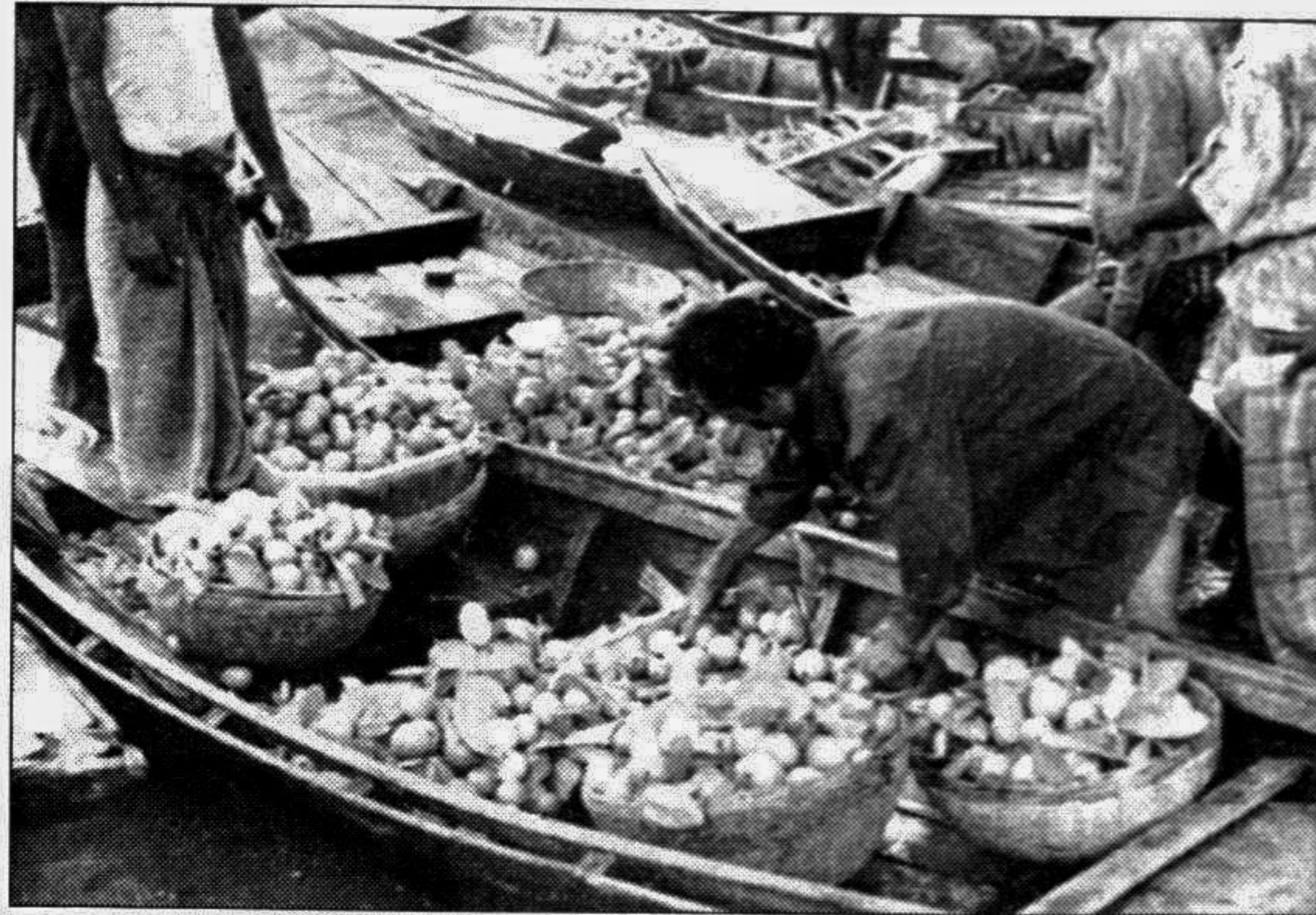
Common people's apple: Suppliers at Swarupkathi ghat carrying guavas through local country boats for marketing to various places.