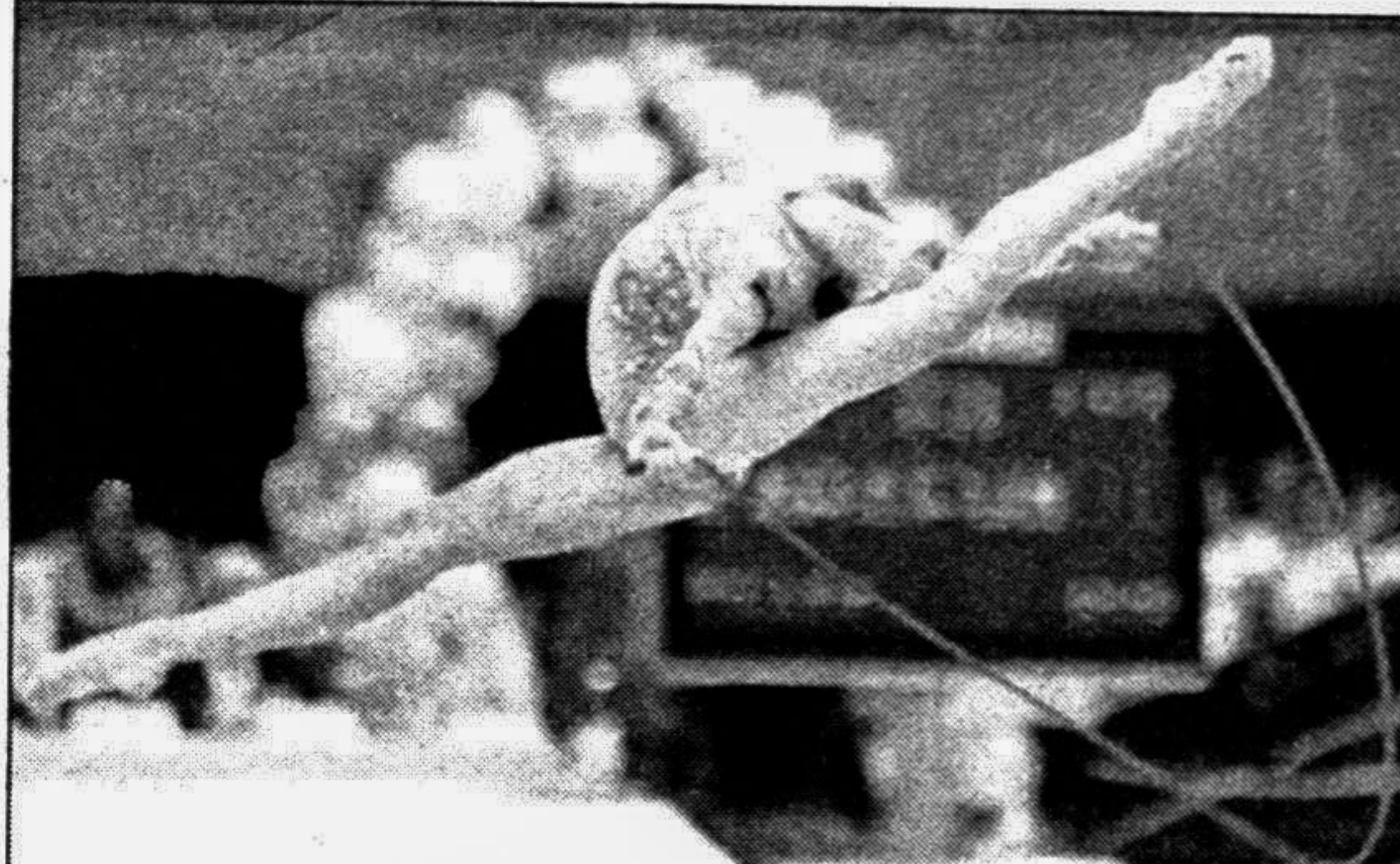
Russian Alina Kabaeva performing in the individual all-around event of the World Rhythmic Gymnastics Championships in Osaka, Japan yesterday. Alina won gold.

He said he was "100 per cent hopeful" that Rafter's shoulder would stand up to the strain of playing Davis Cup.