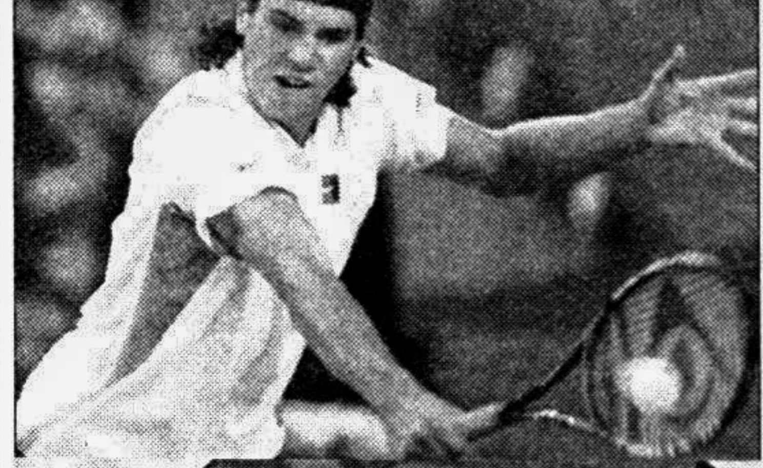
German Tommy Haas in action against Andre Agassi.

In the tiebreaker, the American dominated, squaring the match at a set each with a return winner on the first of four set points.