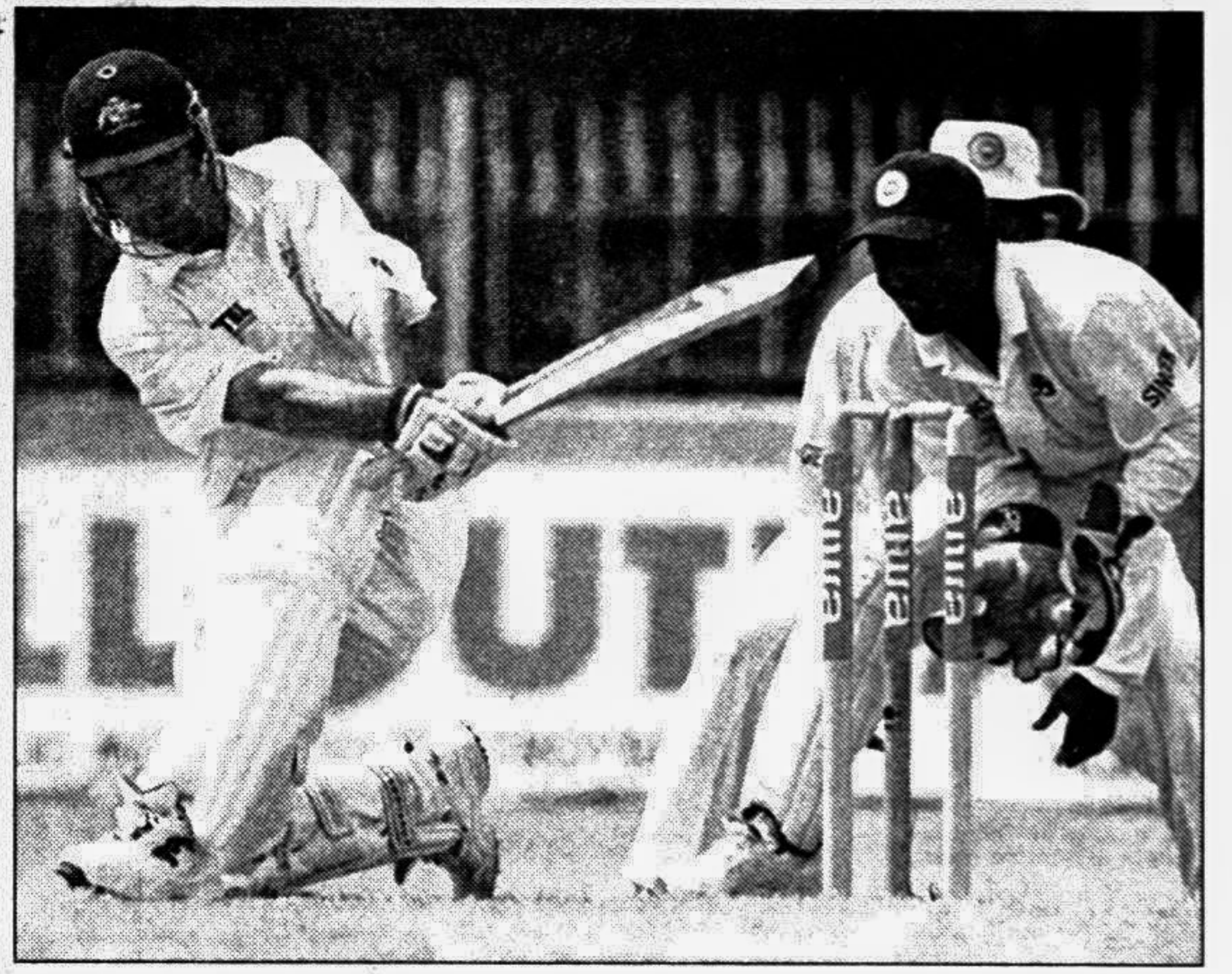
Australian batsman Ricky Ponting sweeping on the Day Two in Colombo yesterday.