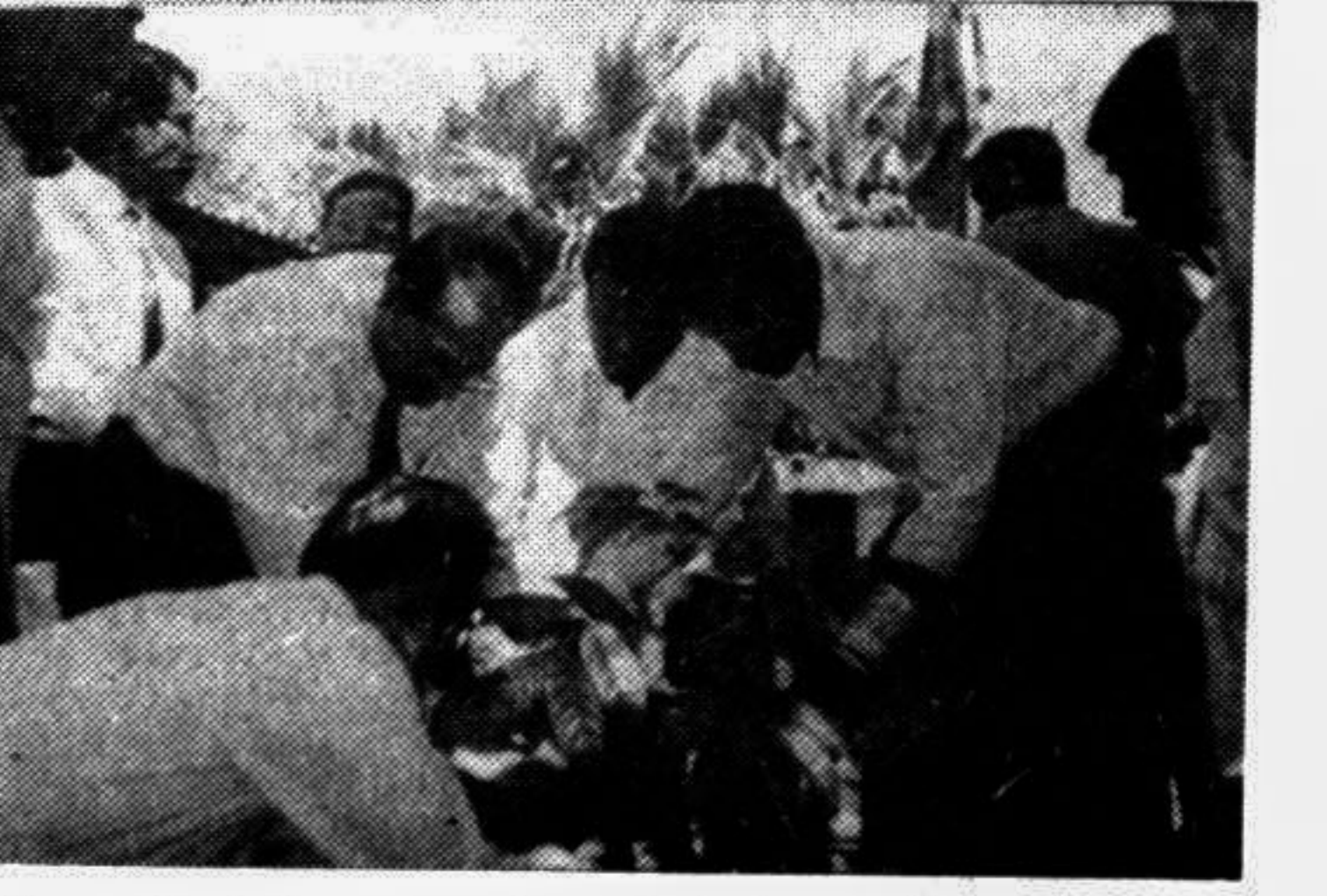
A tree plantation campaign started recently at Tangail Rotary Polli School in Tangail.