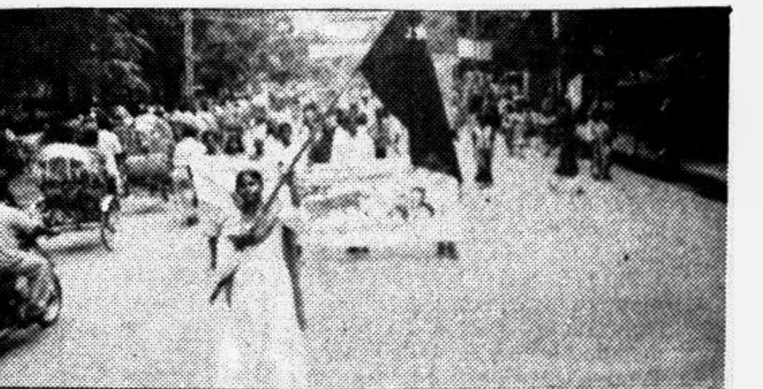
A colourful rally of Samajtantric Chhatra Front paraded the streets of Rangpur town following its conference recently in the old press club premises.