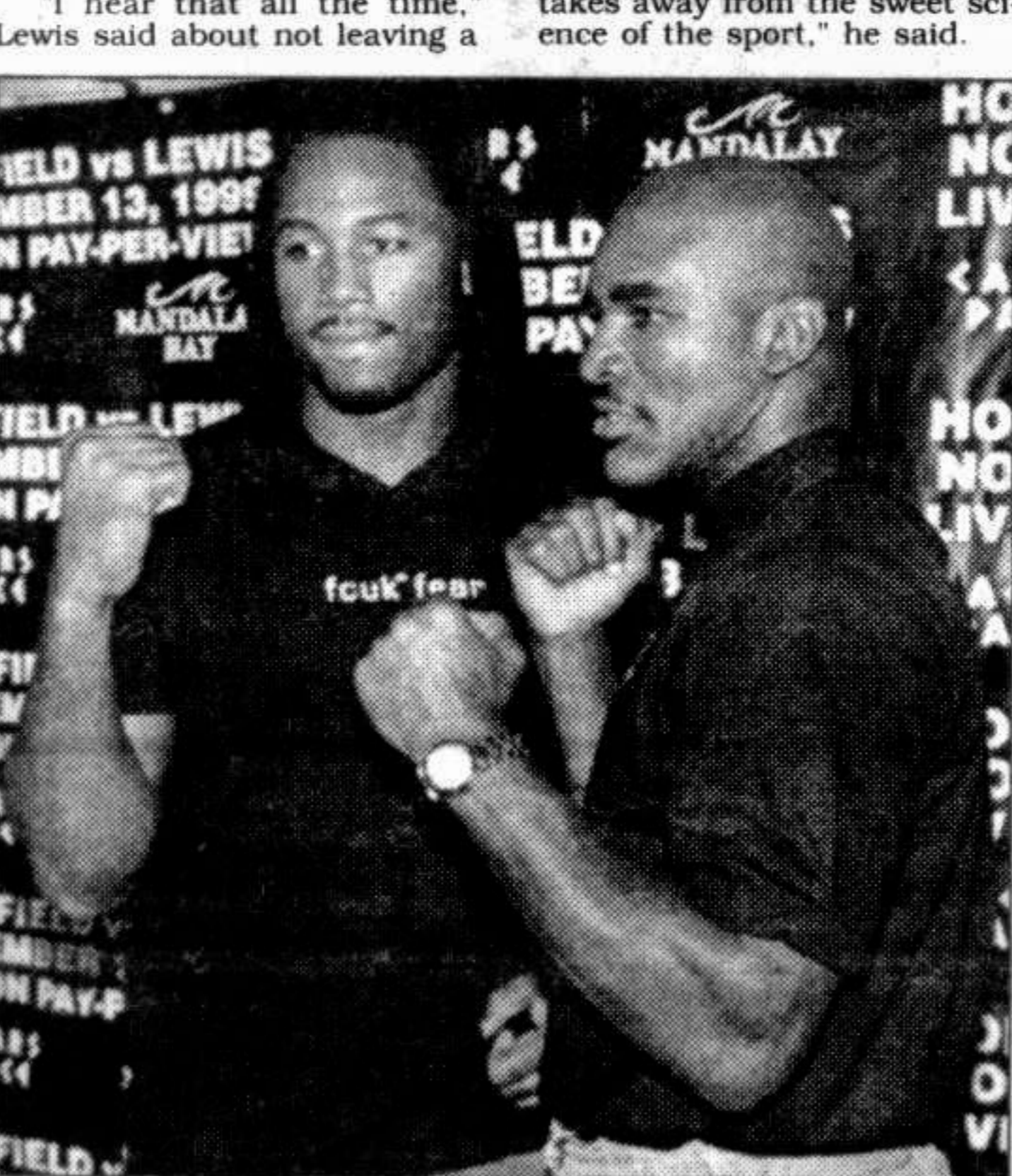
Britain Lennox Lewis (L) and Evander Holyfield of the United States during a press conference in New York on September 29.

NEW YORK, Sept 30. Lennox Lewis says he's sure he won the last time he fought, but will leave nothing to chance in next month's rematch with Evander Holyfield, reports Reuters. "I was this close to getting all three belts," Lewis said Wednesday, holding the index finger and thumb of his big right hand about an inch apart. "In the second fight I'm going to go for the gusto." Lewis and Holyfield, whose controversial draw last March at Madison Square Garden led to hearings, probes and a series of reforms by the New York State Athletic Commission, meet again November 13 in hopes of finally crowning an undisputed heavyweight champion of the world. "It's time for Evander to retire," said Lewis. "This next fight is going to bring Evander into retirement, believe me." Using a powerful jab, the British holder of the World Boxing Council crown seemed to outbox World Boxing Association and International Boxing Federation champion Holyfield, but the judges ruled the 12-round bout a draw. Holyfield and Lewis waged a strange point-counterpoint debate Wednesday on the art and science of boxing as they took turns sitting in at a luncheon roundtable talk in separate sessions to promote their Las Vegas clash. Lewis said he had grown "ir-