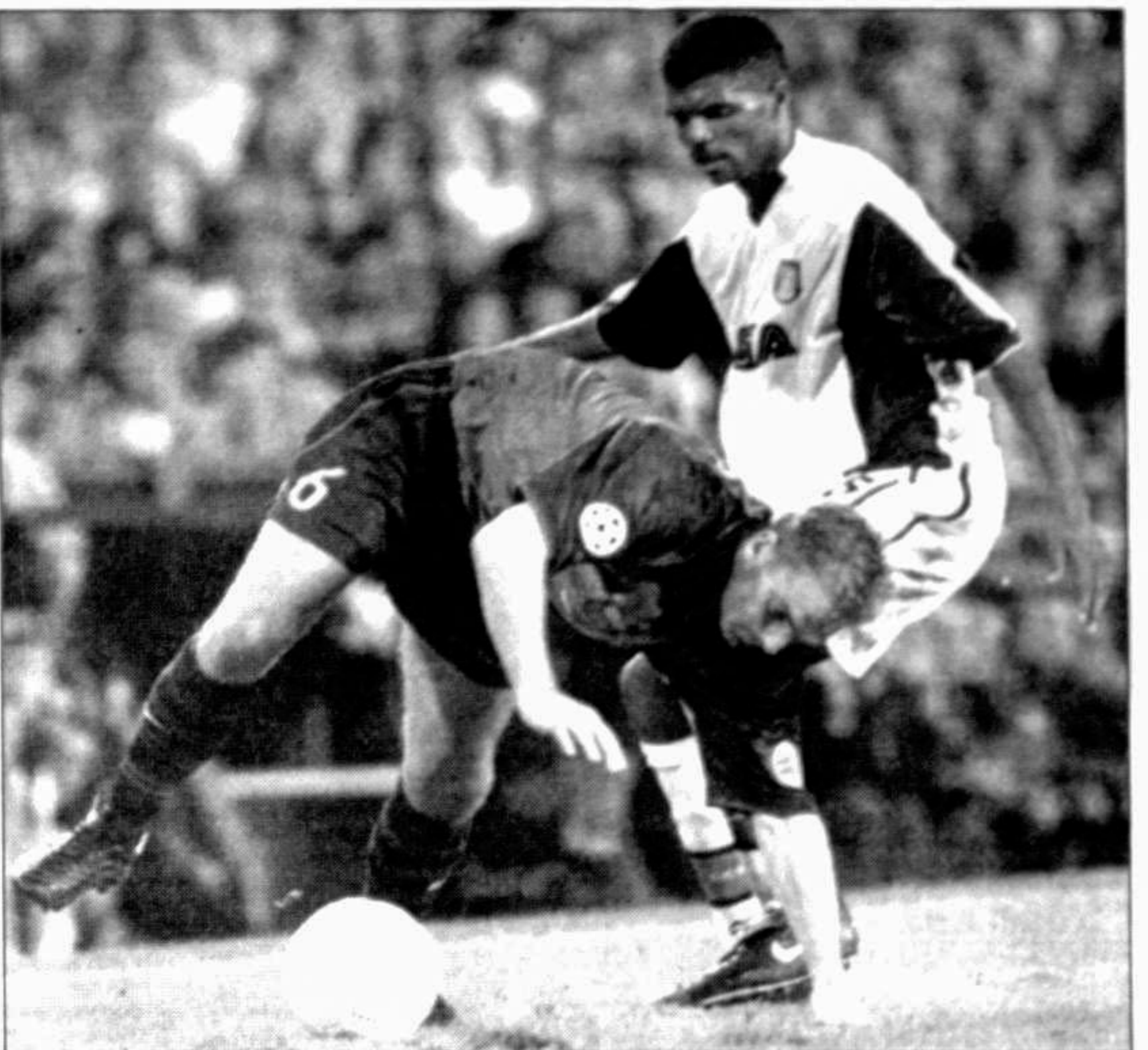
The physical presence of Arsenal's Kanu (R) proves too much for Barcelona's Ronald de Boer during their Champions' League match on September 29.