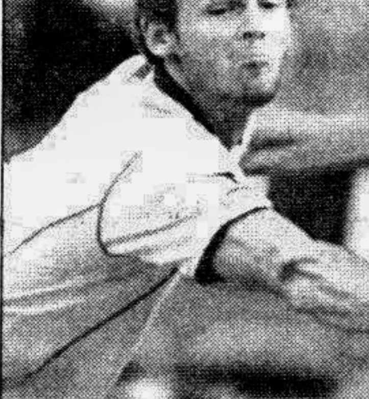
Brazilian Gustavo Kuerten stretches for a return against Greg Rusedski at the Grand Slam Cup on September 28.

It was unclear whether the recently retired Graf would attend the tournament -- for