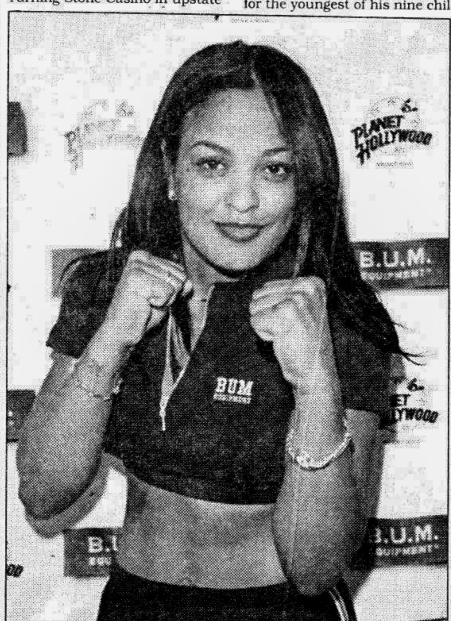
Laila Ali, the youngest daughter of Boxing legend Muhammad Ali, poses for photographers during a press conference in Beverly Hills, California on September 28.

The elder Ali painted the worst possible picture of boxing for the youngest of his nine children.