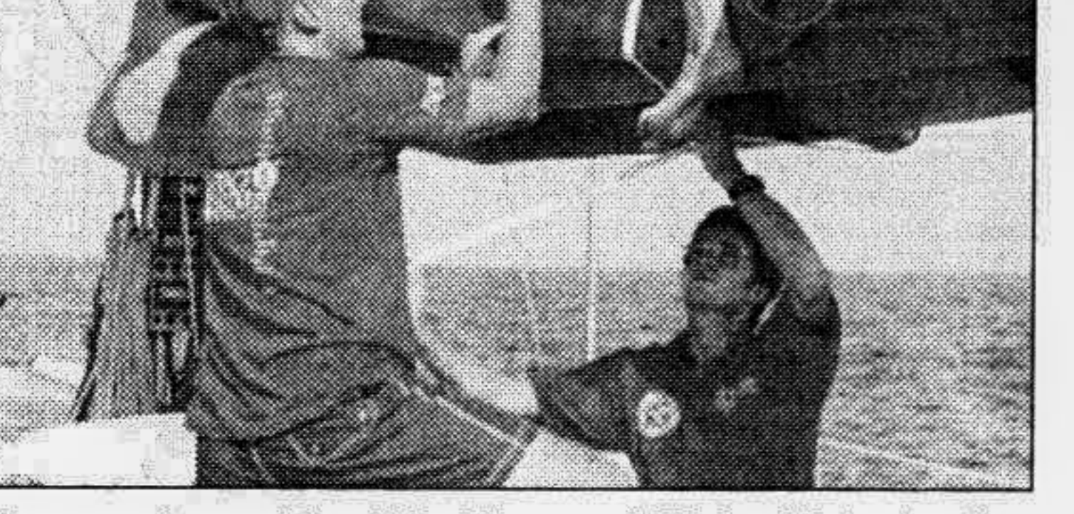
Crewmembers of the John Player Gold Leaf bringing the sail down during the course of the Voyage of Discovery.

Prime Minister Sheikh Hasina, meanwhile returned from a 13-day trip to New York and Paris on September 26.