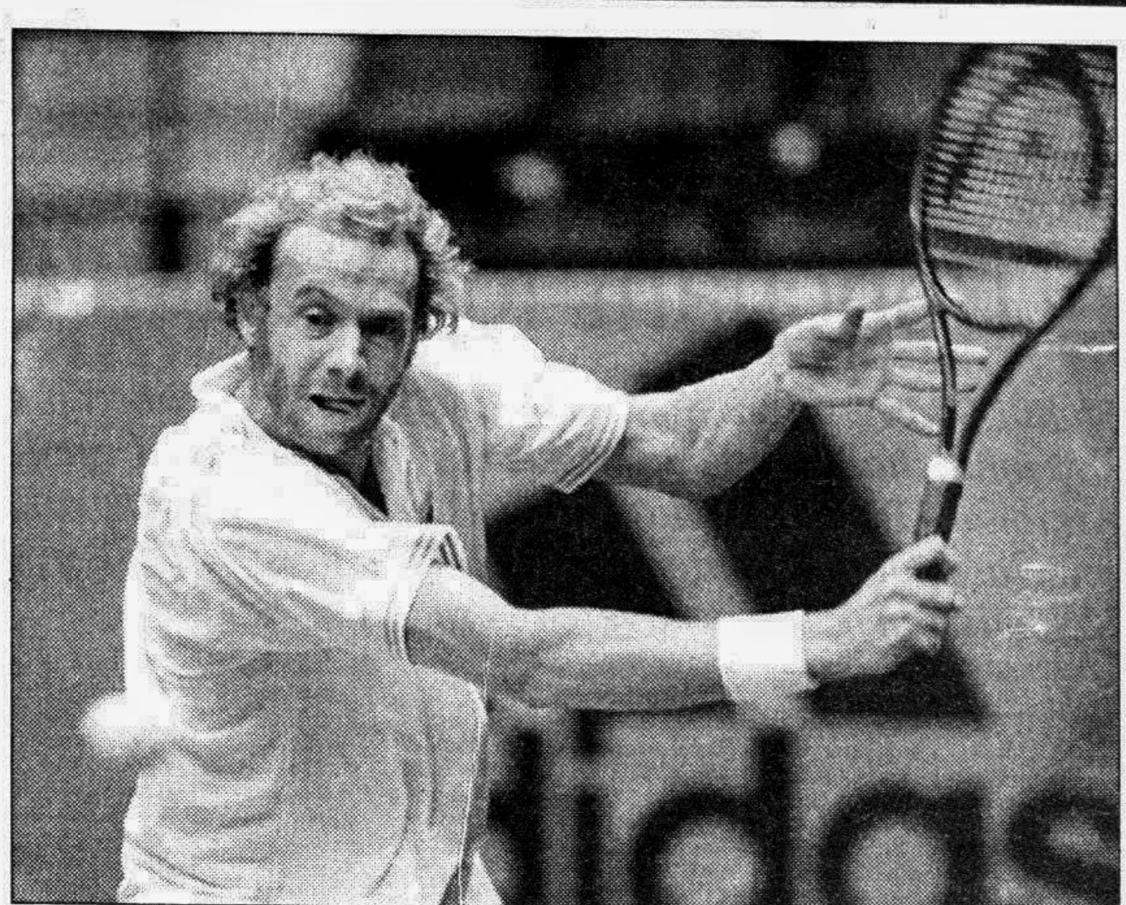
Switzerland's Marc Rosset in action at the Toulouse Open on September 27. Rosset defeated Croatian Goran Ivanisevic 6-4, 5-7, 7-6.

She will attend the New York marathon next month to receive the Bikila Award, named after the celebrated Ethiopian runner Abebe Bikila, the first African to win an Olympic title, in Rome in 1960.