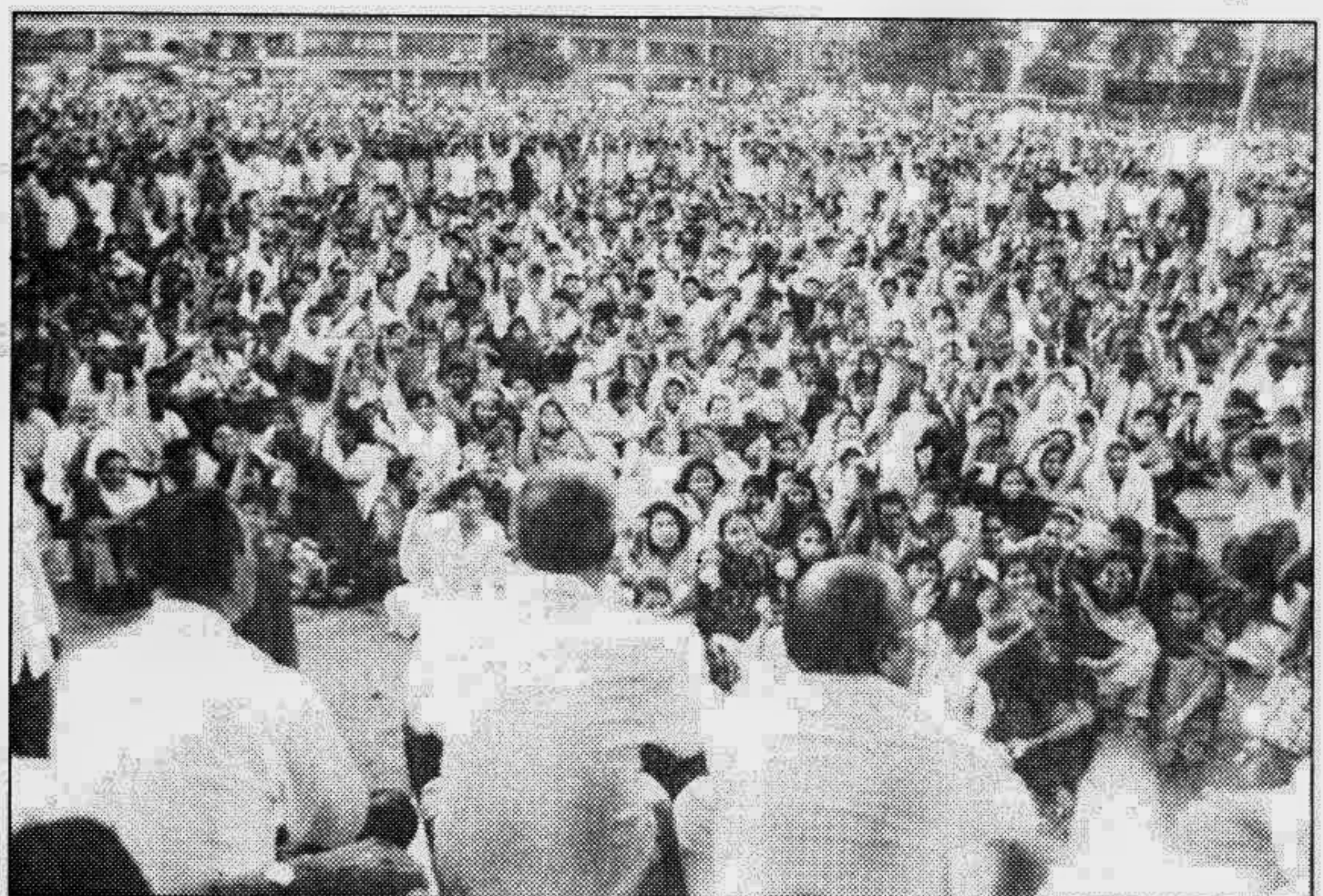
Students shouting anti-government slogans at a rally at Paltan Maidan yesterday. The rally was organised by JCD to protest the repression of the opposition activists.