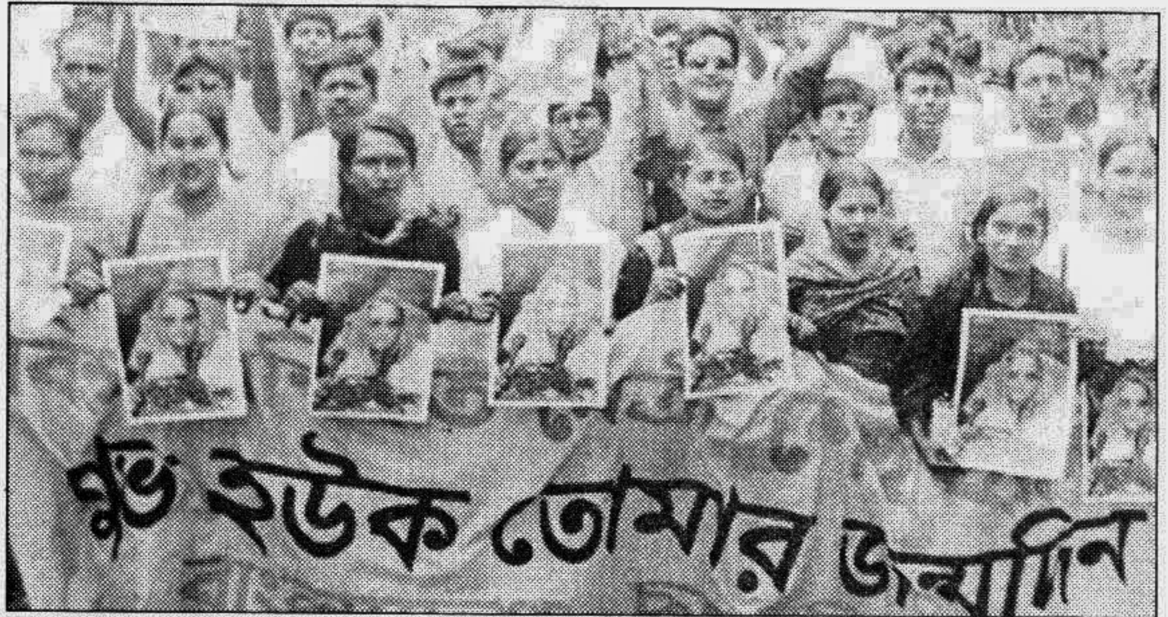
Bangladesh Chhatra League brought out a colourful procession in the city yesterday to celebrate the 53rd birthday of Prime Minister Sheikh Hasina.