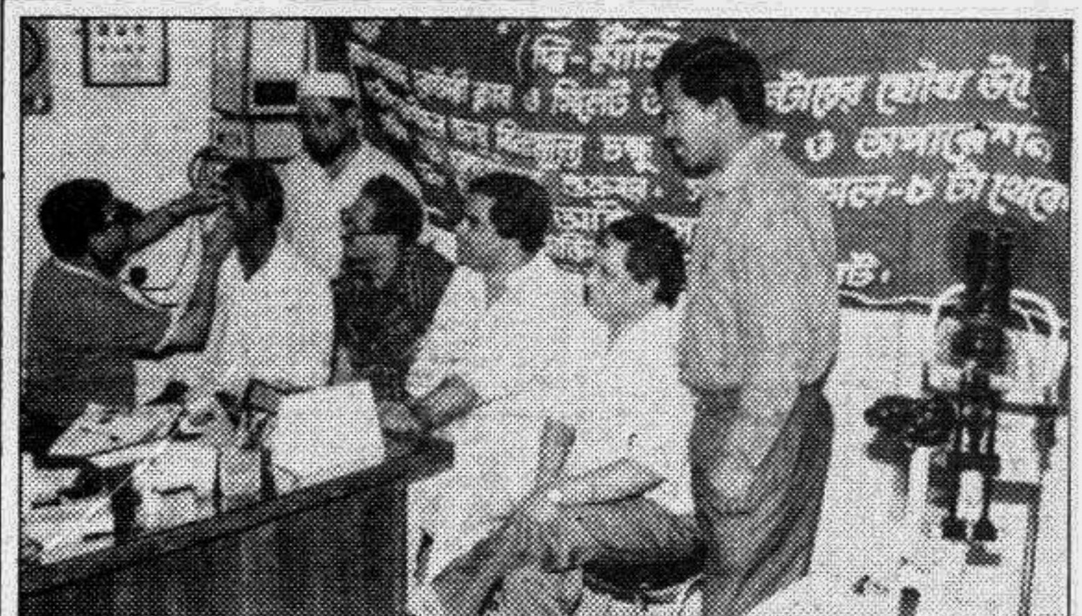
Service to humanity: Patients being treated at an eye camp arranged recently by Jallalabad Rotary Club and Sylhet Eye Centre in Sylhet.