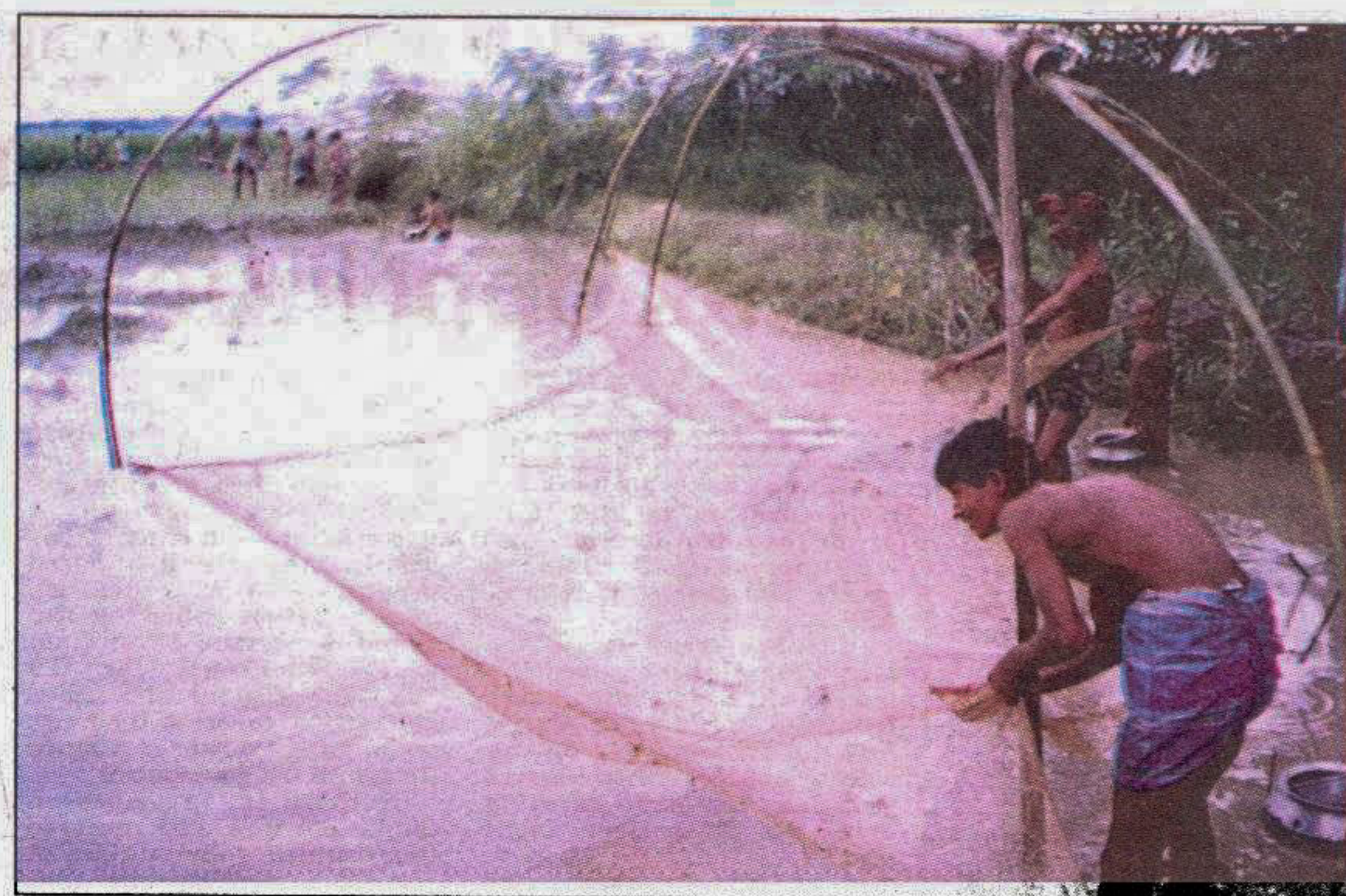
Enjoying fishing: Fishing with such nets is now a common scene in rural Bangladesh. This photo was taken recently from village Lakshimpur in Mohammadpur thana where a young man is seen fully absorbed in fishing unaware of his surroundings.