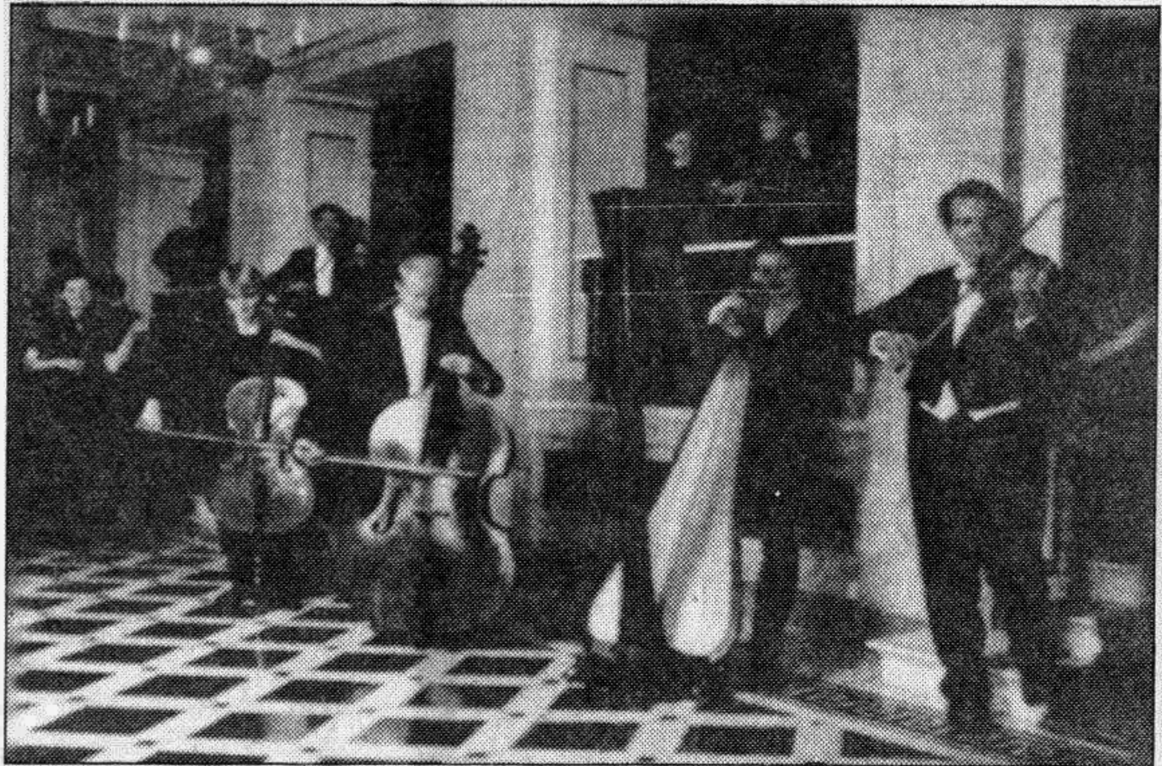
The Ensemble Oriol Berlin troupe

The classical mood created at the Osmani is sure to long last in the city dwellers collective memory.