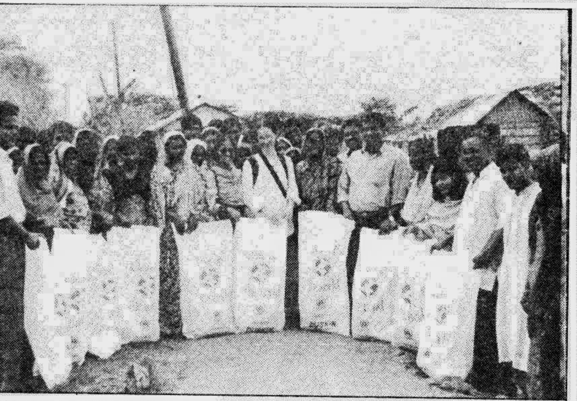
Riverbank cleaning programme: Environment and Social Development organisation, a non-governmental organisation, observed the Clean Up the World Day on Friday in Munshiganj through a colourful programme. This was followed by the riverbank cleaning activities. About 2,500 people alongwith the local ward commissioners, elite and villagers took part in the programme. Juliet Fox, Media Representative of Friends of the Earth, Australia was present as the chief guest on the occasion.