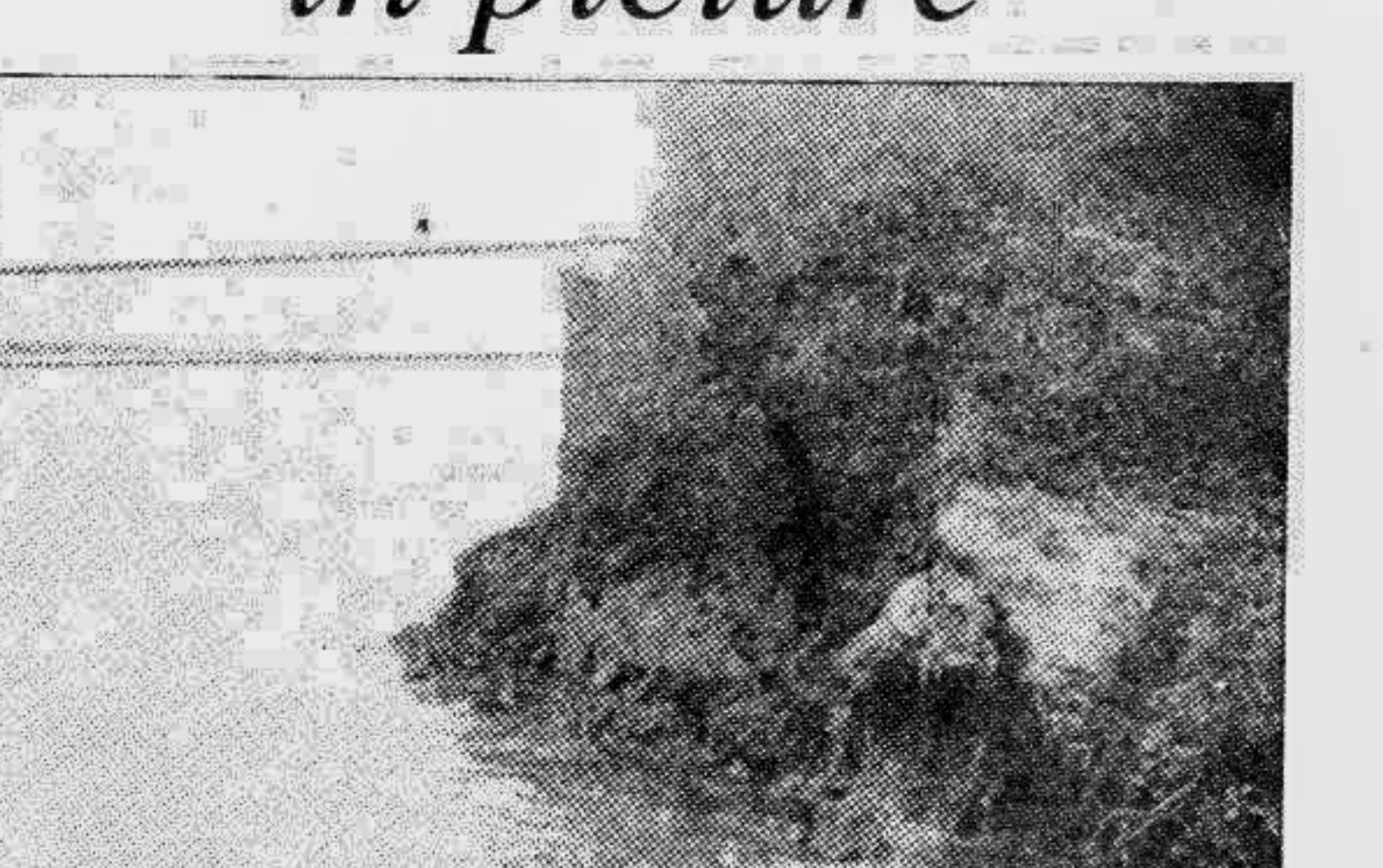
The River Gur has been devouring continuously village Kalinagar in Shingra thana of Natore district.