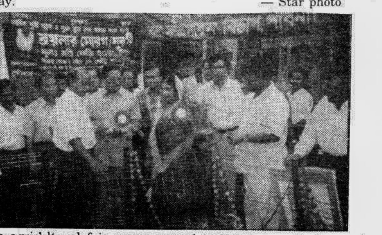
An agricultural fair was arranged in Pabna recently by the Forest Extension Department.