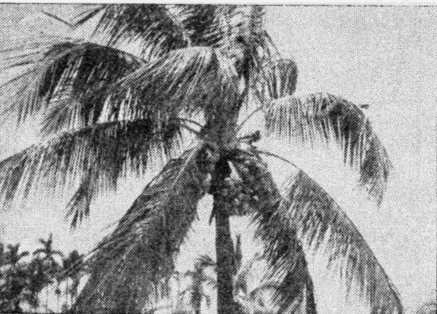
JAMALPUR: A tree full of green coconut at village Kutamoni in sadar thana which is famous for coconut.