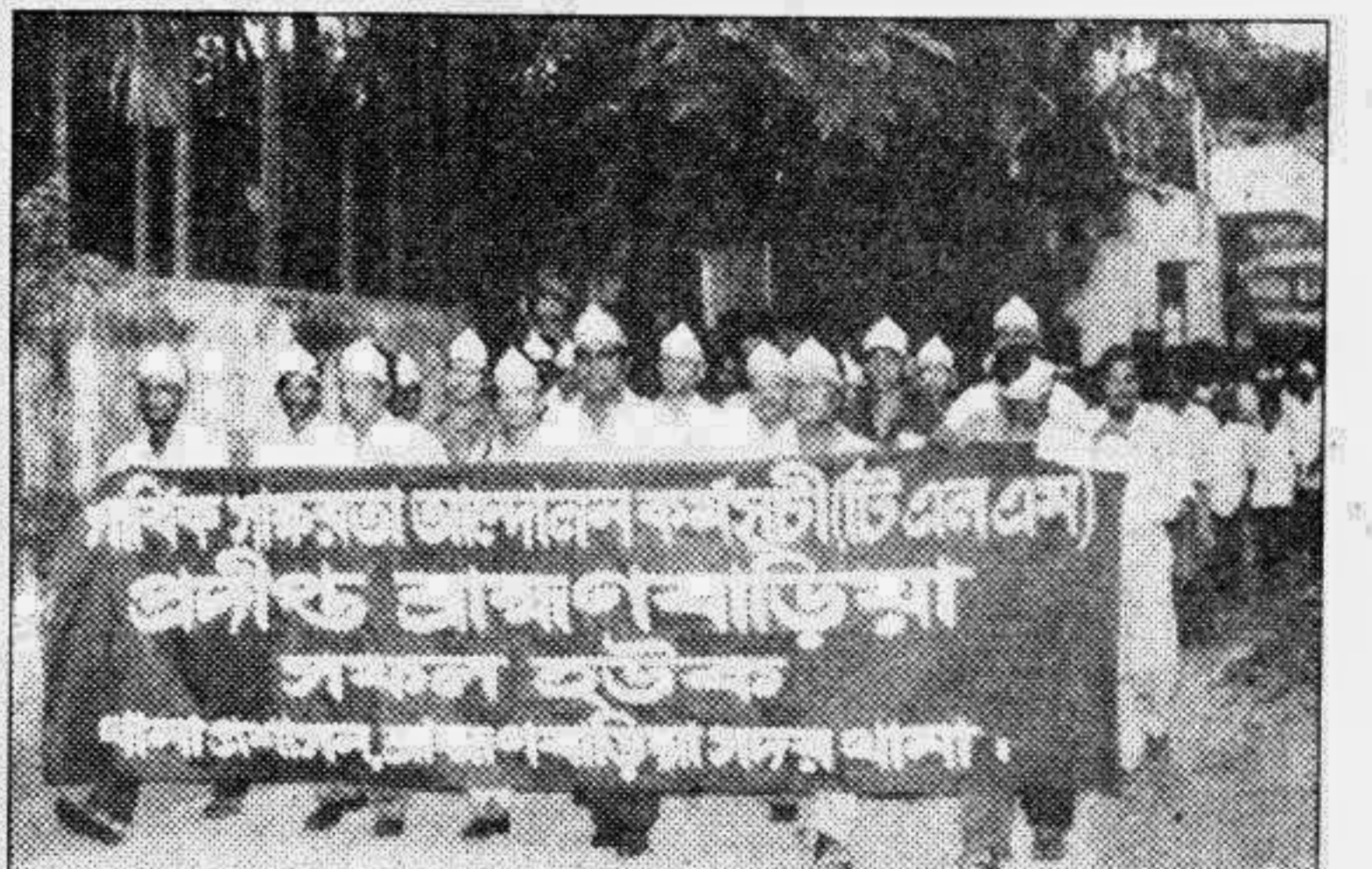
A colourful procession was brought out in Brahmanbaria town recently on the occasion of inauguration of a mass literacy programme.