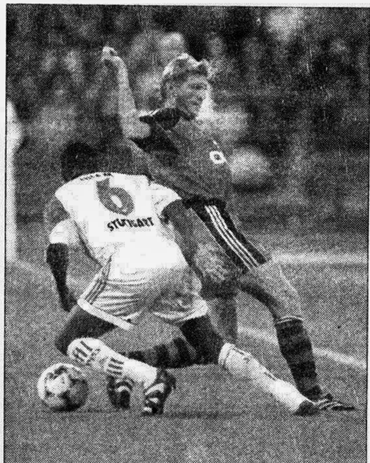
Stuttgart's Pablo Thiam (L) goes past Bayern Munich's Steffen Effenberg.