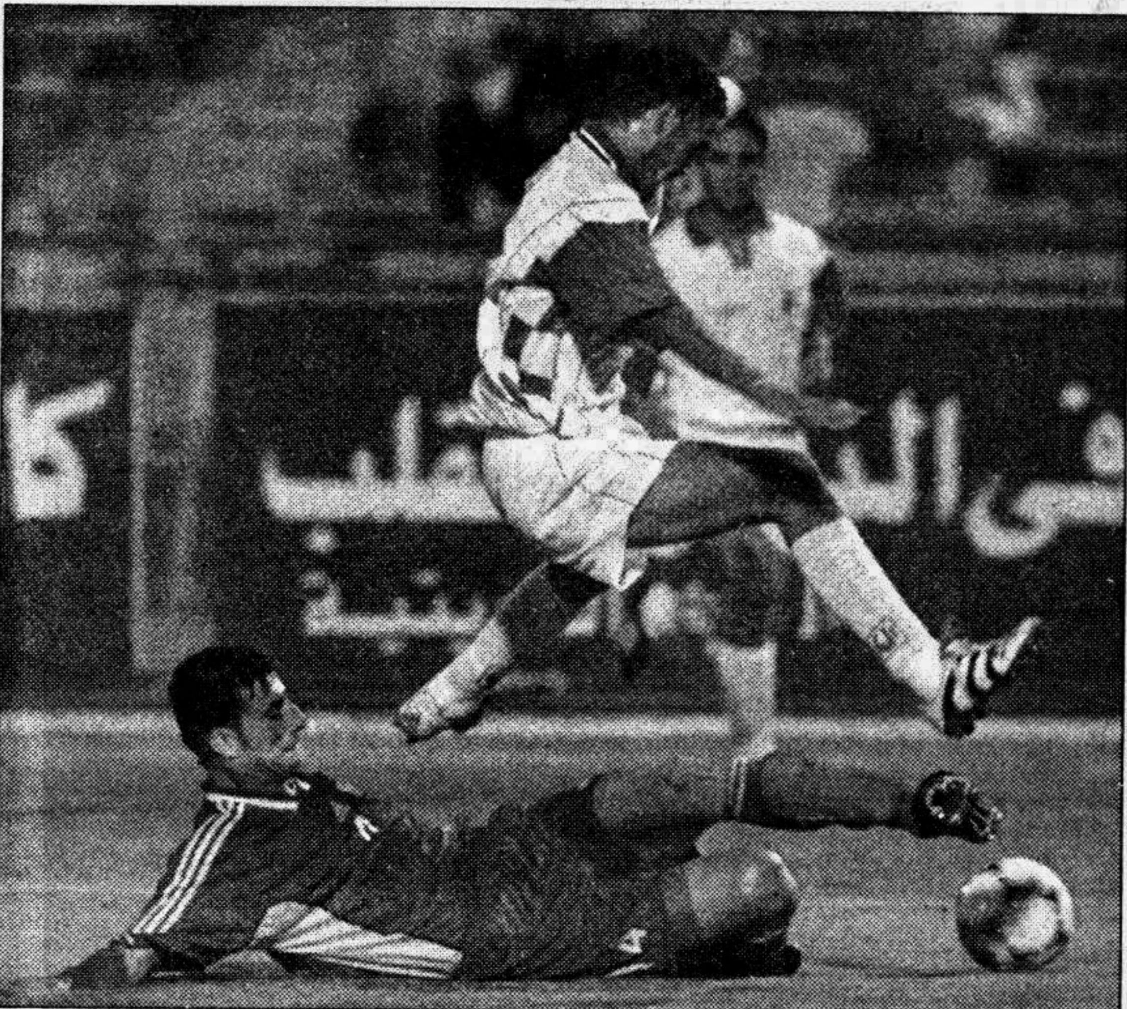
Action from Arab Club Championship match between Olympic Baji and the Syrian Army in Cairo on September 24.

Second-placed Celtic, three points behind Rangers, visit Hibernian who find themselves second bottom after a poor run.