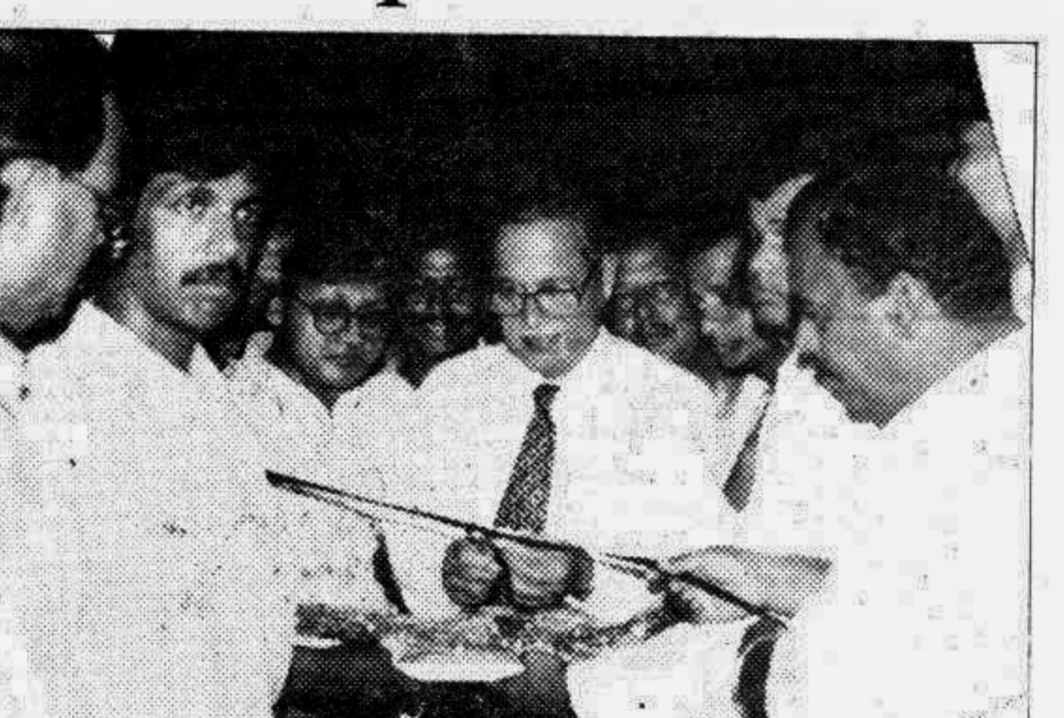
Deputy Leader of Opposition in Parliament Dr A Q M Badruddoza Chowdhury inaugurating Faridul Huda Memorial Clinic in Brahmanbaria. The clinic was named after late Dr Faridul Huda, a former state minister during BNP regime.