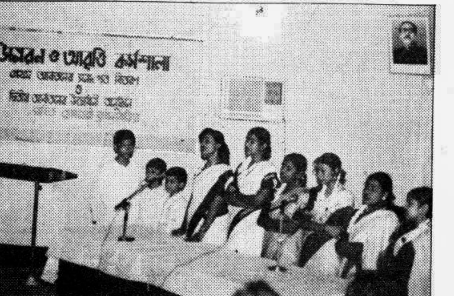
Child artistes rendering songs at the inaugural programme of a workshop "Uchcharan-O-Abritti" organised recently by Brahmanbaria Shatiya Academy in Brahmanbaria.