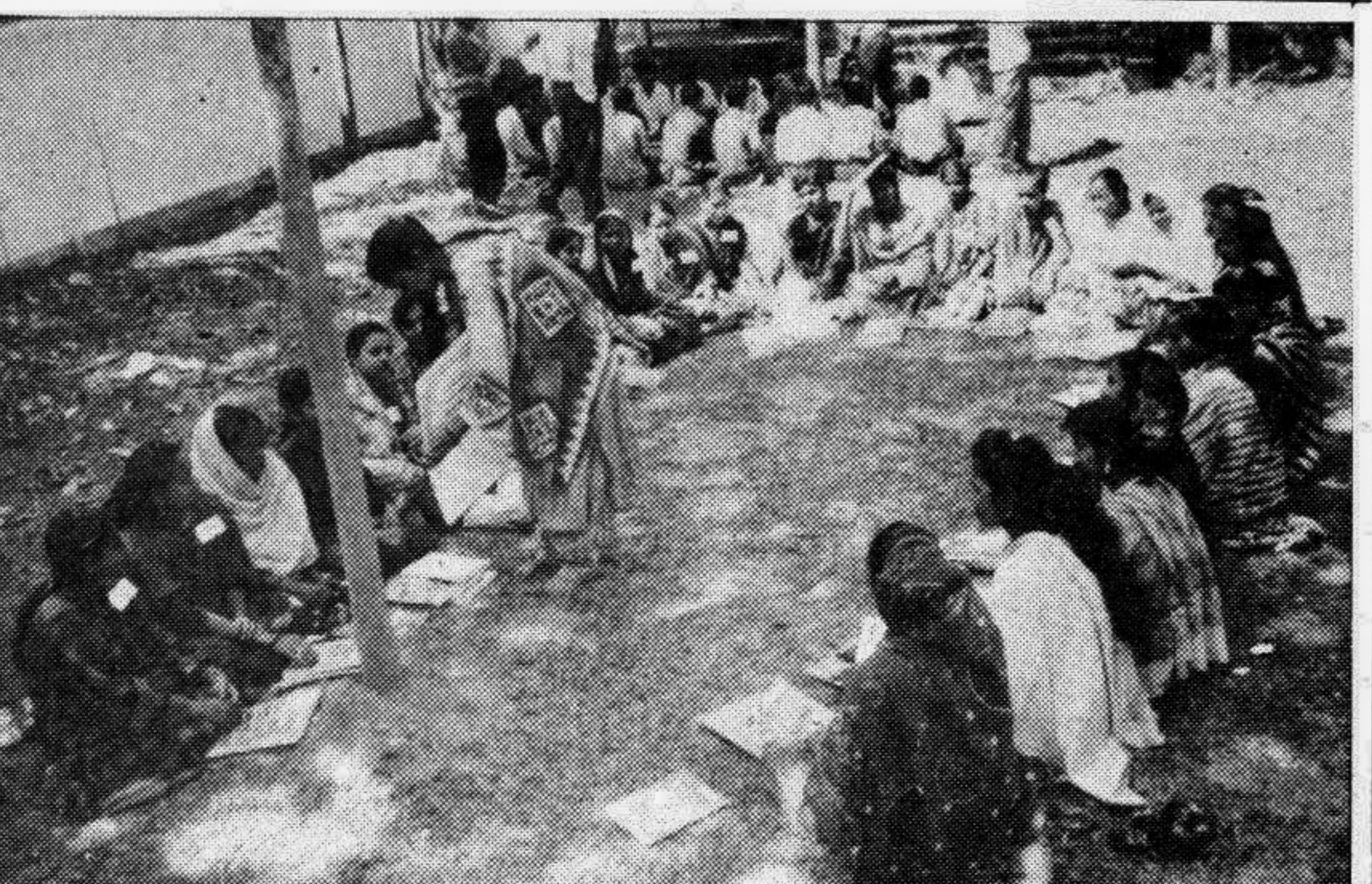
Teachers of TLM programme undergoing training at a centre.

Five persons including four members of a family drown at Khaljura Beel in Akhaura thana when a boat capsized by gusty weather in the beel at around 3:30 pm recently. According to family sources, 10 passengers were going by a small engine driven boat through Khaljura Beel from Akhaura cremation ground to Anowarpur. When the boat was in the middle of the beel, a gusty wind accompanied by rain started.