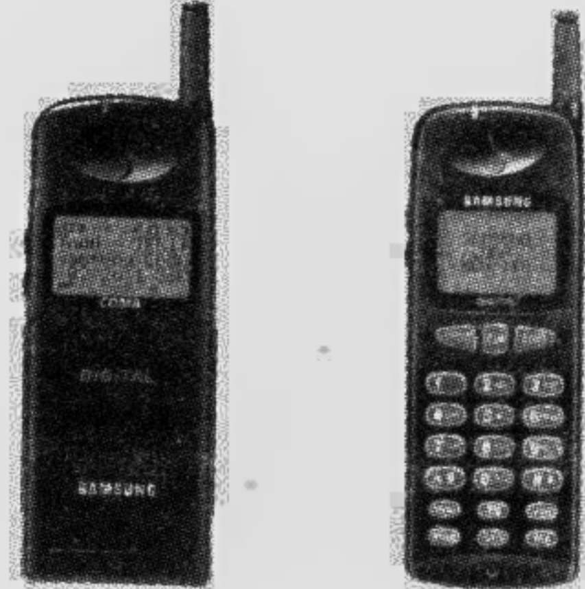
SAMSUNG SCH 210 Taka 9,900/-

“ Buy a mobile phone without the usual expenses. Now that is a smart move. ”