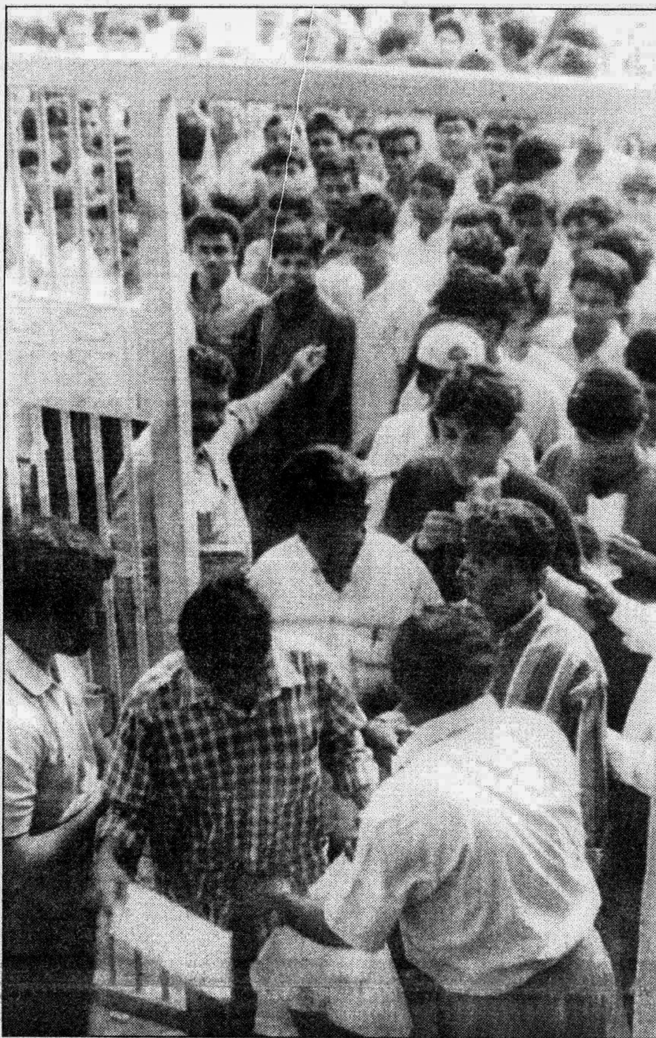
Invigilators at Jagannath College were more active than normal yesterday as they conducted a body search on all BCS examinees who sat for the compulsory English test. As a result, a huge queue was automatically created outside.