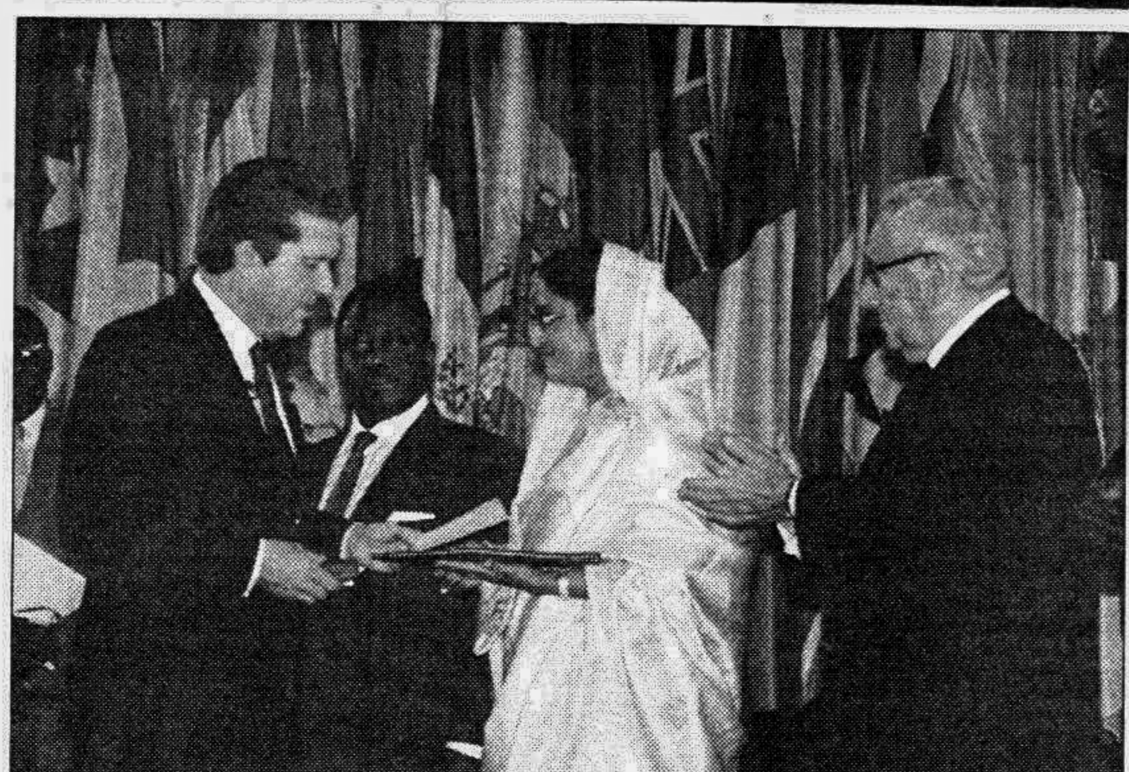
Unesco President Federico Mayor presents Prime Minister Sheikh Hasina (C) with the Houphouet-Boigny peace prize as former US Secretary of State Henry Kissinger (R) applauds during an award giving ceremony at Unesco headquarters in Paris yesterday.