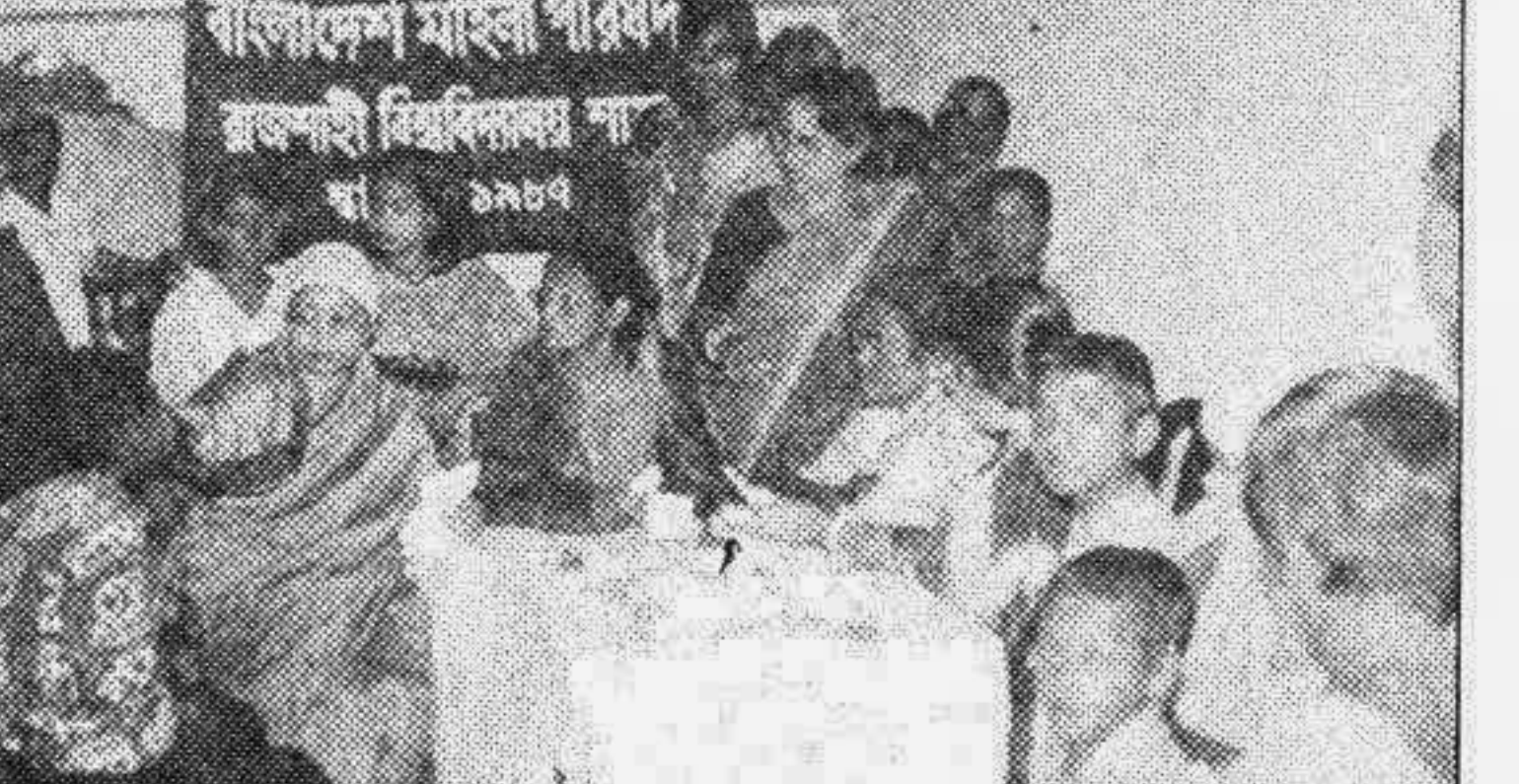
Rajshahi University unit of Bangladesh Mohila Parishad launched a free treatment programme among the destitutes of the adjoining villages every Friday.