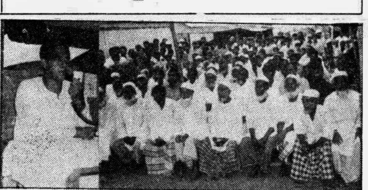
Maj Gen (retd) Subid Ali Bhuyan, a distinguished freedom fighter of our liberation war launched an eight-day meet-the-people tour from September 13 to 20 to the remote villages of the eastern and western unions of Muhammadpur-Panchgachhia, Maruka and Galmari unions under Daukdandi thana in Comilla district.