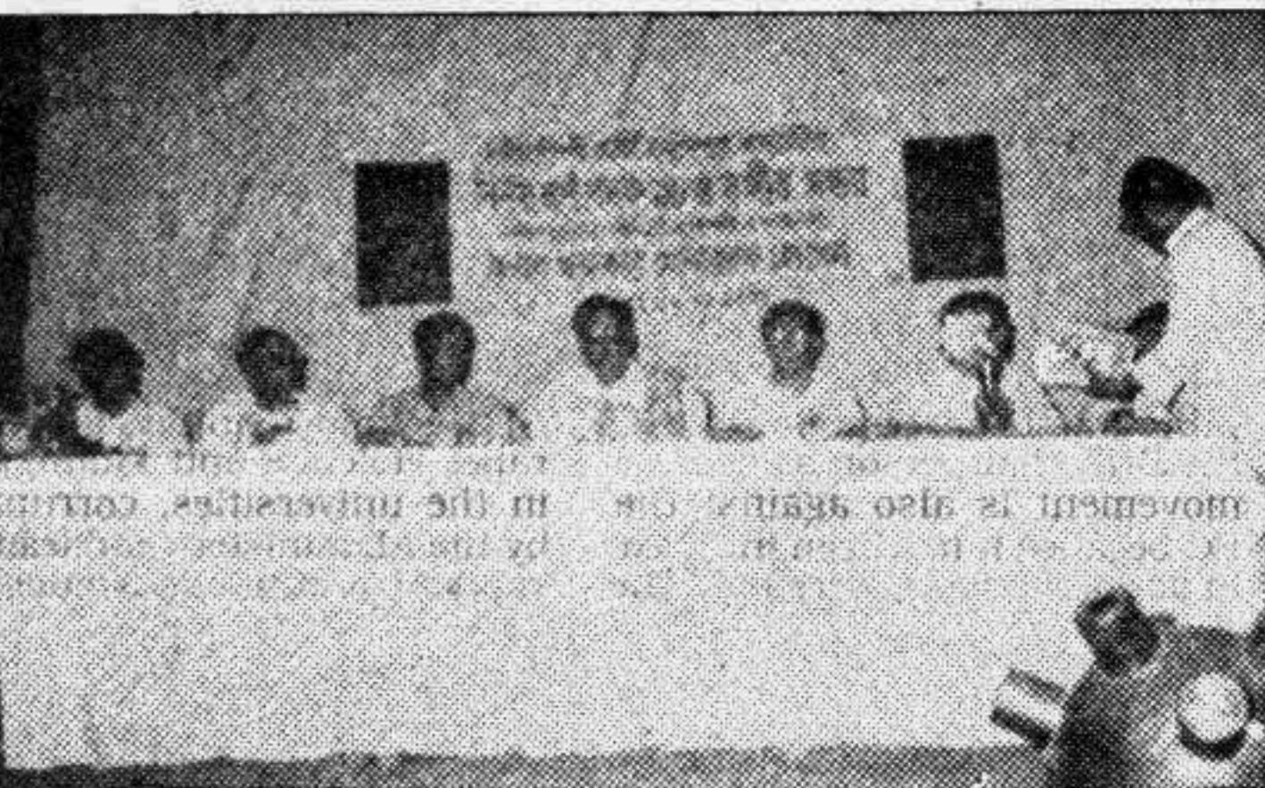
Nirnay gold medal awarding ceremony and a musical soiree have been arranged by the Nirnay group of industries recently at Kabi Jasimuddin hall in Faridpur.

Mosque-based libraries set up NETRAKONA, Sept 22: Islamic Foundation of Netrakona district branch set up 15 mosque-based libraries and two book clubs in different mosques and madrasas in 10 thanas in the last fiscal year, reports BSS.