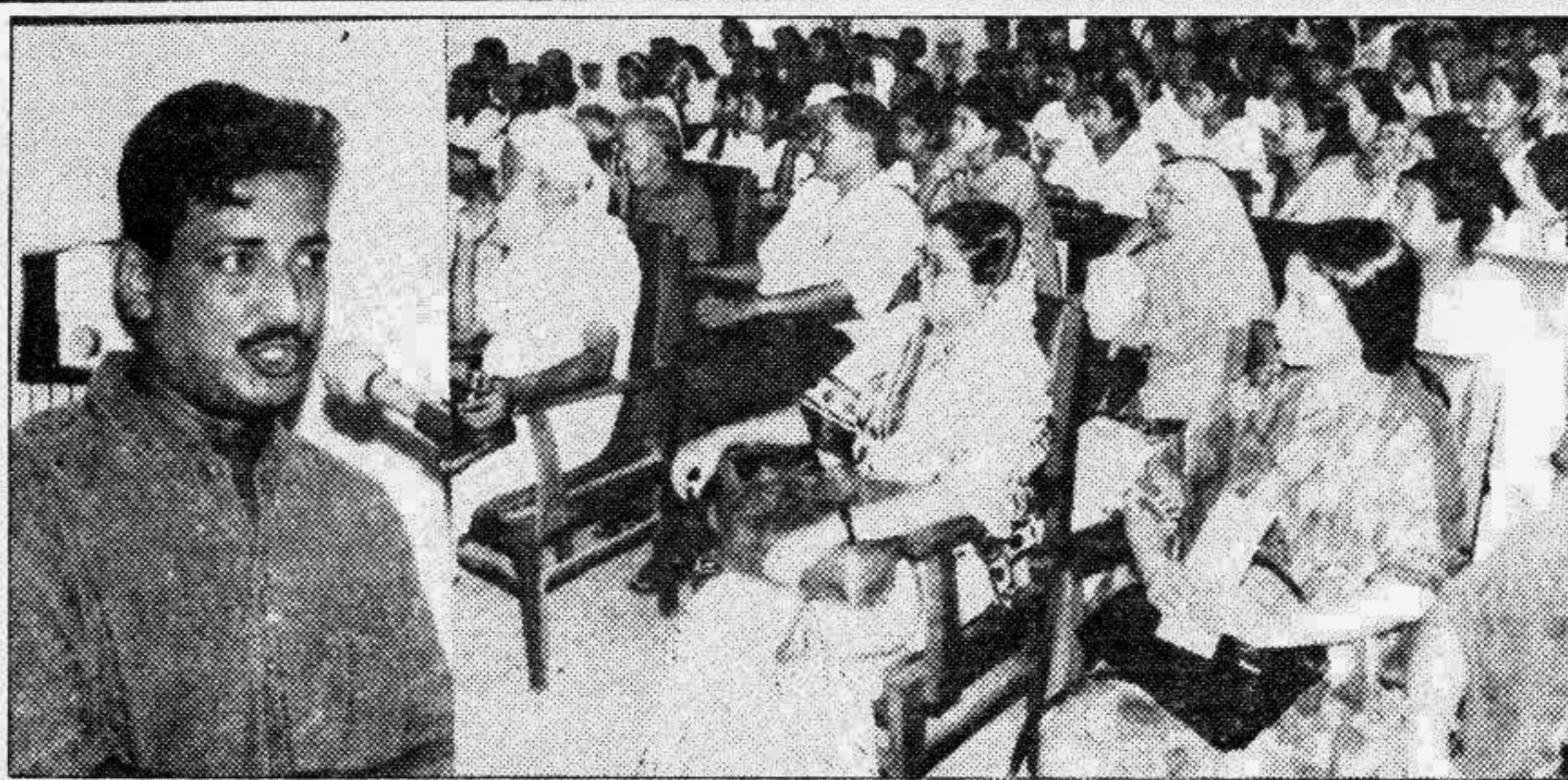
Healthy city plan: Mijanur Rahman Minu, Mayor of Rajshahi City Corporation addressing recently a motivational meeting of Rajshahi healthy city plan.

Meanwhile, the government sanctioned Taka 4.16 crore for the protection of Jhalakathi town from the erosion.