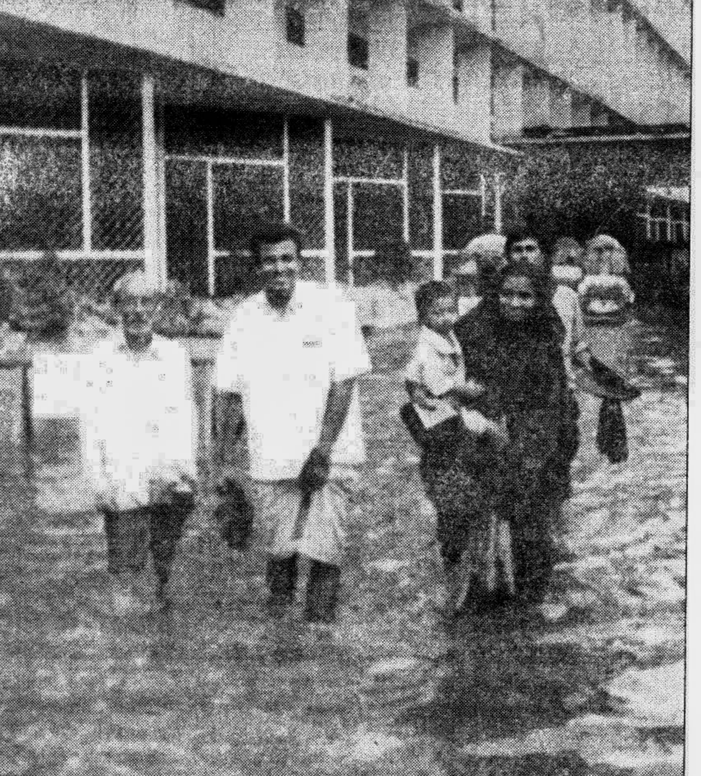
Many city roads went under knee-deep water due to incessant rains yesterday. Picture shows premises of the GPO.

"I'll not stop until giving farewell to the betrayers... the corrupt and subservient government... the Indian agents."