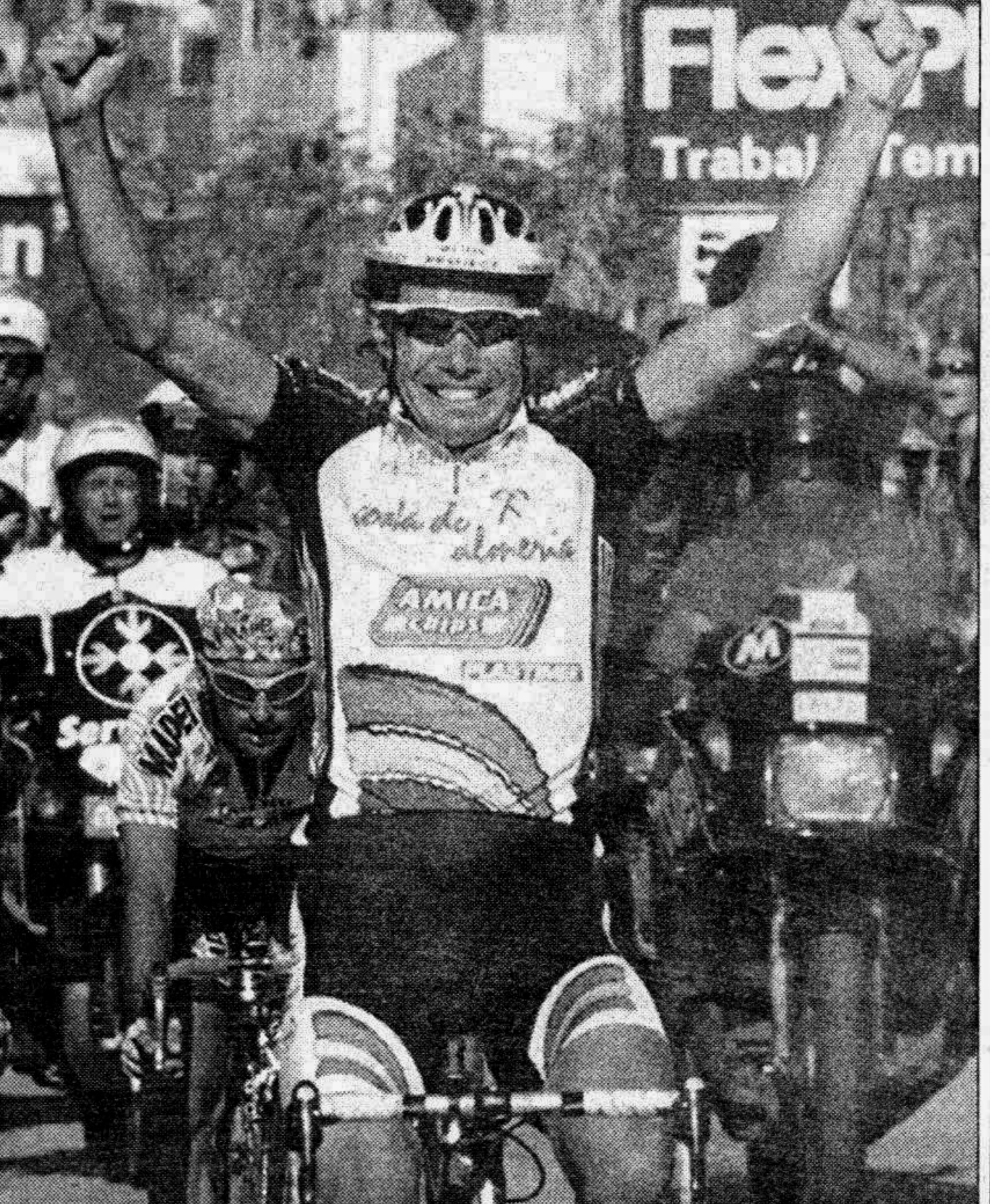
Russian Vjatceslav Ekimov celebrates after winning the 15th stage of the Tour de Spain at Valcencia on September 20.

Said Bild: "Paris, what more beautiful place to fall in love?"