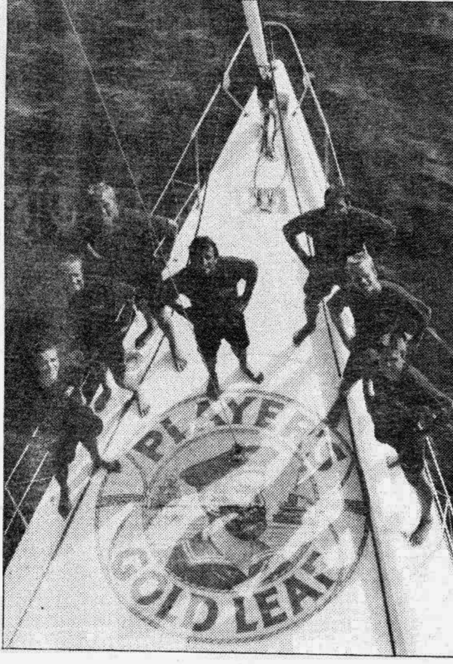
The John Player team on the Discovery voyage.

The John Player Gold Leaf, an 80ft Maxi racing yacht, left Tower Bridge on June 19, bound for the Voyage of Discovery. The proposed 170-day voyage will see the yacht skirting the coastlines of three continents through some of the world's most interesting waters, including Oman, Pakistan, the UAE, India, Sri Lanka and Bangladesh. With the final leg of the route taking the journey south, the Voyage of Discovery finishes in the Bay of Bengal.