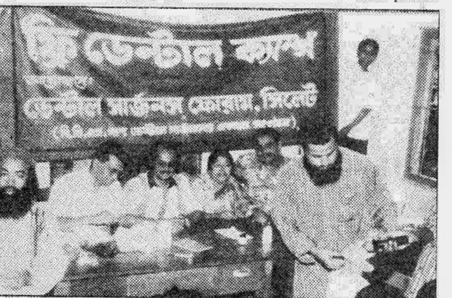
A free dental camp was organised by Sylhet Dental Surgeons' Forum on Friday at the government orphanage at Bagbari in the divisional town.