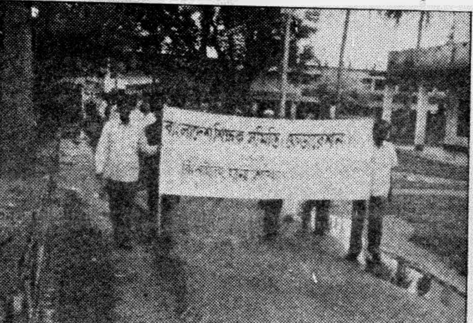
Jhenidha district unit of Bangladesh Teachers' Association brought out a procession recently in the district town as part of their country-wide programme.