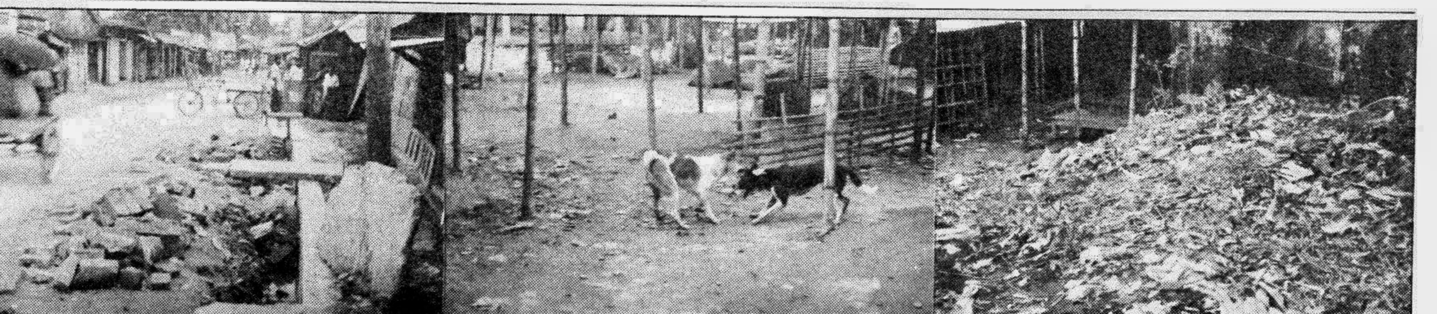
Municipal authorities' indifference: (Left):Drains built by Sailkupa Municipality a few months back have been broken down due to usage of 'low quality materials'. (Middle) The menace of pye dogs has increased due to negligence of the municipal authorities. (Right) Piled up garbages have become an ideal breeding ground of mosquitoes, but who cares?