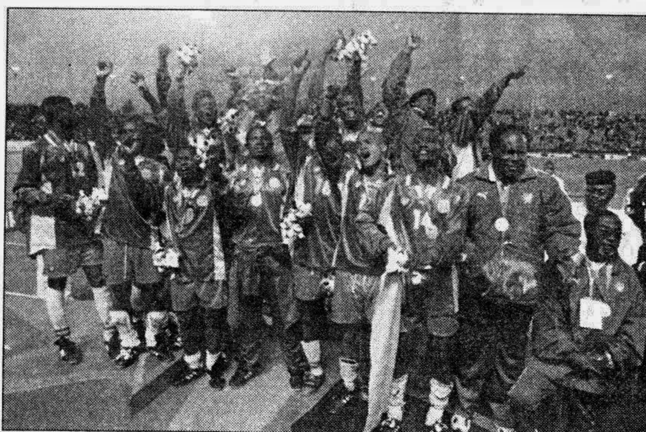
Jubilant Cameroon players and officials celebrate their victory over Zambia in the soccer final of the All Africa Games at Johannesburg on September 19.

"My view however is that it is fraud, that we are looking at... sort of, not white collar crime, but a tracksuit crime. It is about defrauding the Australian public, it is about defrauding your sponsors, it is about defrauding other athletes of their chance at an Olympic gold medal."