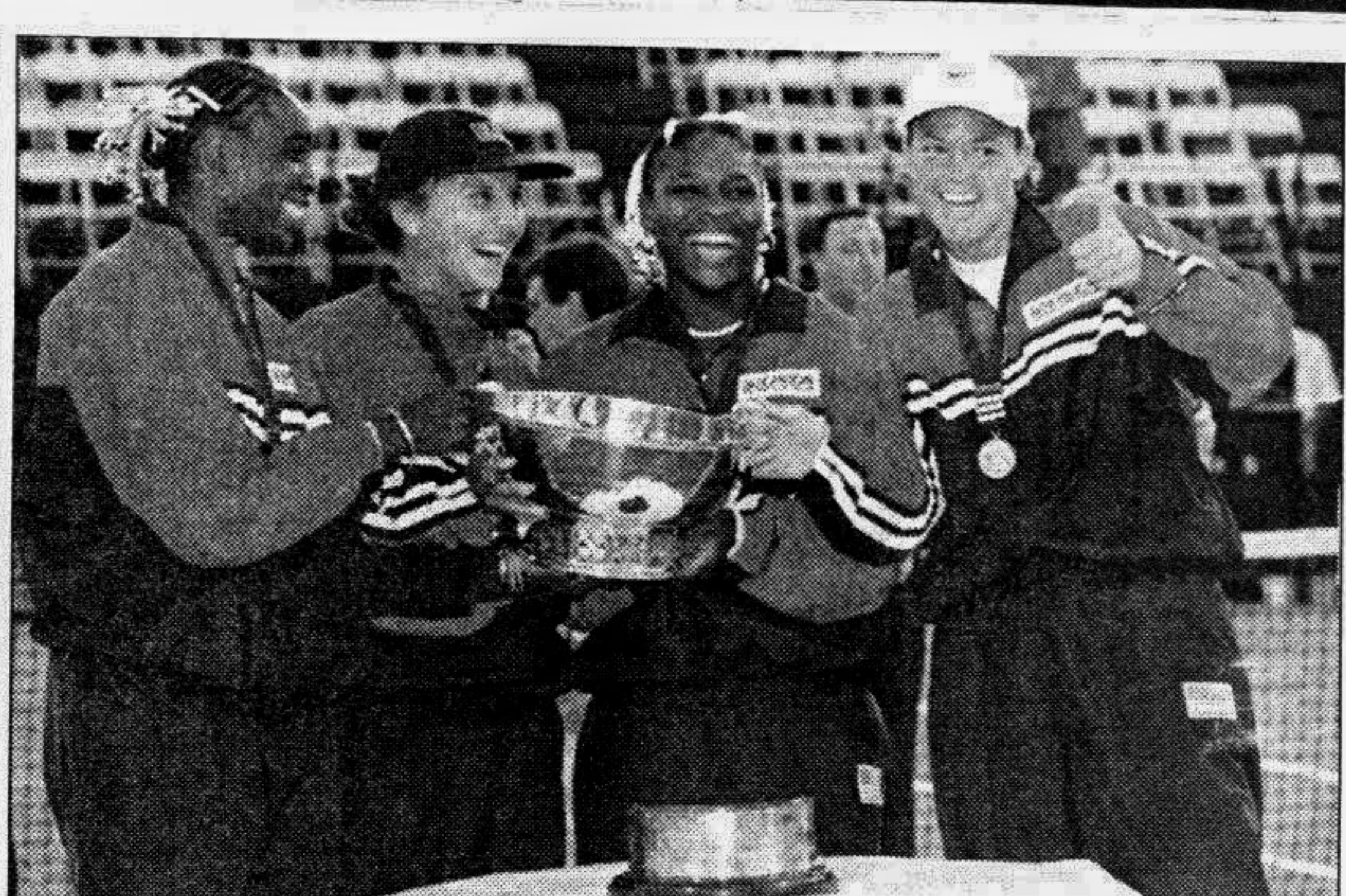
Members of the American Fed Cup team pose after receiving the prestigious trophy.