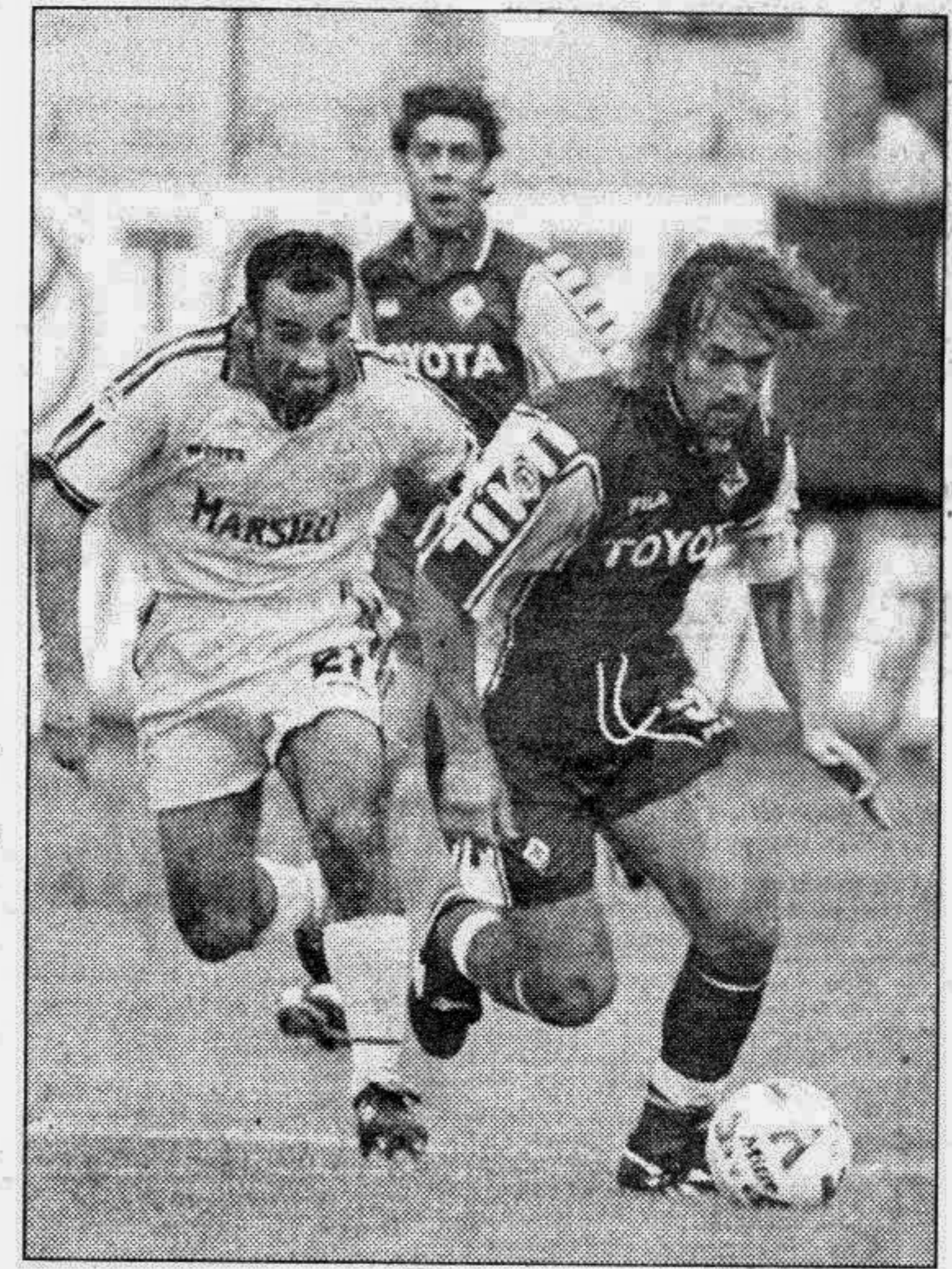
Fiorentina's striker-supreme Gabriel Batistuta (R) in his elements against Verona during their Serie A tussle at Florence on September 19.

Saturday's matches finished with a disappointing 1-1 draw for champions AC Milan at Bari and a 3-0 victory for Hidetoshi Nakata's Perugia over Cagliari.