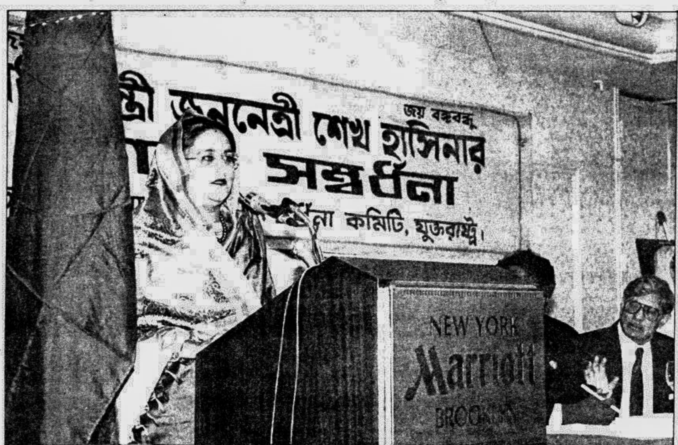
Prime Minister Sheikh Hasina speaks at a reception by US-based Bangladeshis at Marriott hotel in New York Sunday.

By Staff Correspondent Awami League meets today to discuss preparations for the planned public reception to Prime Minister Sheikh Hasina on the reception 26 at Paltan Maidan.