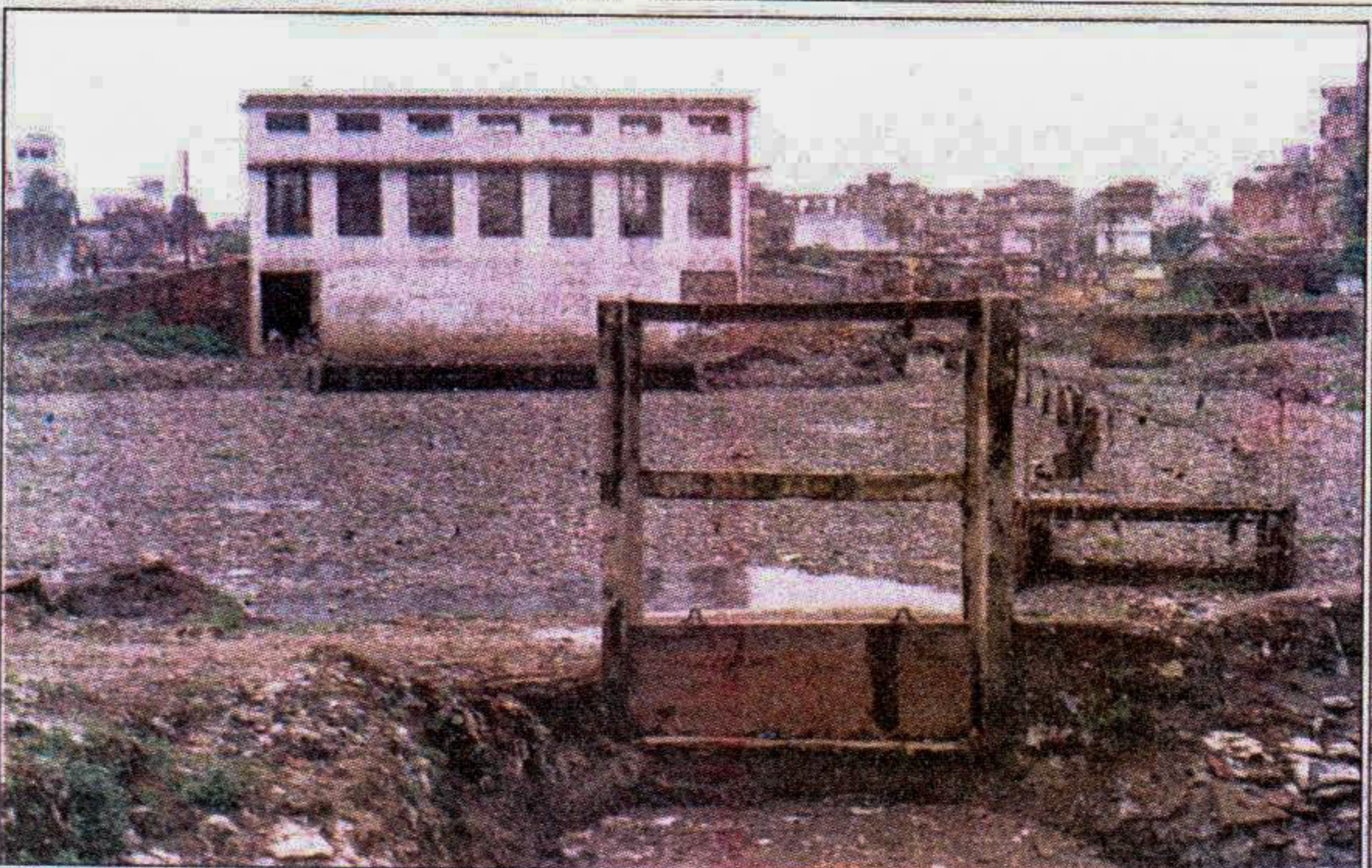
The WASA pump house at Dolaikhal which flushes treated sewage into the Buriganga finds it difficult to cope with the discarded plastic shopping bags. The picture on the right shows the four outlets which have virtually ceased functioning. The other picture shows bags floating on the lagoon by the pump house.

The authorities had formed a nine-member medical team for the treatment of the poet that advised sending him to Singapore.