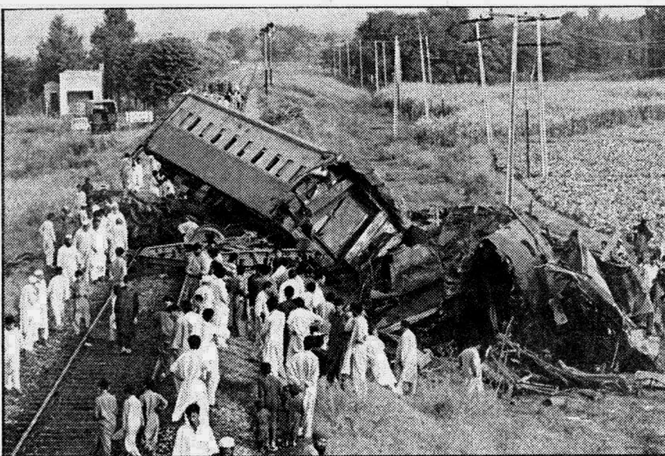
Wreckage of the train that crashed in Pakistan Saturday night. At least 23 passenger were killed when the train collided with a runaway engine 30 kilometers off Islamabad.

The victim's younger brother Abdul Motaleb filed the complaint case.