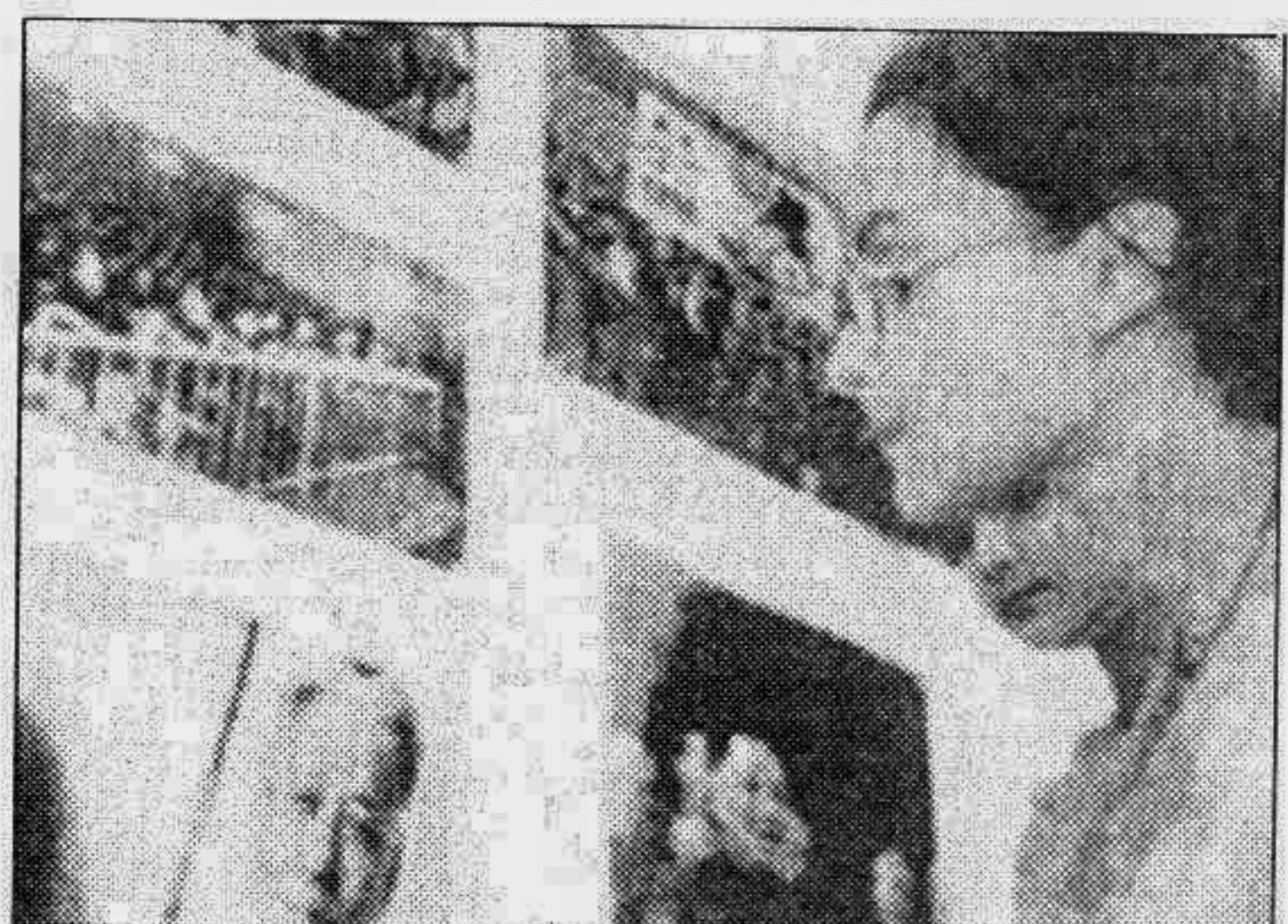
Viewers appreciate the photographs on China at Shilpakala Academy

liament, farming and crop production, technical development etc. Aerial photos of the urban and rural China show the impressive architecture of the nation as in the photographs of the central hall at Beijing taken by Lan Hanguang, during the second session of the ninth National People's Congress (March 5, 1999).