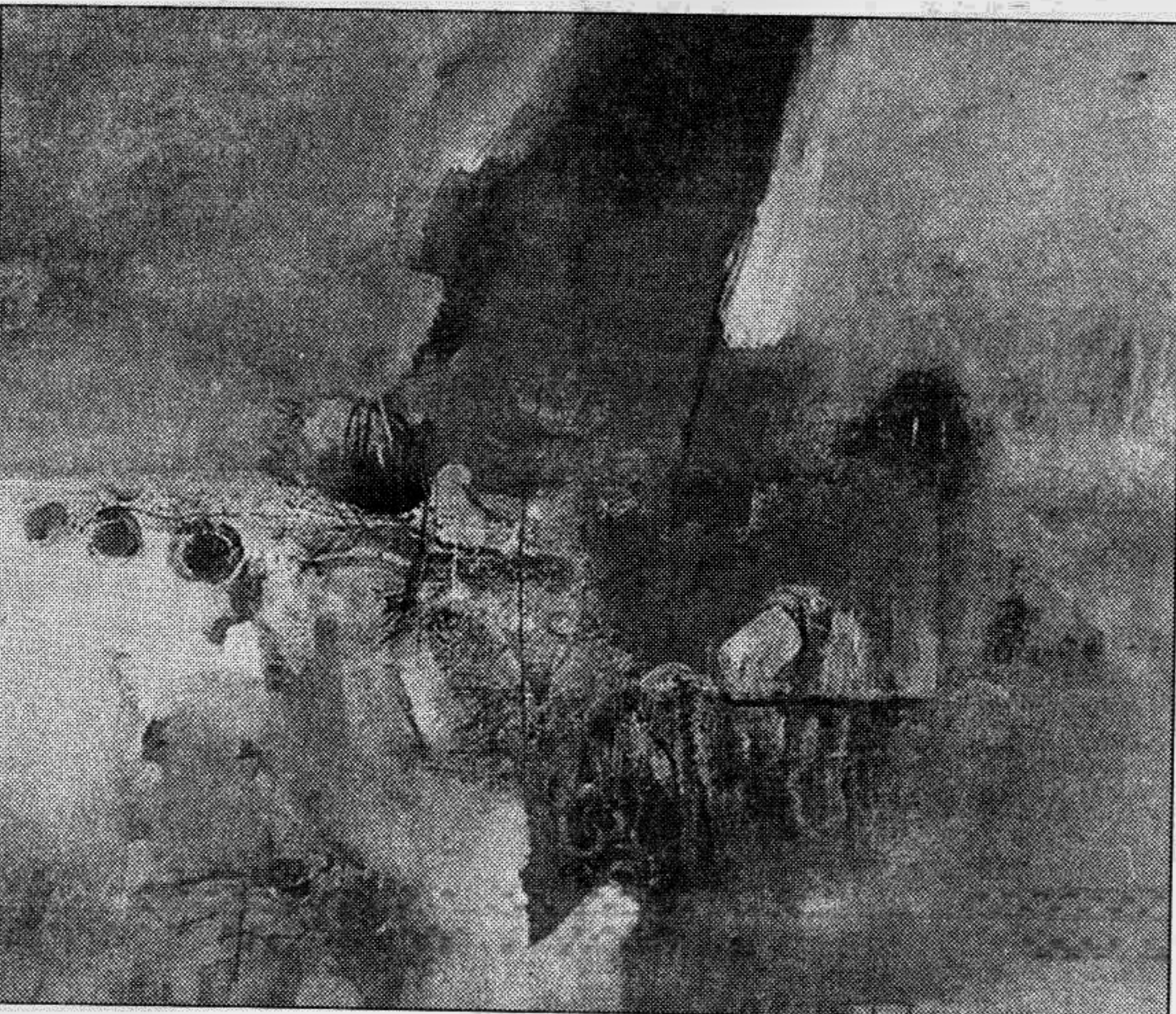
RHYTHM-3 Acrylic on canvas

Design. The influence of graphic design is clearly evident in his paintings. Use of special textures also prove his excellent skills as a printmaker.