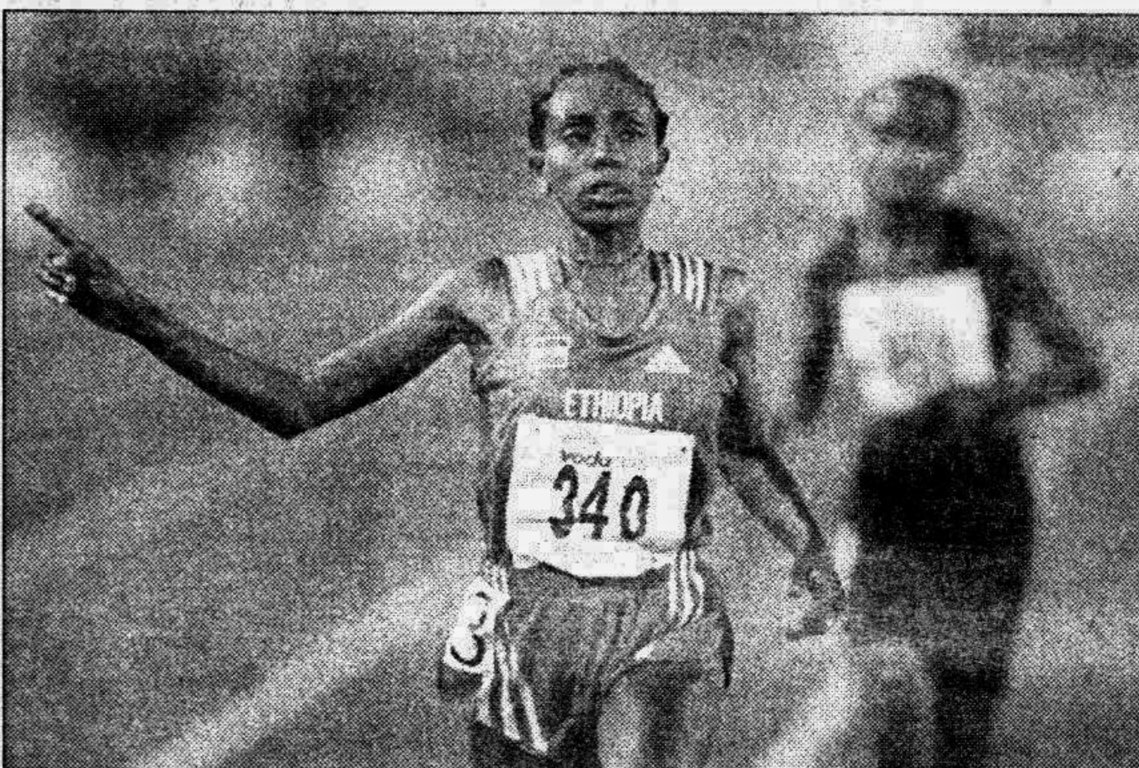
Gete Wami of Ethiopia celebrates after winning the 10000 metres race at the All Africa Games on September 17.

The other quarterfinals will be staged in Sousse and Yaounde on Sunday.