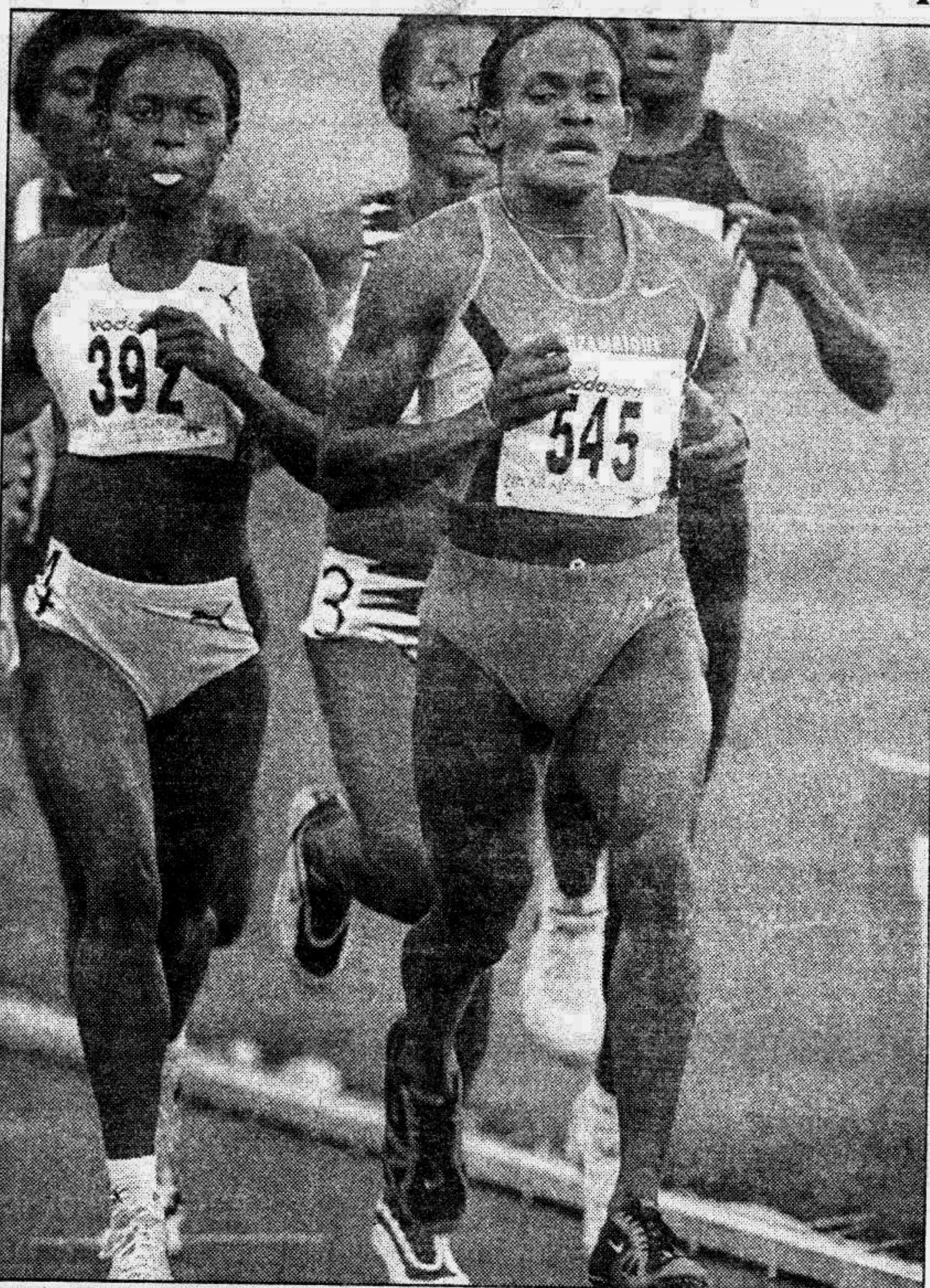
Maria Mutola of Mozambique leads the pack in the 800 metres semifinal at the All Africa Games.