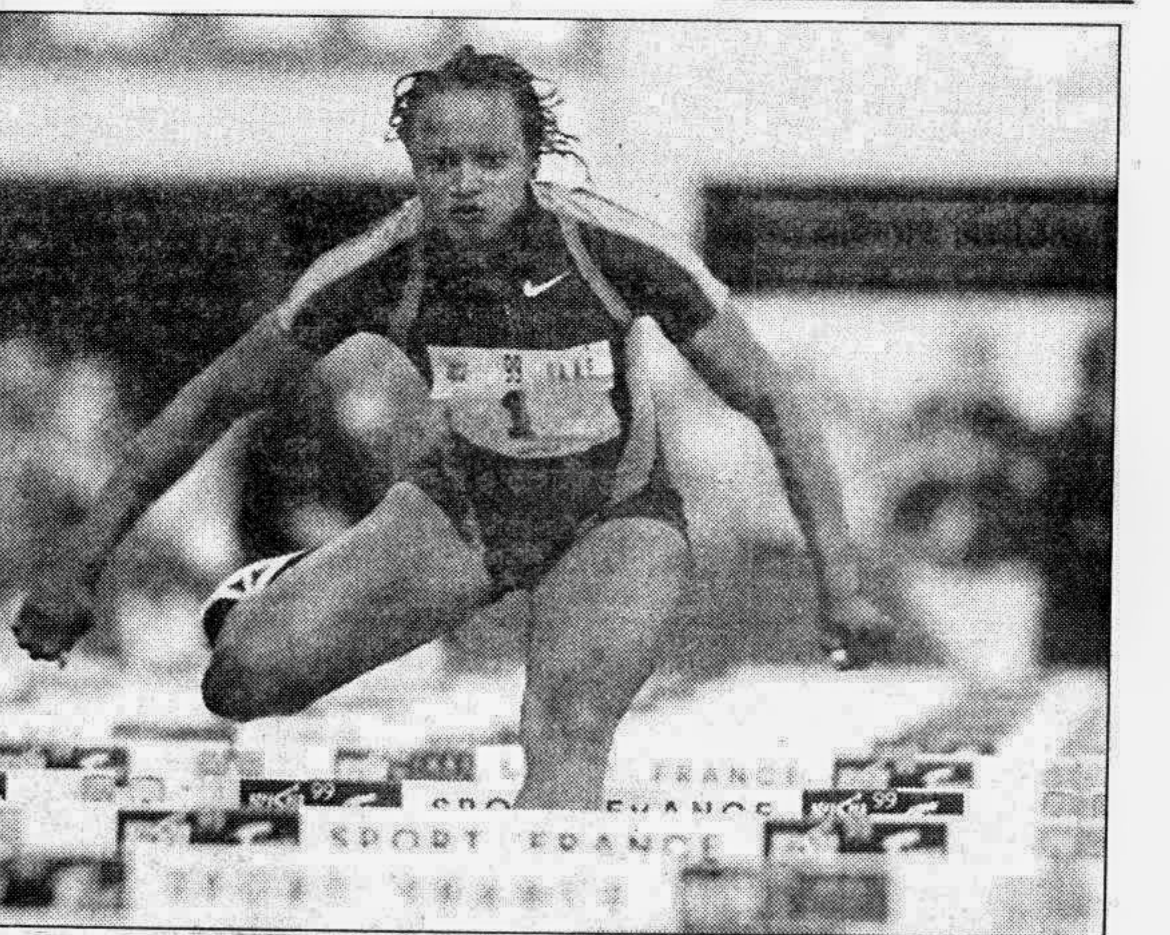
French heptathlete Eunice Barber glides over the hurdles during the 'Decastar' meeting in Talence yesterday.

"I'd prefer to lose a finger than lose a hand; in order to win, you also have to know how to lose," he told Brazilian newspaper Estado.