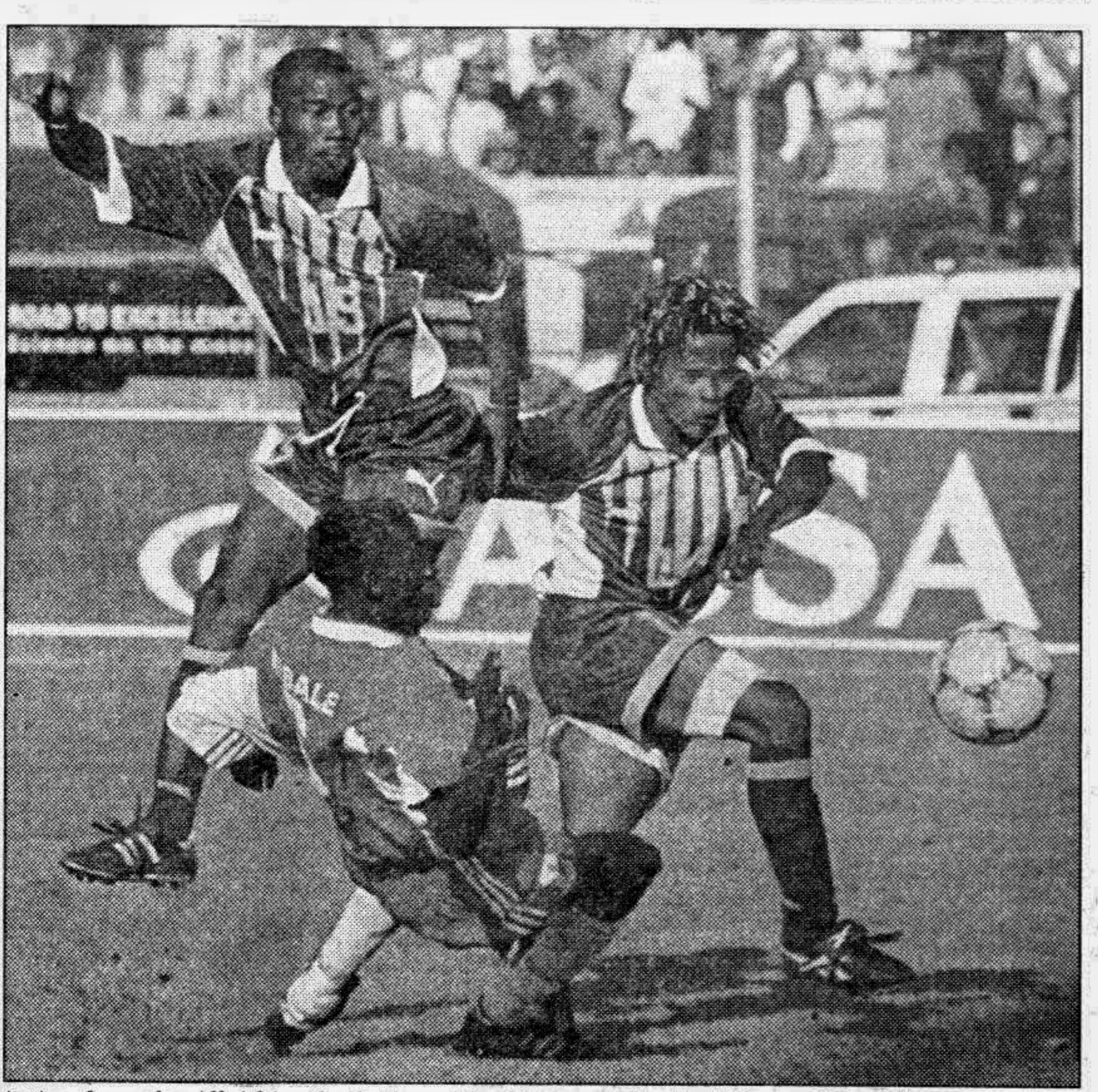
Action from the All-Africa football semifinal between South Africa and Zambia.

United have been criticised for operating a salary ceiling at Old Trafford and it is believed top earners like Australian goalkeeper Mark Bosnich take home around 30,000 pounds a week.