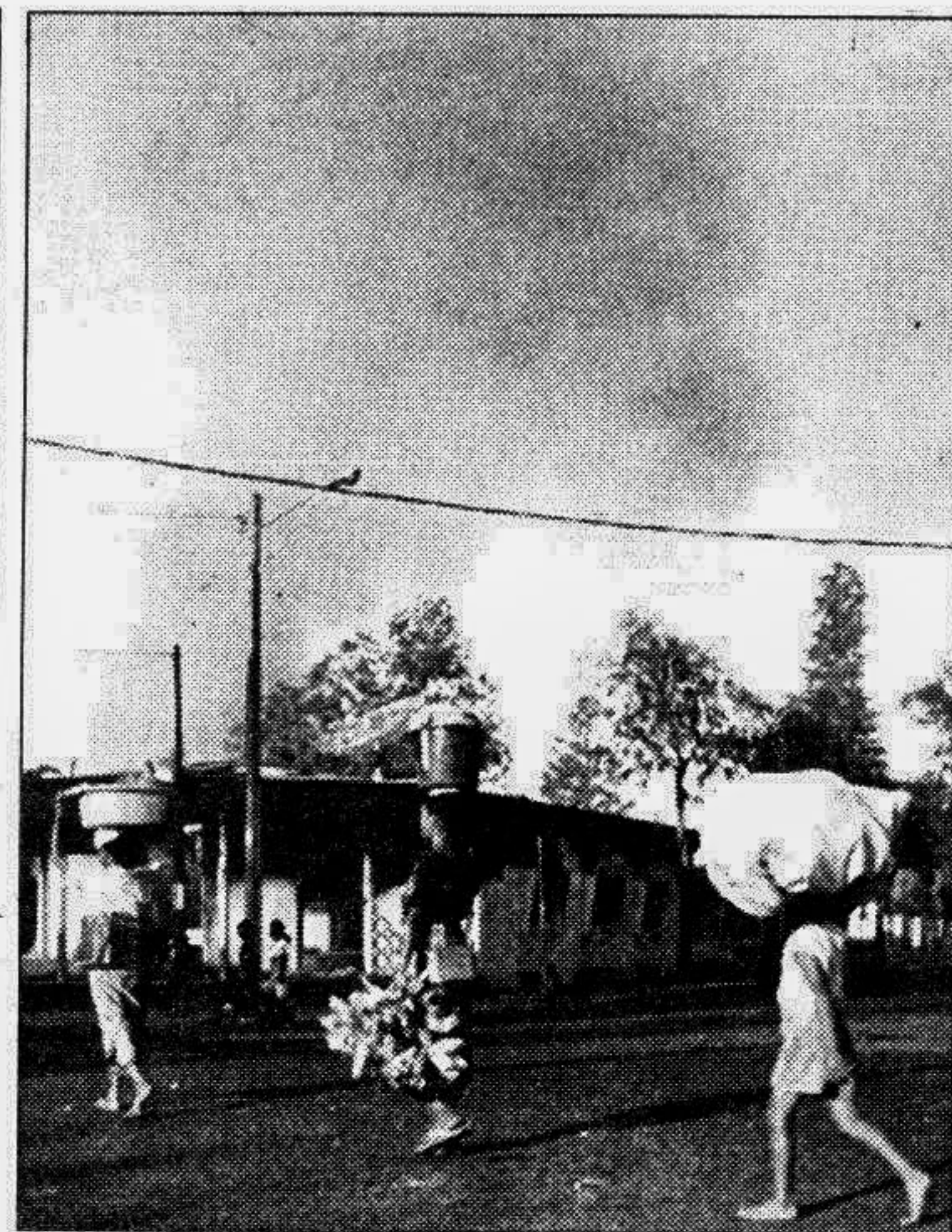
East Timorese women walk in front of a building which was burned by pro-Jakarta militias on the main street of Dili yesterday.

In another development, investigation has been started against the police officials and politicians who were financially benefited by Ershad for concealing his criminal acts since 1982, the year he joined Jatiya Party.