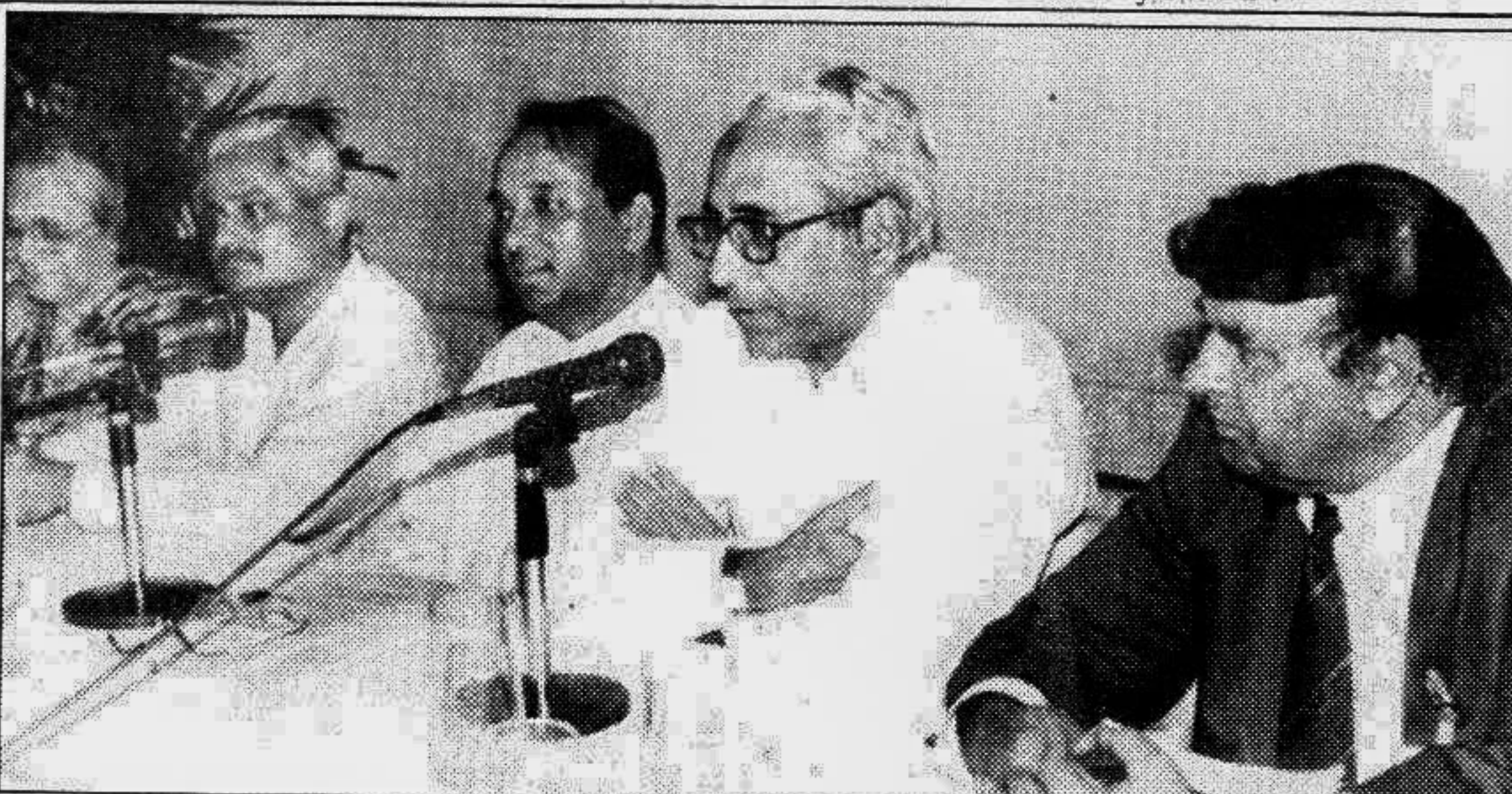
The member of Pakistan Tea Board arranged a press conference at Dhaka Sheraton Hotel yesterday.