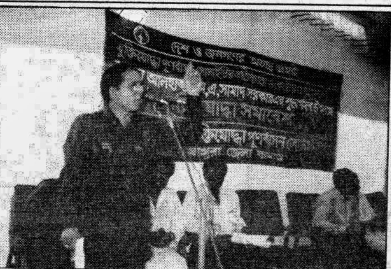
Magura district unit of Freedom Fighters' Rehabilitation Society organised a rally recently at the local press club premises.