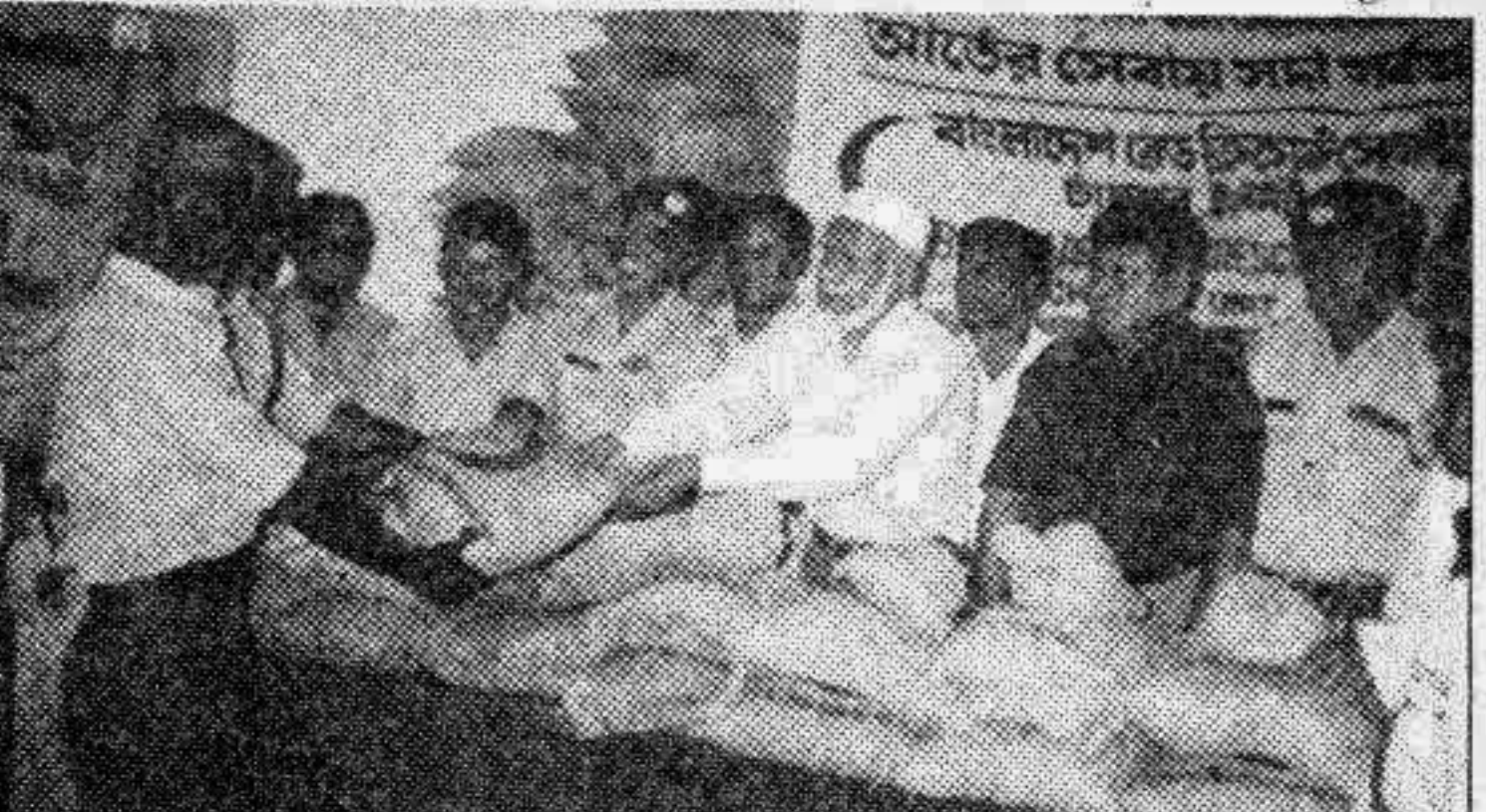
Chandpur unit of Bangladesh Red Crescent Society distributing relief materials recently among the volunteers of Community Police.