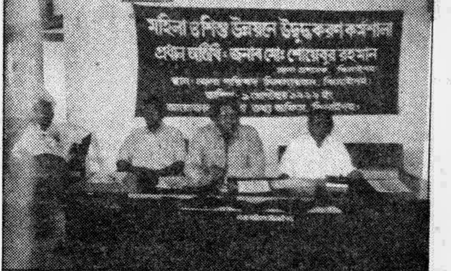
A seminar on "Motivation on Woman and Child Development" was arranged jointly by Jhenidah District Information Office and UNICEF on September 9 at Jhenidah Zilla Parisad auditorium.