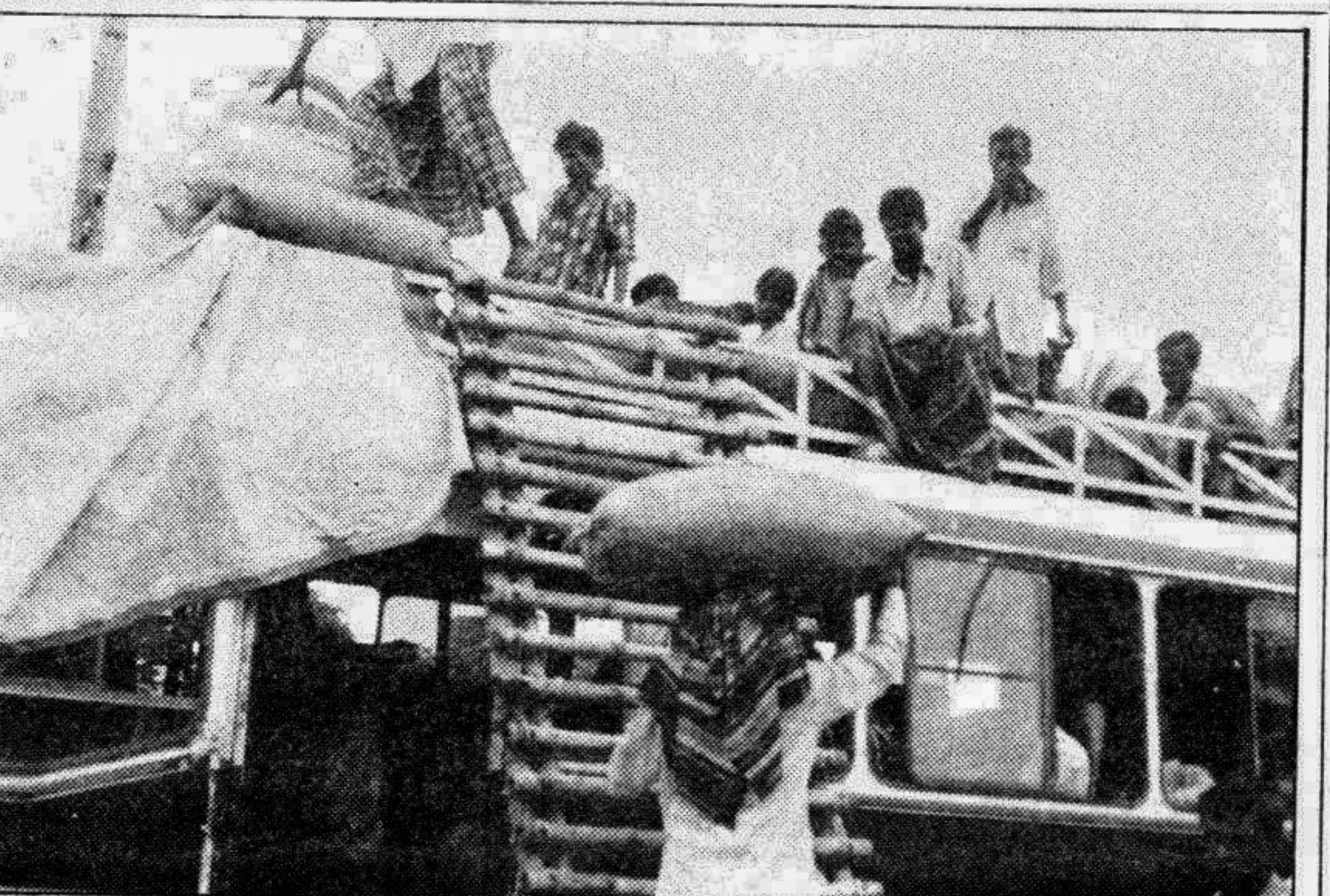
Smuggling of Indian goods including sugar is rampant in Jhenidah district. The contrabands are usually carried on rooftop of Barisal bound buses plying through Nimtala bus stand in Kaliganj of Jhenidah district.

Besides, non-government orphanages there are two government orphanages here.