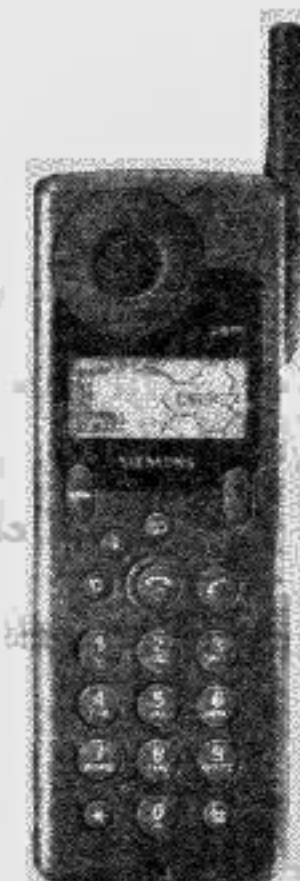
SIEMENS S6 D (Power)