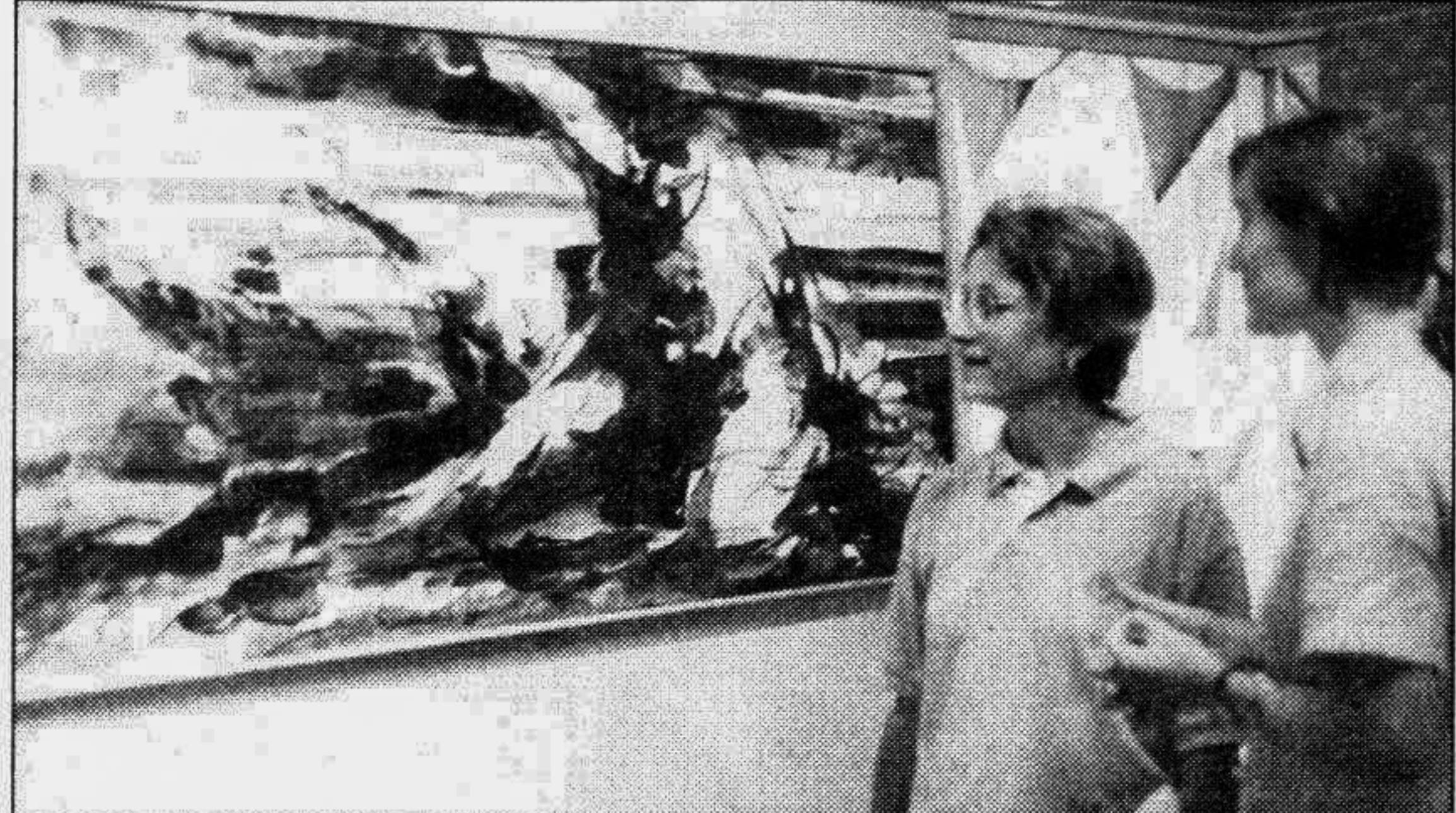
Connoisseurs appreciate a painting by renowned artist Shahabuddin Ahmed at a solo exhibition at Designer's Den Art and Fashion Gallery at Gulshan in the city yesterday.