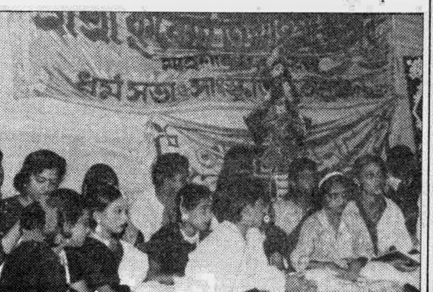
A session of devotional songs was arranged at Mohe-sangan Nat Mondir in Comilla town recently on the occasion of Janmastomi.