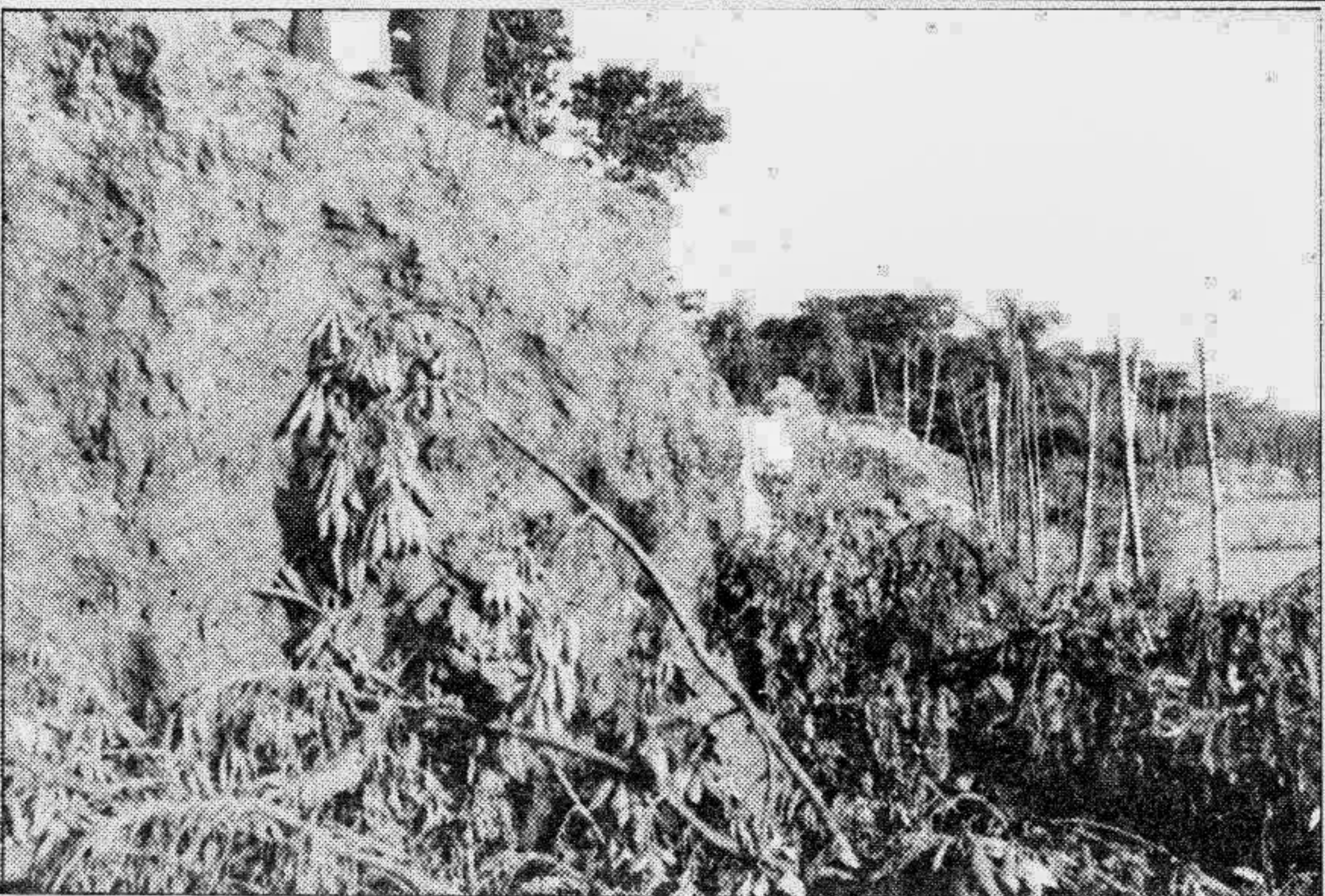
Checking erosion: Erosion by the Meghna in Chandrapur town is being checked by placing bamboos, trees, bricks and sand bags.

A good number of government officials, UP Chairmen, members and NGO activists took part in the workshop held at the Project Development Unit (PDU) auditorium of Bangladesh Tea Research Institute (BTRI) at Srimangal.