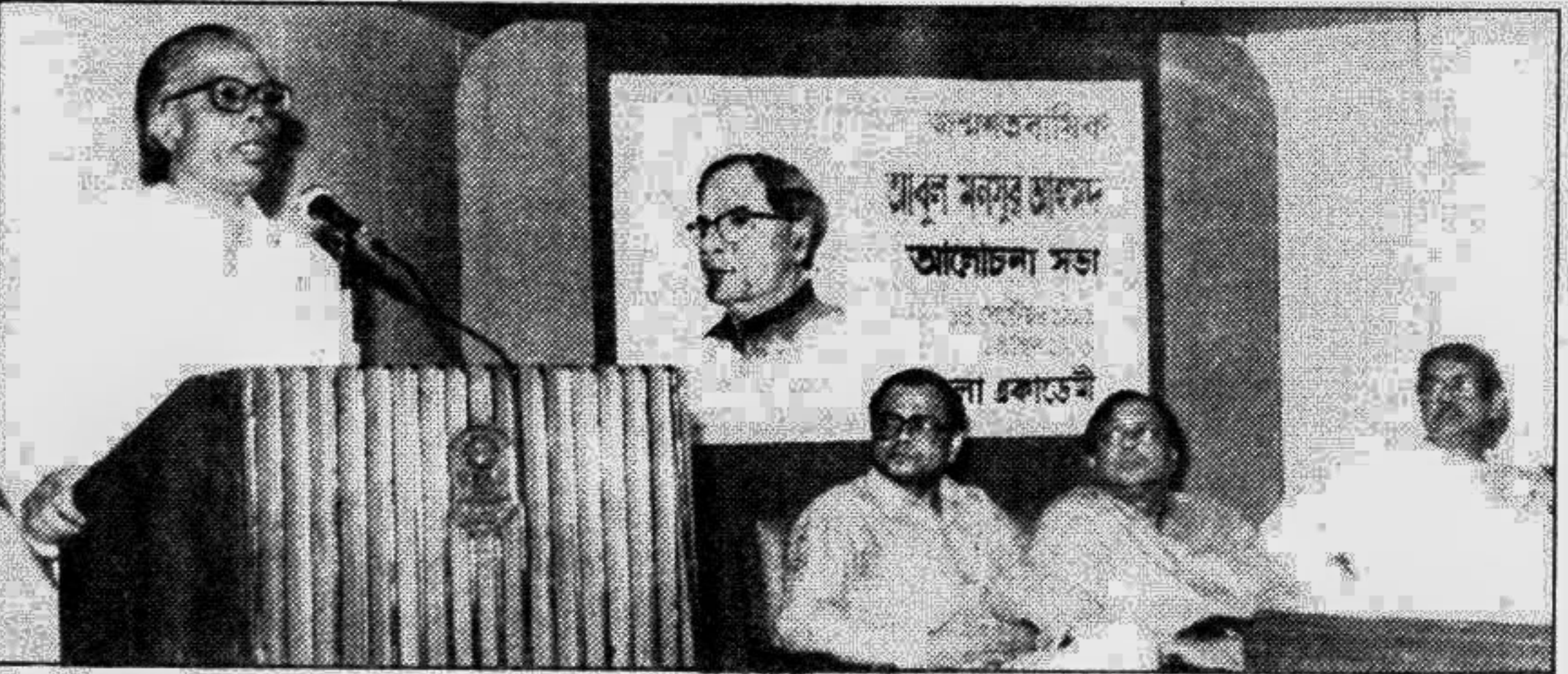
In Memoriam... Bangla Academy held a discussion meeting at its seminar room yesterday to mark the birth centenary of prominent journalist and writer Abul Mansur Ahmad.

He was one of the original proponents of a separate cultural identity of people of Bangladesh