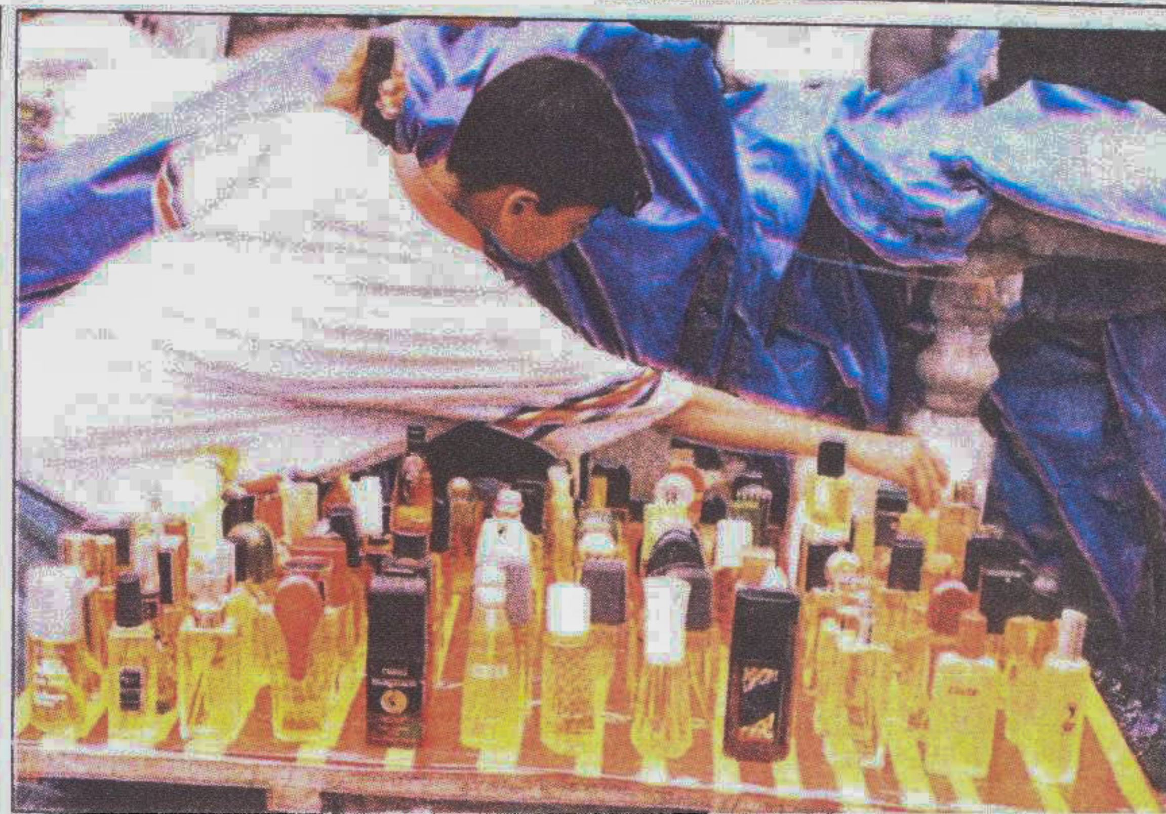
All that glitters... Jovan, Royal Magnum, Prophecy and what not. The bottles are real, the perfume not. A makeshift perfume shop in the city's Gulistan area.